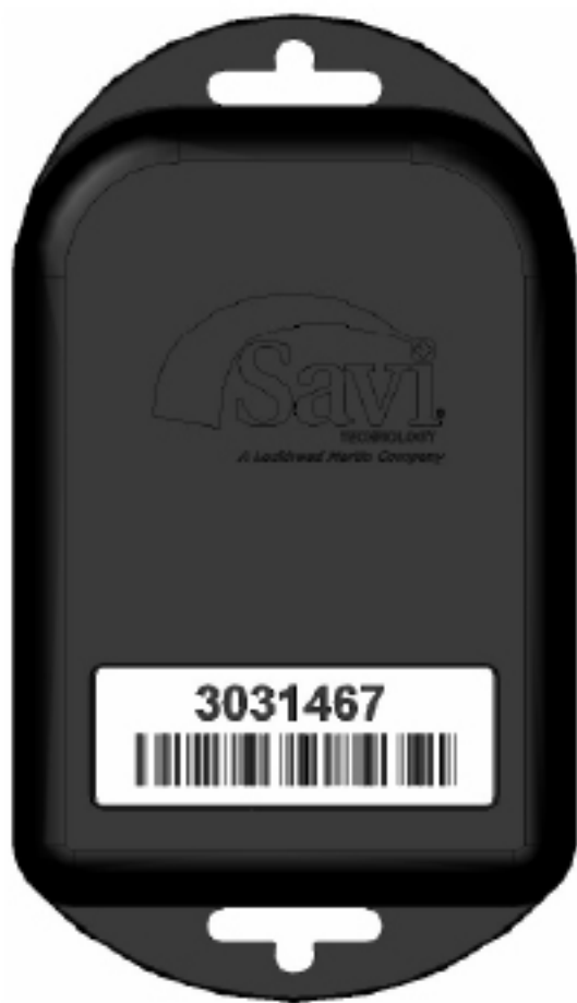
Figure 1: SaviTag ST-602-14 top view