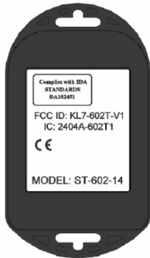
Figure 2: SaviTag ST-602-14 bottom view