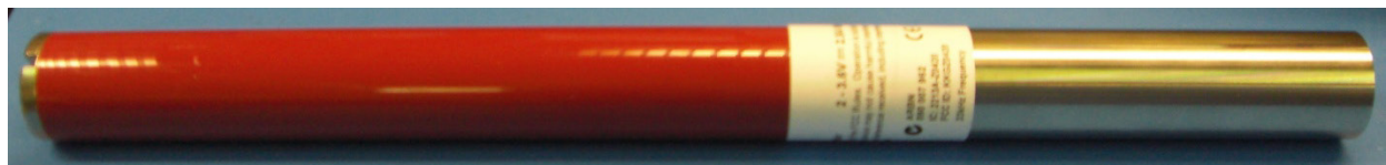
Side 2 of DX