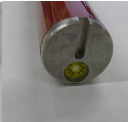
Temp Dot End