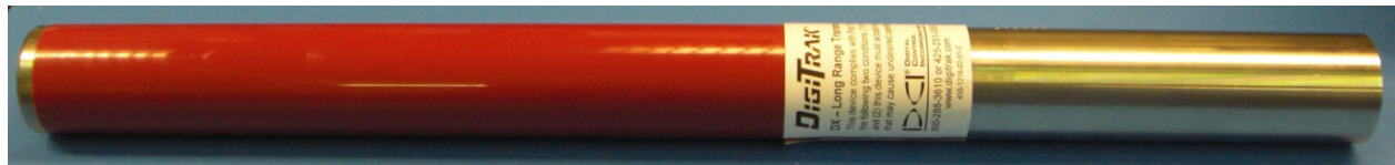
Side 1 of DX