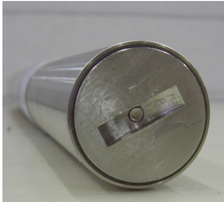
Battery Cap End