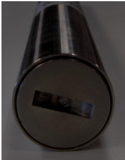
FXL 19.2 Rear End