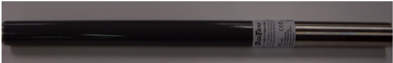
FXL 19.2 Side 2