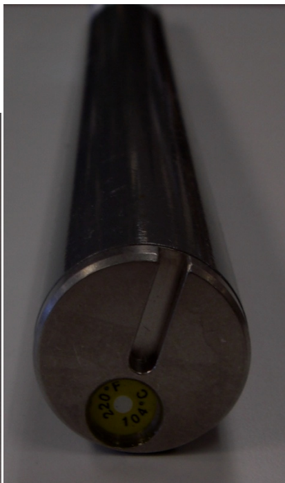
FXL 19.2 Front End