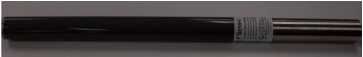
FXL 19.2 Side 1