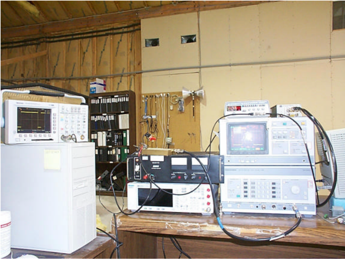
Figure 1: Amplifier characteristics test setup