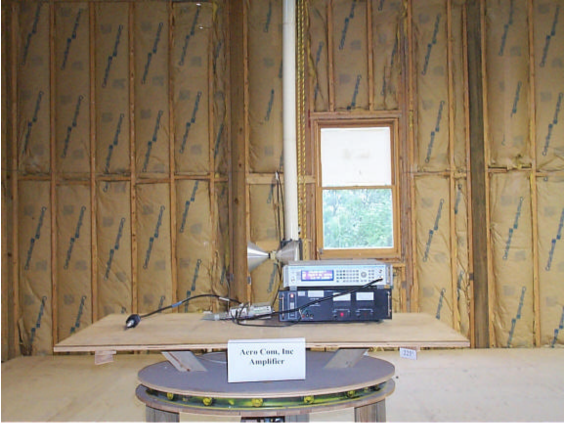
Figure 2: Radiated Emissions