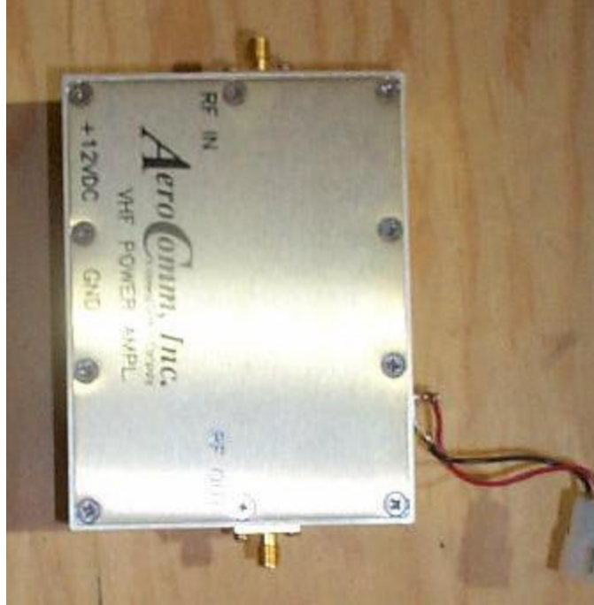
Figure 1: External Top view