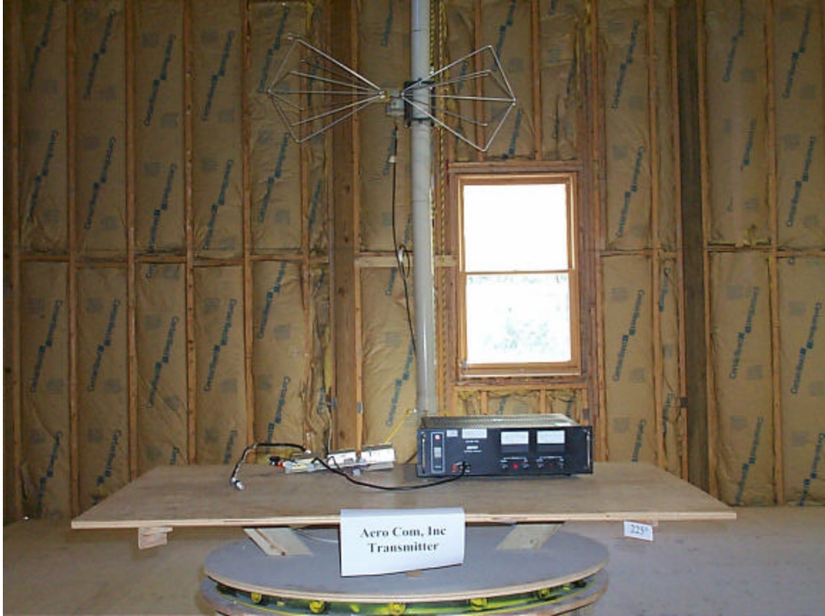
Figure 2: Radiated Emissions