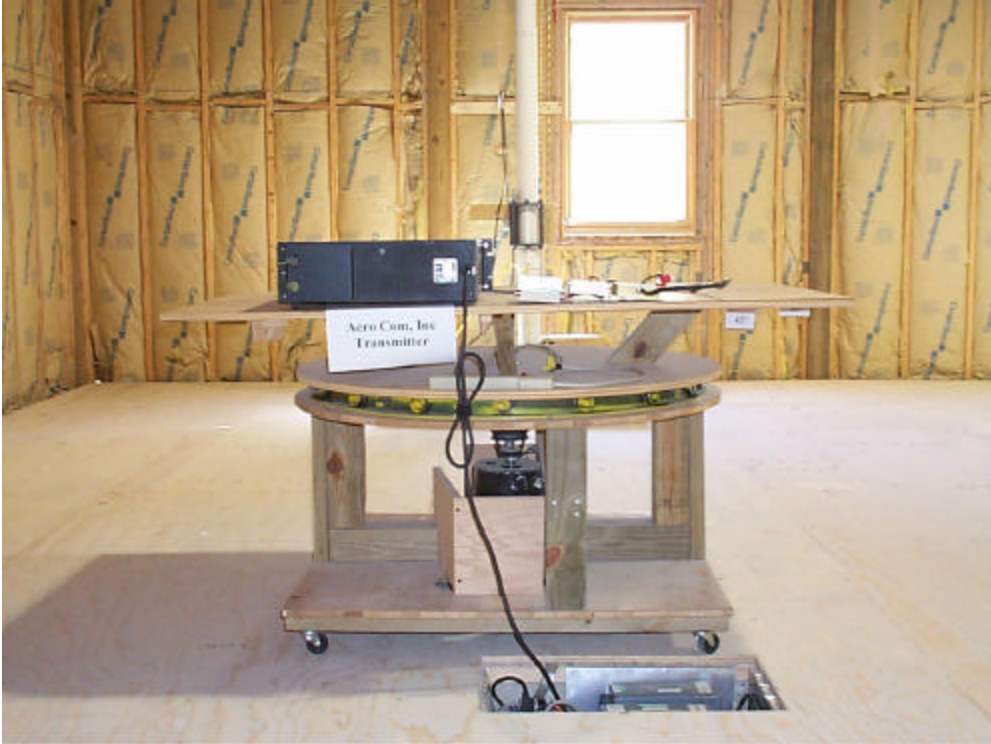
Figure 3:Condcuted Emissions