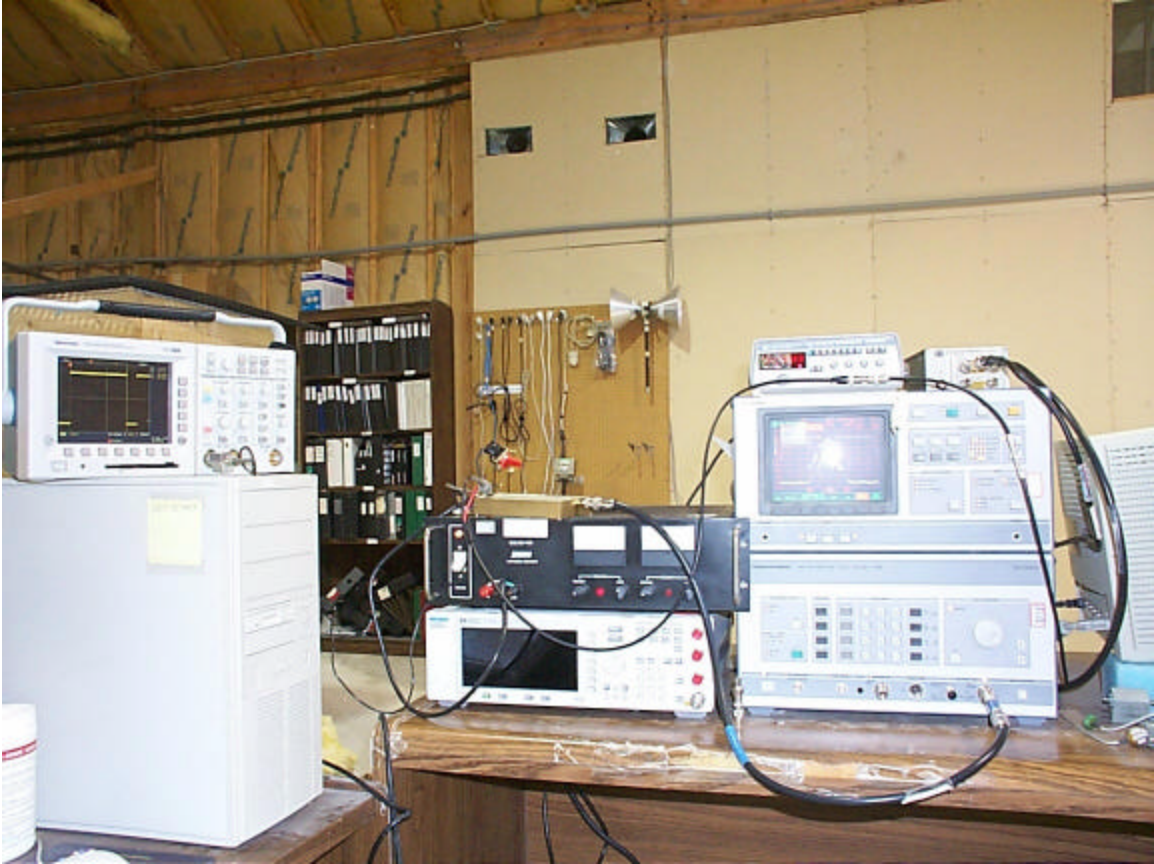
Figure 1: Transmitter characteristics test setup