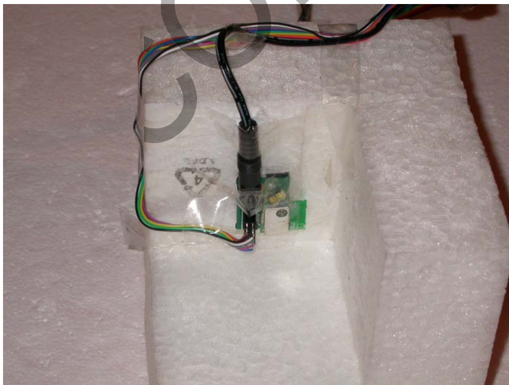
- Y axis -

Photograph present configuration with maximum emission