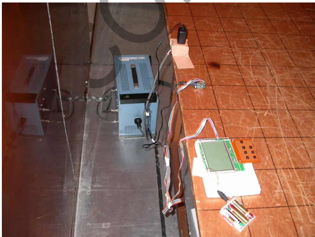
- Side View -

Photograph present configuration with maximum emission