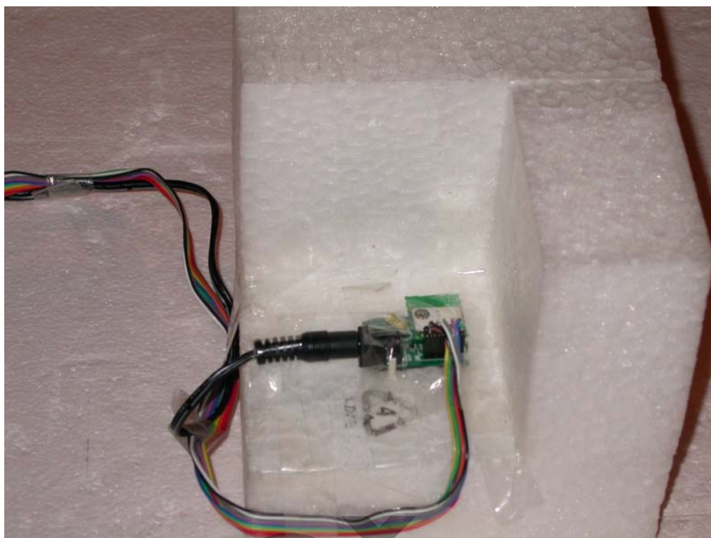
- X axis -