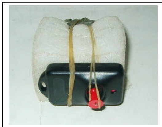
Radiated Open Site Test Set-up