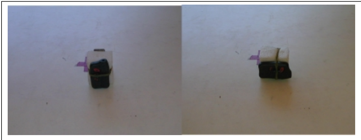
Radiated Open Site Test Set-up