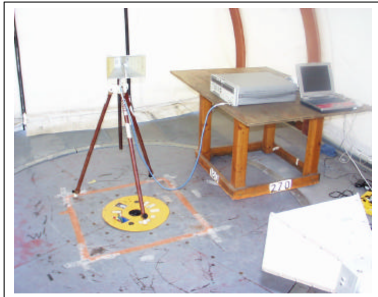
Substitution Method Above 1GHz Setup Photo