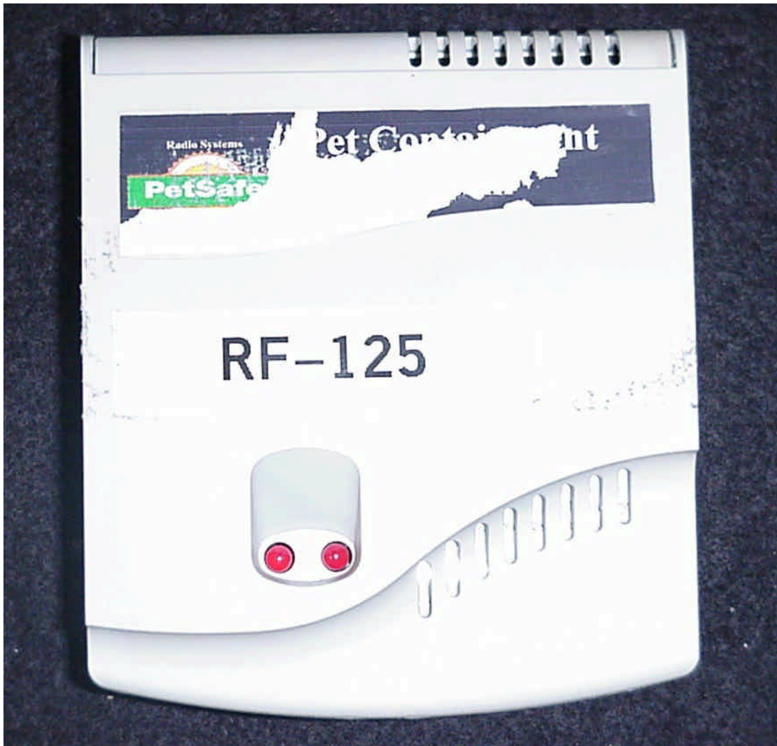
Photo 1. Front View of EUT