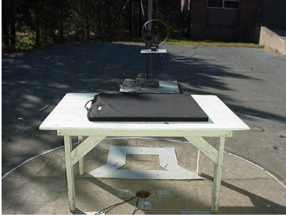
Photograph(s) for Spurious and Fundamental Emissions