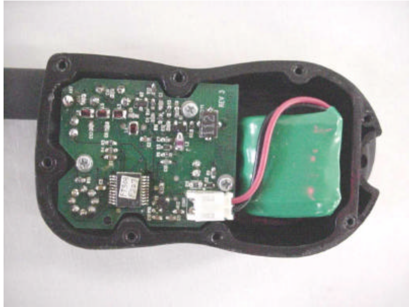
Photo 3. EUT Cover Removed.