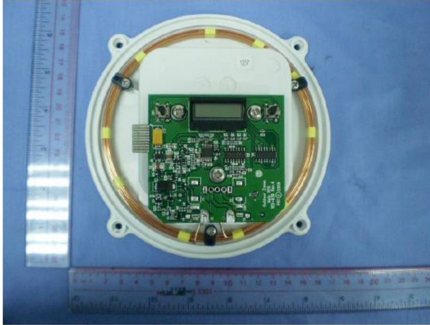
Inside-view with PCB