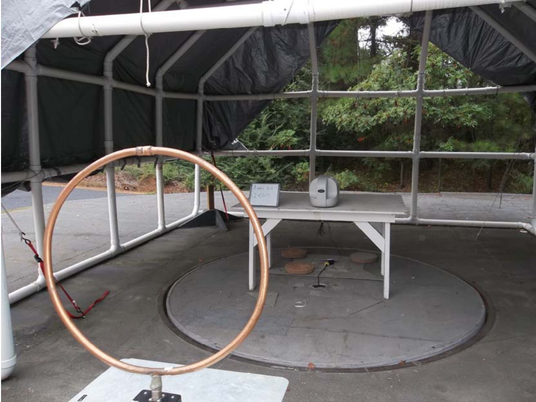
Radiated Emissions, Front – Loop Antenna