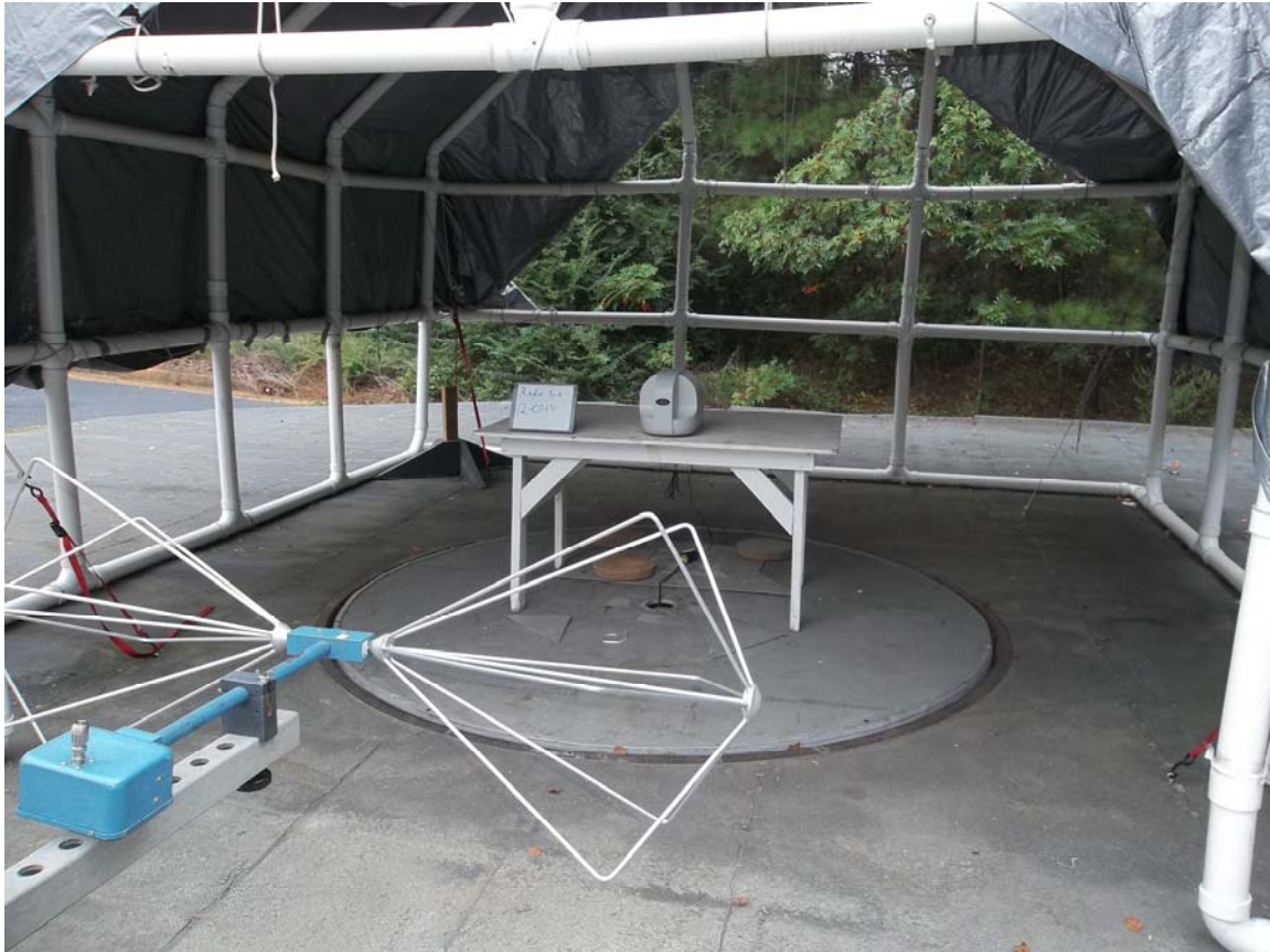
Radiated Emissions, Front, Biconical Antenna