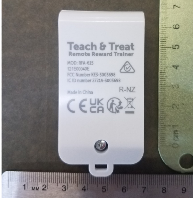
Figure 2. Sample Label Location

FCC Part 15 Certification/ RSS 210 KE3-3003698 2721A-3003698 22-0168 July 12, 2022 Radio Systems Corporation RFA-615