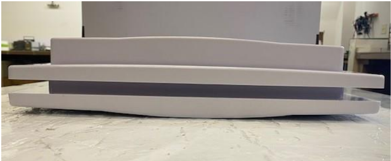
Figure 6. RAC00-17202 – Bottom