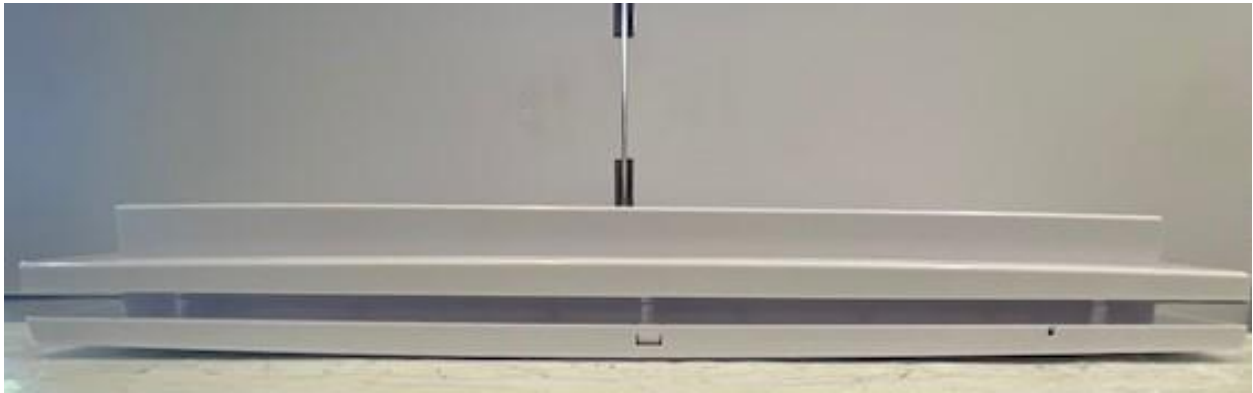
Figure 3. RAC00-17202 – Side 1

FCC Part 15, 95 and ISED RSS 210 KE3-3003679 2721A-3003679 20-0276 October 30, 2020 Radio Systems Corporation RAC00-17202