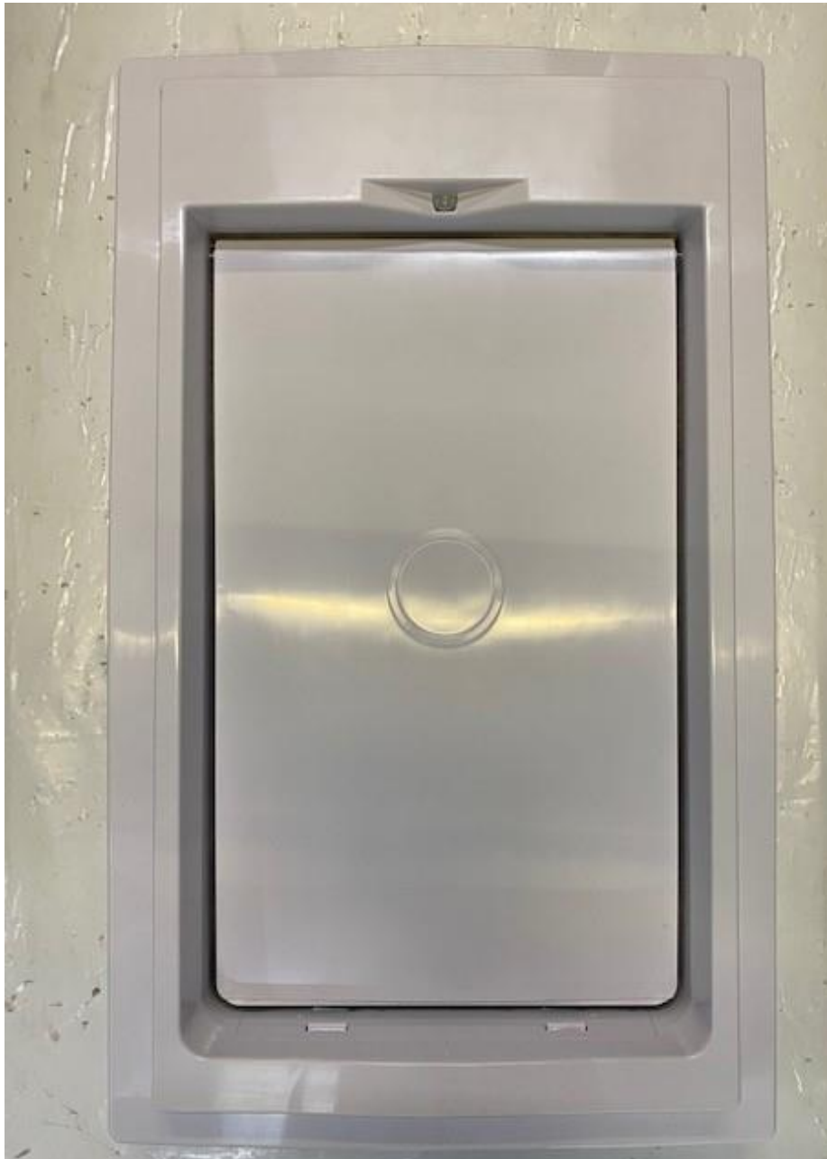
Figure 2. RAC00-17202 – Back

FCC Part 15, 95 and ISED RSS 210 KE3-3003679 2721A-3003679 20-0276 October 30, 2020 Radio Systems Corporation RAC00-17202