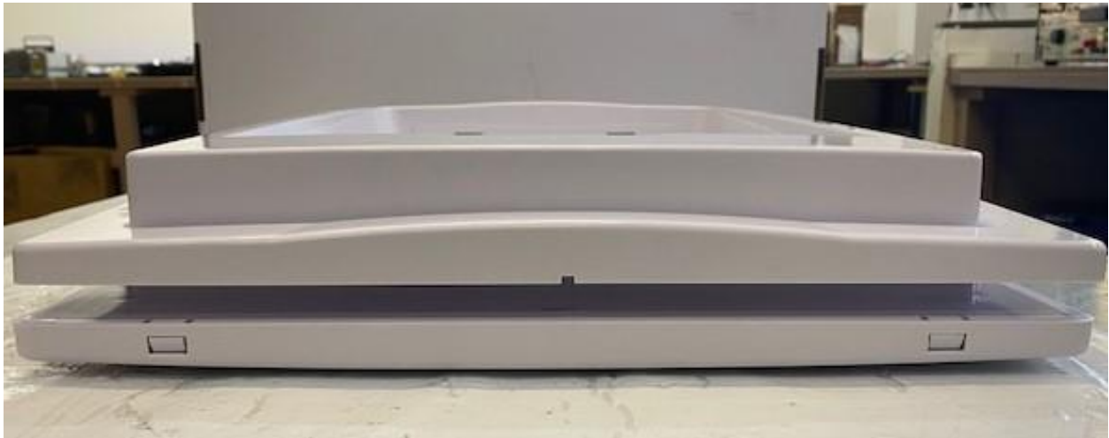
Figure 5. RAC00-17202 – Top

FCC Part 15, 95 and ISED RSS 210 KE3-3003679 2721A-3003679 20-0276 October 30, 2020 Radio Systems Corporation RAC00-17202