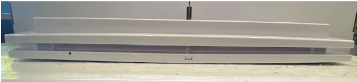
Figure 4. RAC00-17202 – Side 2