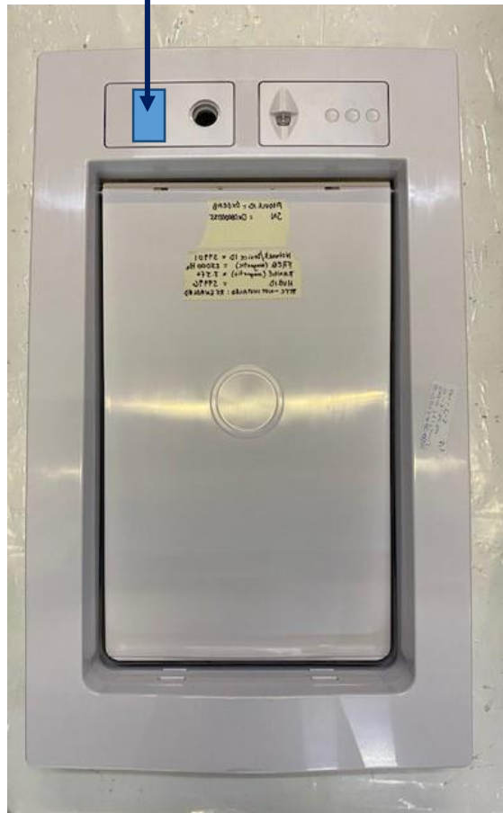
Figure 2. Label Visible after Installation in Doorframe

FCC ID: KE3-3003679 IC: 2721A-3003679 Model/ Modele: RAC00-1702 Input 5V ---- 0.5A Made in Vietnam/ Fabrique au Vietnam Radio Systems Corporation (IFB Serial Number) (Module Serial Number)