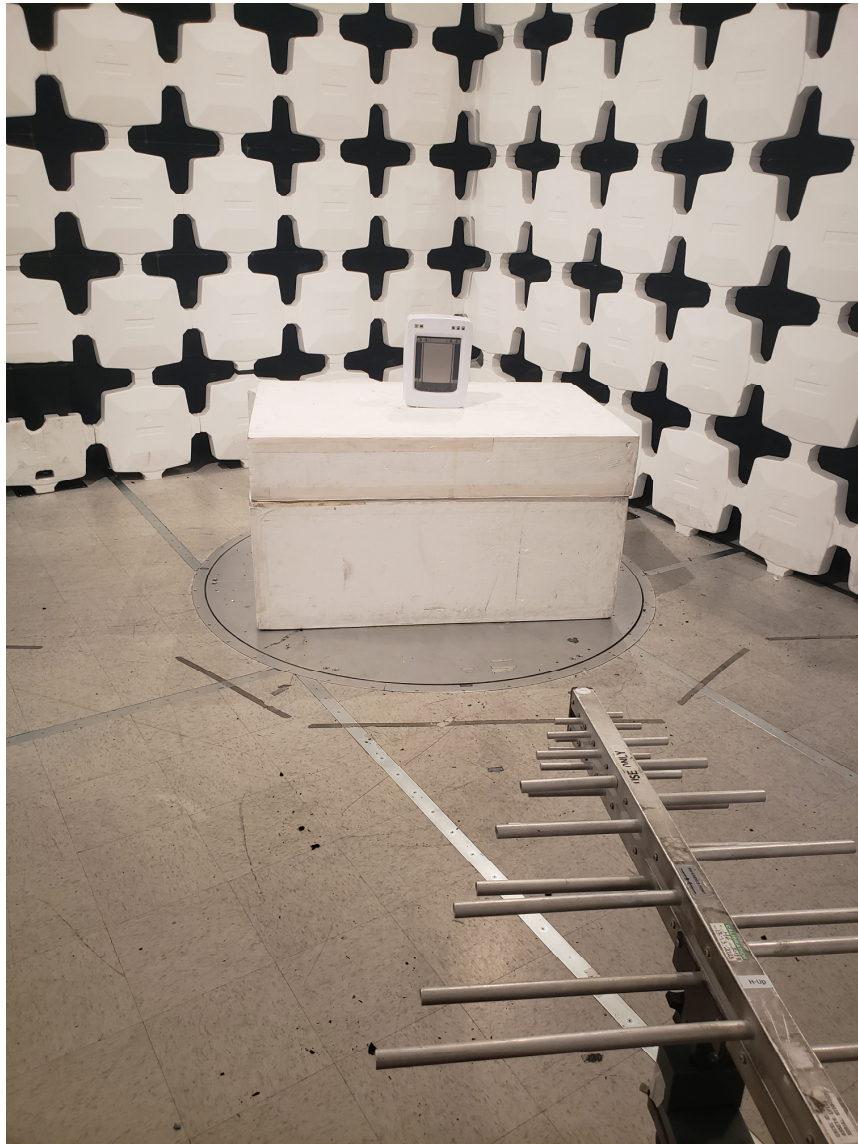
Figure 4. Radiated Emissions Test Setup, 200 MHz to 1 GHz

FCC Part 15 Certification/ RSS 210 KE3-3003672 2721A-3003672 22-0139 May 20, 2022 Radio Systems Corporation 300-3672