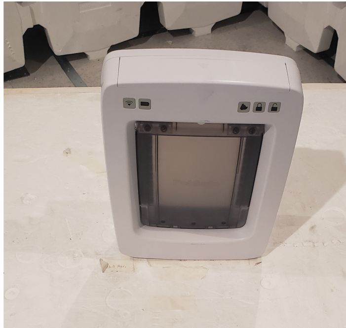
Figure 1. Radiated Emissions Test Setup