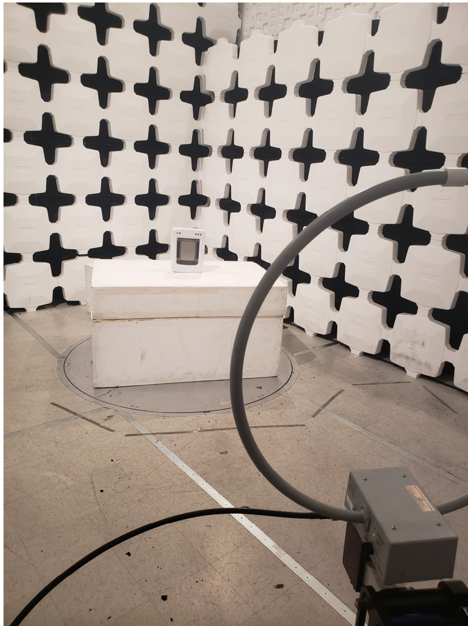
Figure 2. Radiated Emissions Test Setup, 9 kHz to 30 MHz

FCC Part 15 Certification/ RSS 210 KE3-3003672 2721A-3003672 22-0139 May 20, 2022 Radio Systems Corporation 300-3672