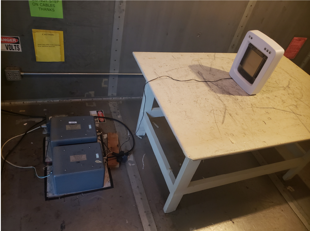
Figure 6. Powerline Conducted Emission Test Setup

FCC Part 15 Certification/ RSS 210 KE3-3003672 2721A-3003672 22-0139 May 20, 2022 Radio Systems Corporation 300-3672