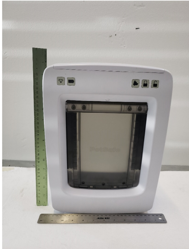
Figure 1. Front View