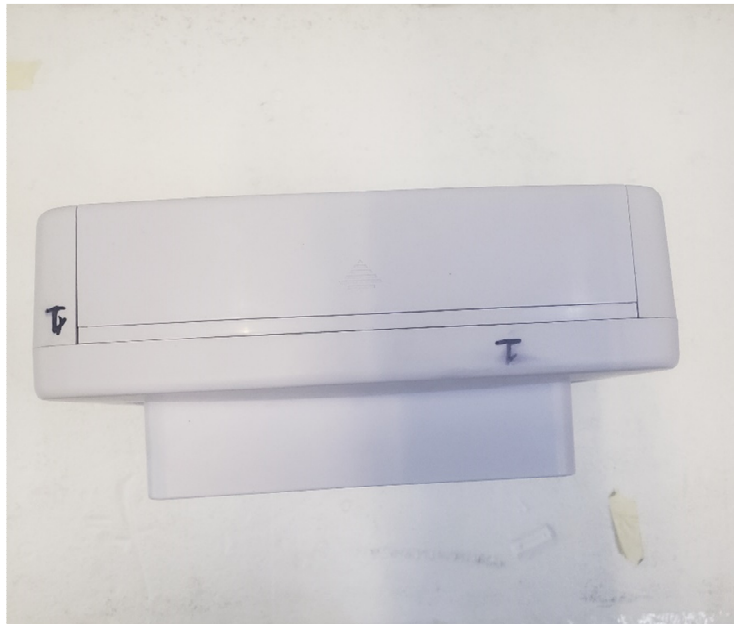
Figure 3. Top View

FCC Part 15 Certification/ RSS 210 KE3-3003672 2721A-3003672 22-0139 May 20, 2022 Radio Systems Corporation 300-3672