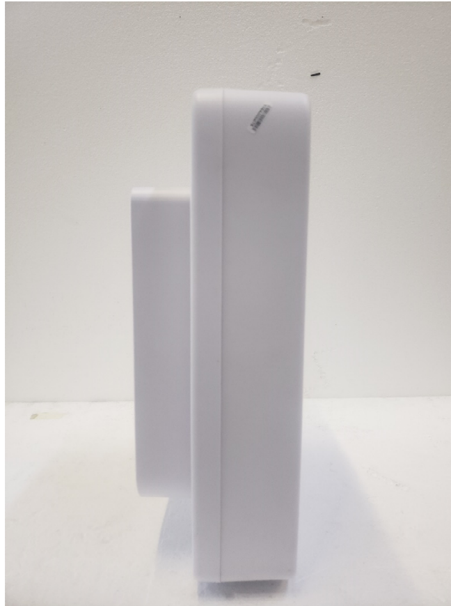
Figure 6. Side View 2

FCC Part 15 Certification/ RSS 210 KE3-3003672 2721A-3003672 22-0139 May 20, 2022 Radio Systems Corporation 300-3672