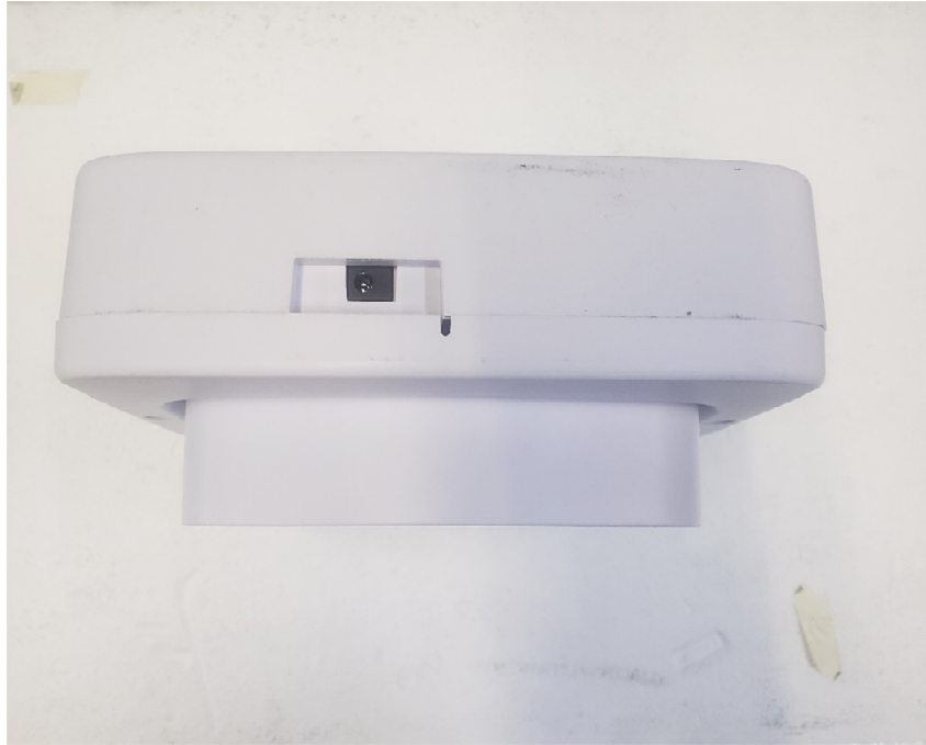
Figure 4. Bottom View 2

FCC Part 15 Certification/ RSS 210 KE3-3003672 2721A-3003672 22-0139 May 20, 2022 Radio Systems Corporation 300-3672