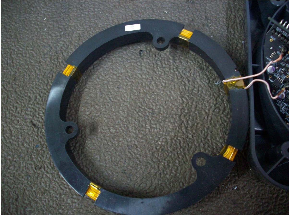
Figure 8. All Models, Top of Coil Attached to the PCB

FCC Part 15, 95, ISED RSS 210 KE3-3003600 20-0075 April 13, 2020 Radio Systems RAC00-16950, RAC00-16953, RAC00-16993