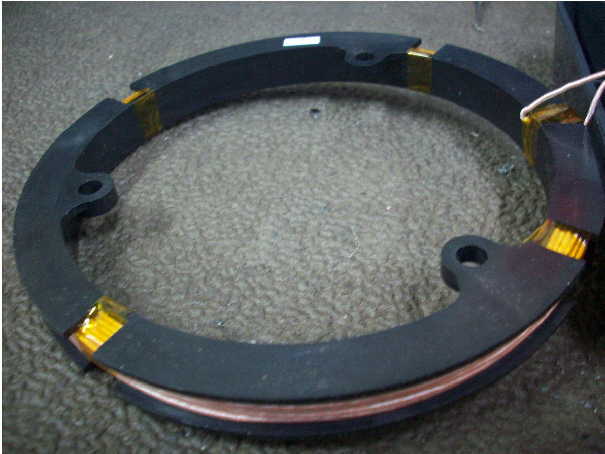
Figure 9. All Models, Side of Coil Attached to the PCB

FCC Part 15, 95, ISED RSS 210 KE3-3003600 20-0075 April 13, 2020 Radio Systems RAC00-16950, RAC00-16953, RAC00-16993