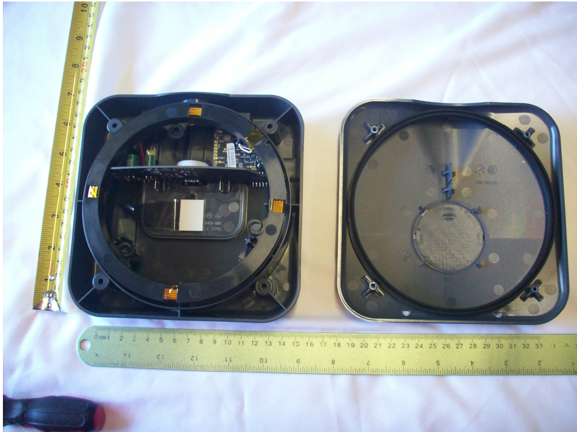
Figure 1. RAC00-16950 and RAC00-16993 with Cover Removed