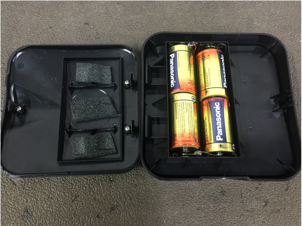
Figure 2. Model RAC00-16953 with Cover Removed

FCC Part 15, 95, ISED RSS 210 KE3-3003600 20-0075 April 13, 2020 Radio Systems RAC00-16950, RAC00-16953, RAC00-16993