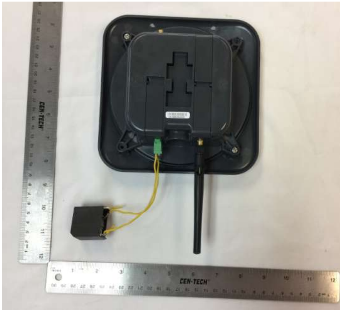
Figure 3. EUT, Bottom

FCC Part 15 Certification/ RSS 210 KE3-3003591 19-0405 November 22, 2019 Radio Systems RIG00-16936