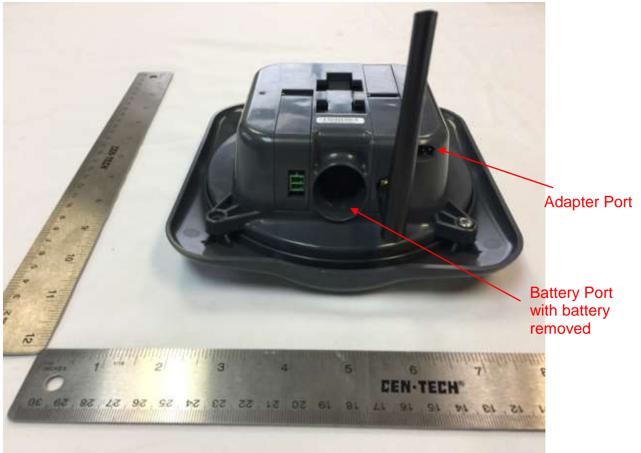
Figure 4. EUT, Side 1