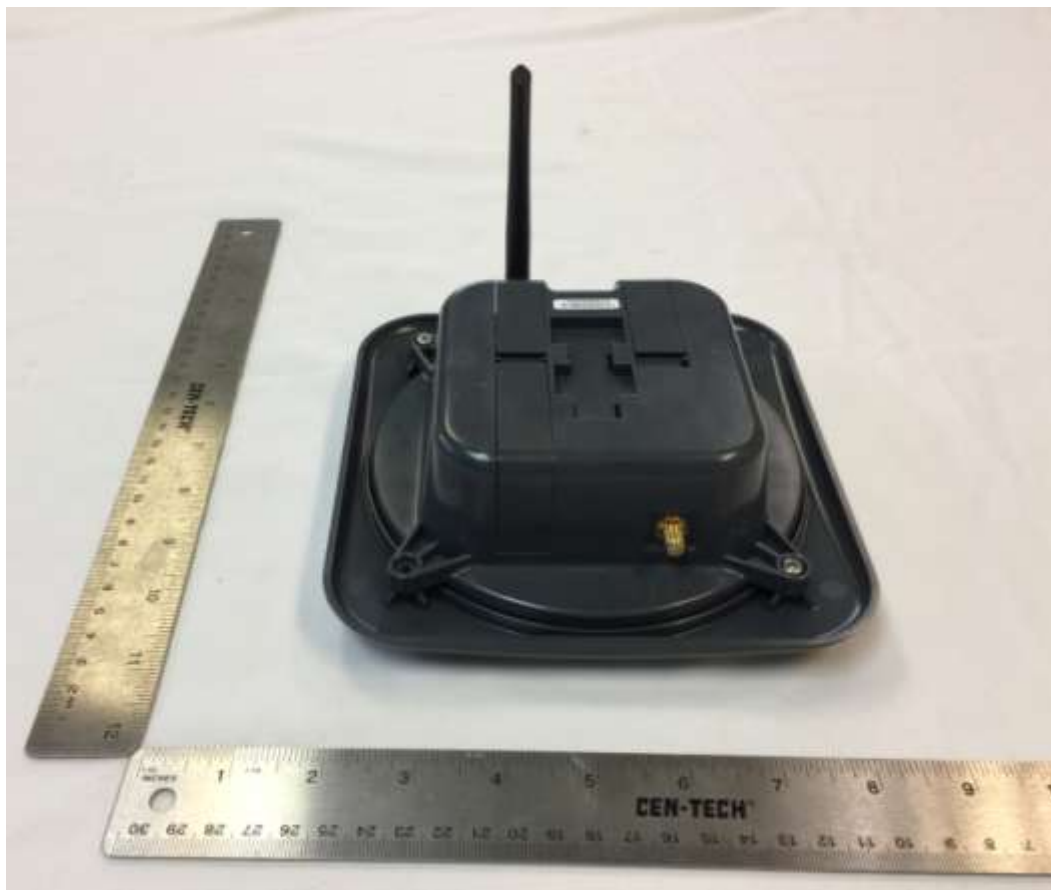
Figure 6. EUT Side 3

FCC Part 15 Certification/ RSS 210 KE3-3003591 19-0405 November 22, 2019 Radio Systems RIG00-16936