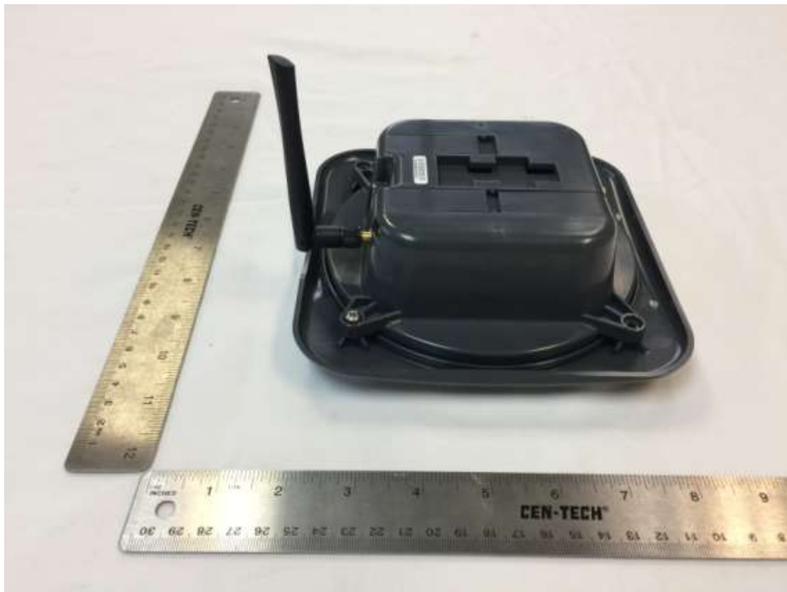
Figure 7. EUT Side 4

FCC Part 15 Certification/ RSS 210 KE3-3003591 19-0405 November 22, 2019 Radio Systems RIG00-16936