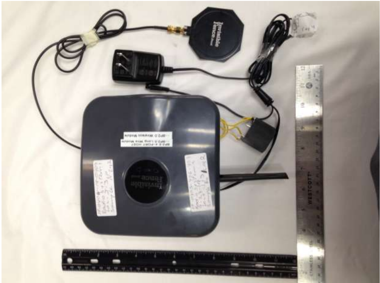
Figure 1. Overall System