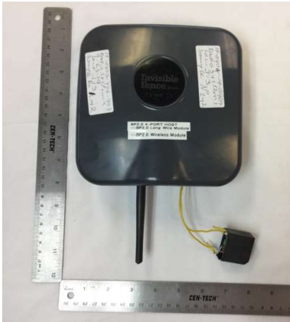
Figure 2. EUT, Top

FCC Part 15 Certification/ RSS 210 KE3-3003591 19-0405 November 22, 2019 Radio Systems RIG00-16936