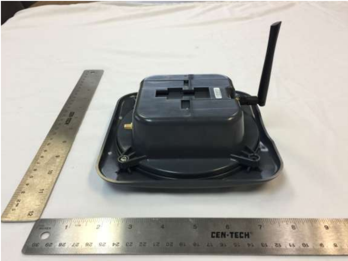
Figure 5. EUT Side 2

FCC Part 15 Certification/ RSS 210 KE3-3003591 19-0405 November 22, 2019 Radio Systems RIG00-16936