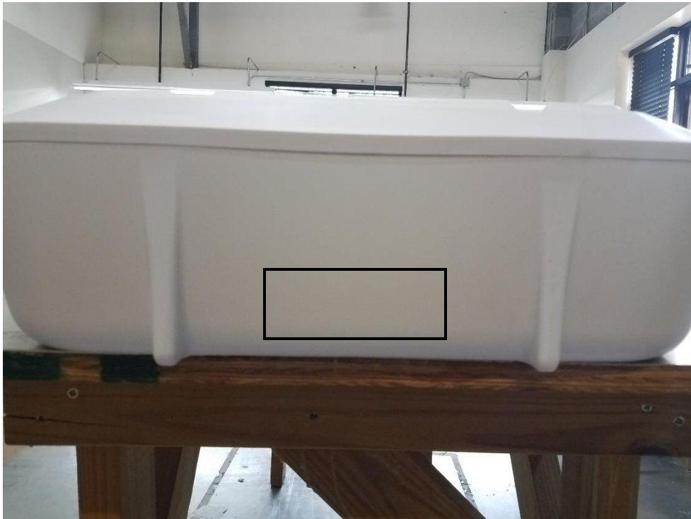
Figure 2. Sample Label Location