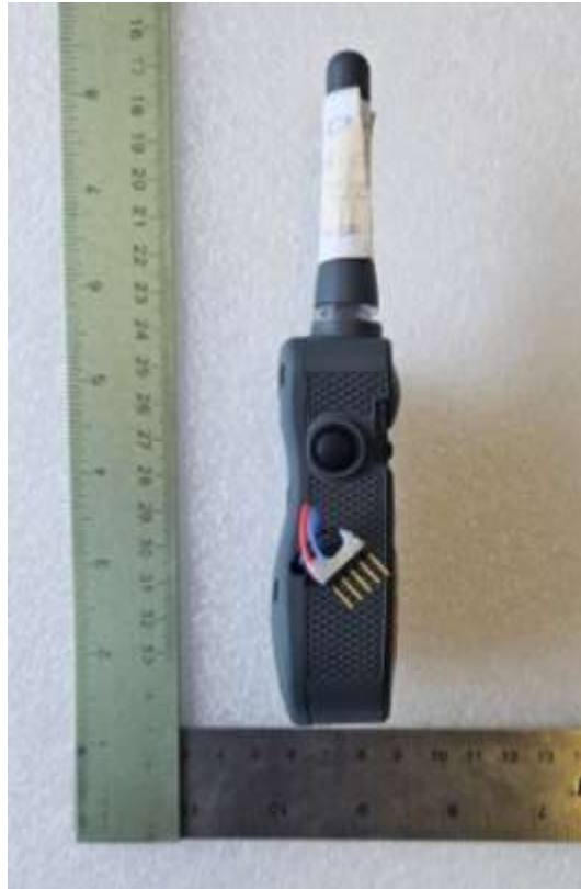
Figure 3. Left Side of EUT, one-mile (300-3445)

FCC Part 15 Certification/ RSS 210 KE3-30034451 2721A-30034451 23-0105, and 23-0107 July 11, 2023 Radio Systems Corporation 300-3445, and 300-34451-1