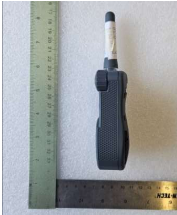
Figure 4. Right Side of EUT, one-mile (300-3445)

FCC Part 15 Certification/ RSS 210 KE3-30034451 2721A-30034451 23-0105, and 23-0107 July 11, 2023 Radio Systems Corporation 300-3445, and 300-34451-1