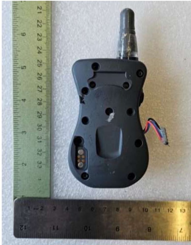
Figure 9. Back of EUT, Half-Mile (300-3445-1)

FCC Part 15 Certification/ RSS 210 KE3-30034451 2721A-30034451 23-0105, and 23-0107 July 11, 2023 Radio Systems Corporation 300-3445, and 300-34451-1