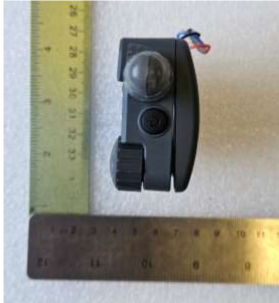
Figure 8. Top of EUT, Half-Mile (300-3445-1)

FCC Part 15 Certification/ RSS 210 KE3-30034451 2721A-30034451 23-0105, and 23-0107 July 11, 2023 Radio Systems Corporation 300-3445, and 300-34451-1