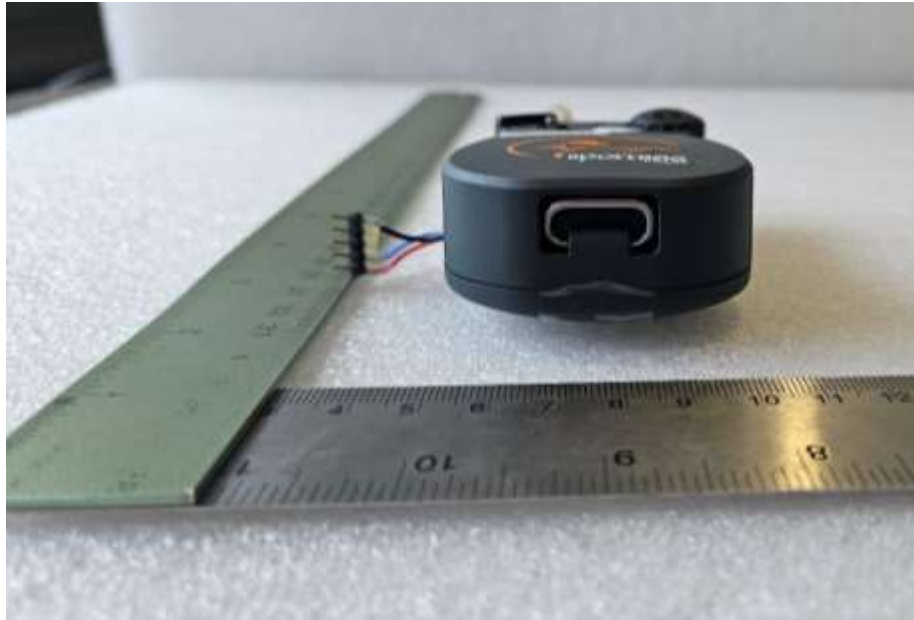
Figure 6. Bottom of EUT, one-mile (300-3445)

FCC Part 15 Certification/ RSS 210 KE3-30034451 2721A-30034451 23-0105, and 23-0107 July 11, 2023 Radio Systems Corporation 300-3445, and 300-34451-1