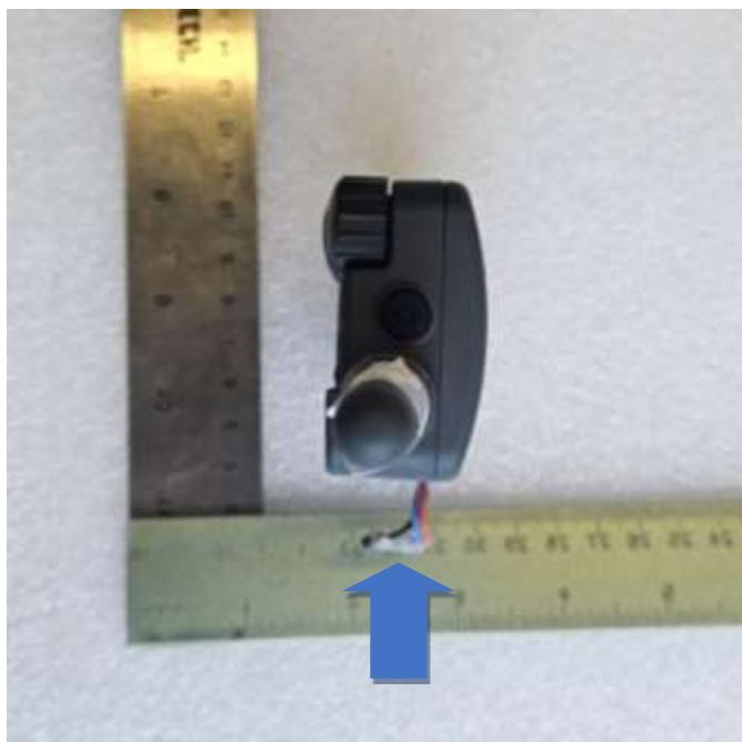
Figure 1. Top of EUT, one-mile (300-3445)

Note: Cable indicated above are for programming purposes only