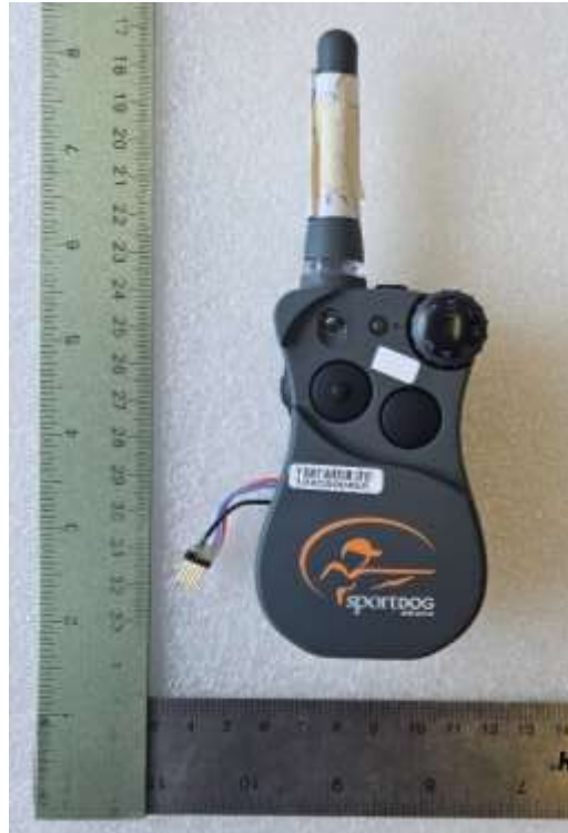
Figure 5. Front of EUT, one-mile (300-3445)

FCC Part 15 Certification/ RSS 210 KE3-30034451 2721A-30034451 23-0105, and 23-0107 July 11, 2023 Radio Systems Corporation 300-3445, and 300-34451-1