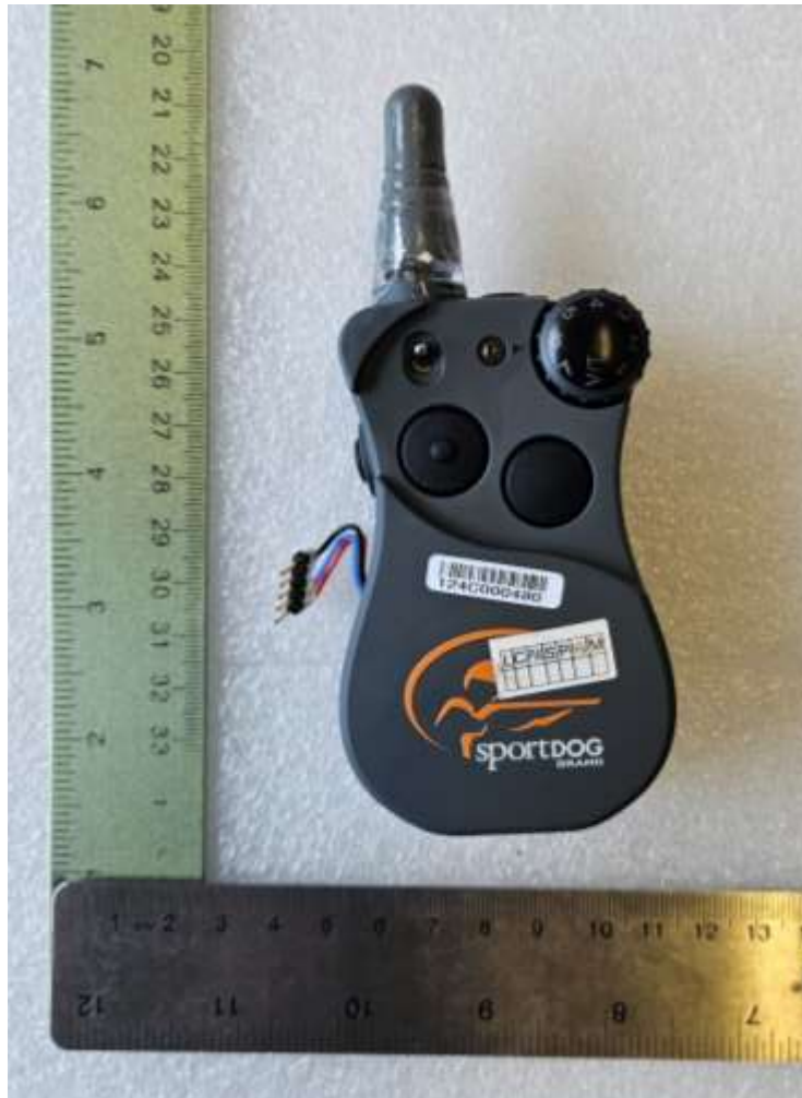
Figure 12. Front of EUT, Half-Mile (300-3445-1)

FCC Part 15 Certification/ RSS 210 KE3-30034451 2721A-30034451 23-0105, and 23-0107 July 11, 2023 Radio Systems Corporation 300-3445, and 300-34451-1