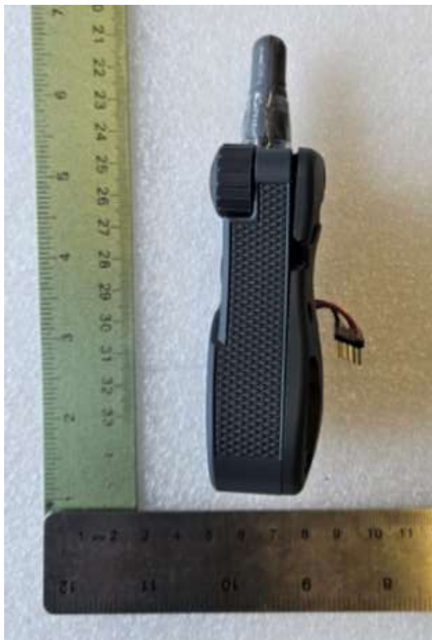
Figure 11. Right Side of EUT, Half-Mile (300-3445-1)

FCC Part 15 Certification/ RSS 210 KE3-30034451 2721A-30034451 23-0105, and 23-0107 July 11, 2023 Radio Systems Corporation 300-3445, and 300-34451-1