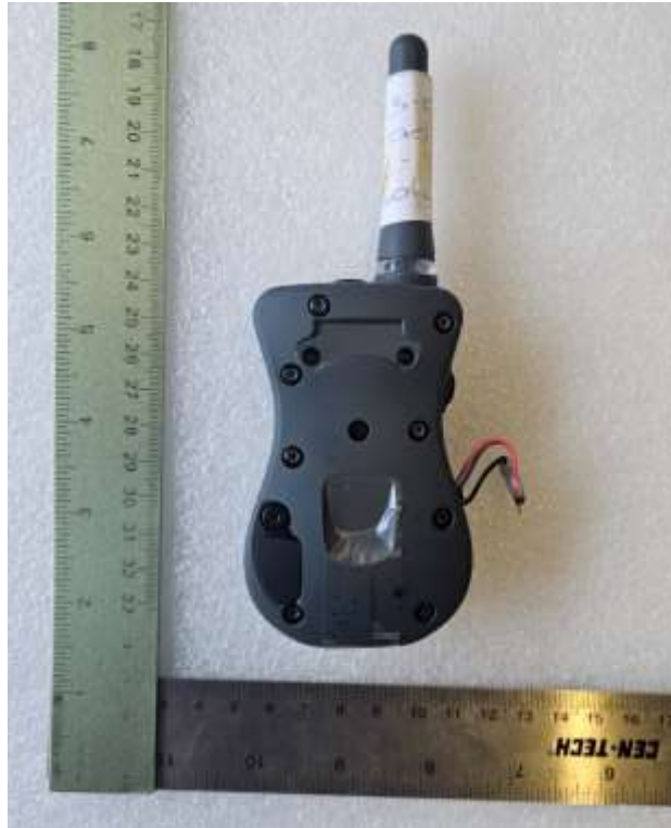
Figure 2. Back of EUT, one-mile (300-3445)

FCC Part 15 Certification/ RSS 210 KE3-30034451 2721A-30034451 23-0105, and 23-0107 July 11, 2023 Radio Systems Corporation 300-3445, and 300-34451-1