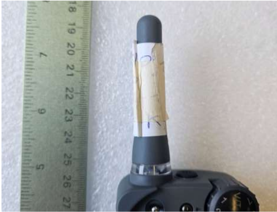
Figure 7. Antenna, one-mile (300-3445)

FCC Part 15 Certification/ RSS 210 KE3-30034451 2721A-30034451 23-0105, and 23-0107 July 11, 2023 Radio Systems Corporation 300-3445, and 300-34451-1