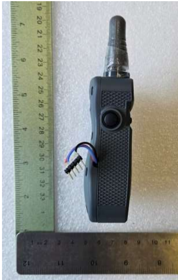
Figure 10. Left Side of EUT, Half-Mile (300-3445-1)

FCC Part 15 Certification/ RSS 210 KE3-30034451 2721A-30034451 23-0105, and 23-0107 July 11, 2023 Radio Systems Corporation 300-3445, and 300-34451-1