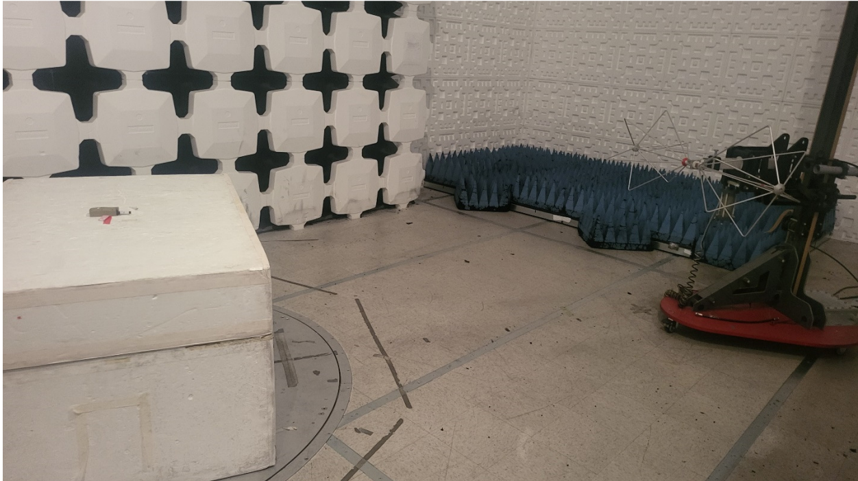
Figure 3. Radiated Emissions Test Setup, 30 MHz to 200 MHz

FCC Part 15 Certification/ RSS 210 KE3-3003441 2721A-3003441 22-0263 October 14, 2022 Radio Systems Corporation SDT17-17697