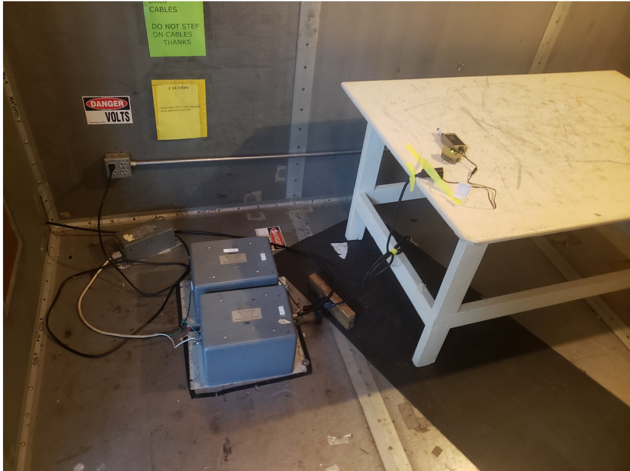
Figure 6. Power Line Conducted emissions

FCC Part 15 Certification/ RSS 210 KE3-3003441 2721A-3003441 22-0263 October 14, 2022 Radio Systems Corporation SDT17-17697