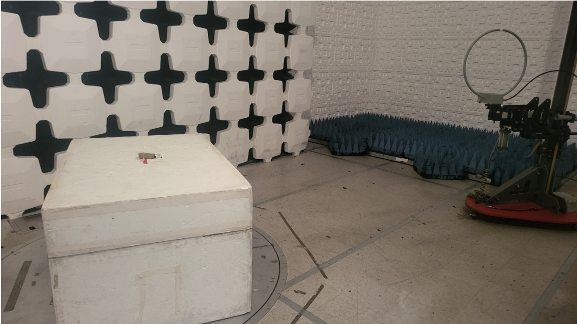
Figure 2. Radiated Emissions Test Setup, 9 kHz to 30 MHz

FCC Part 15 Certification/ RSS 210 KE3-3003441 2721A-3003441 22-0263 October 14, 2022 Radio Systems Corporation SDT17-17697