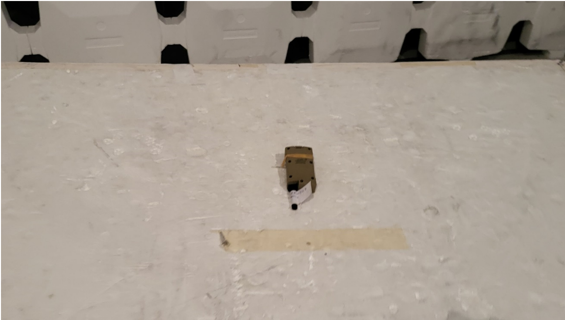
Figure 1. Radiated Emissions Test Setup

Note: The EUT was tested in all three orthogonal positions. The position in the photograph above is the worst case position.