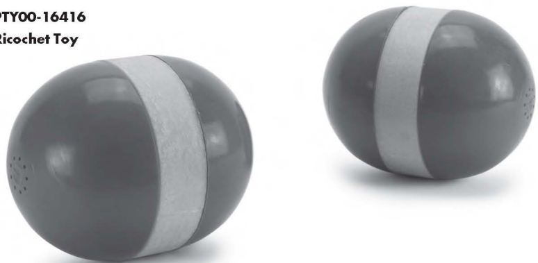
PTY00-16416 Ricochet Toy

Please read this entire guide before beginning