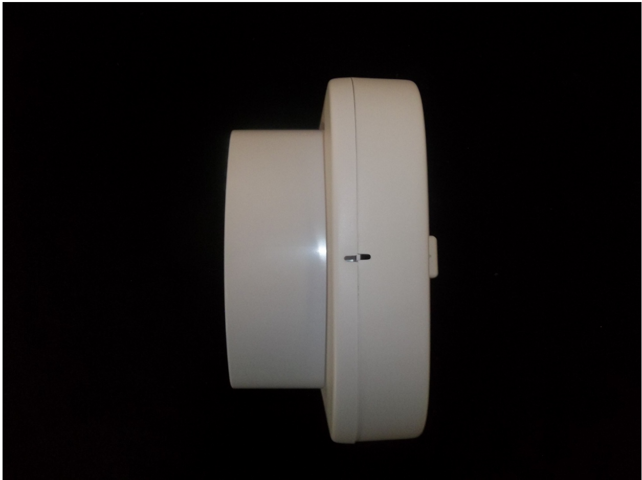
Figure 7. Bottom of EUT

FCC Part 15.209 and IC RSS-210 Certification KE3-3003274 2721A-3003274 18-0038 May 25, 2018 Radio Systems Corp 300-3274