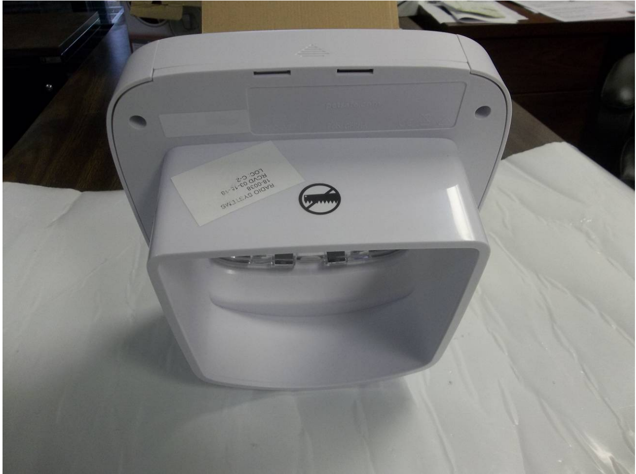
Figure 2. Back of EUT

FCC Part 15.209 and IC RSS-210 Certification KE3-3003274 2721A-3003274 18-0038 May 25, 2018 Radio Systems Corp 300-3274