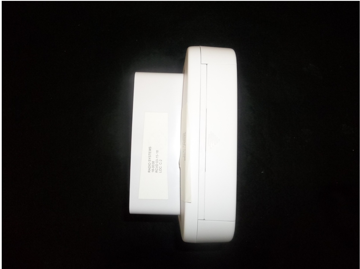
Figure 6. Top of EUT, View 2

FCC Part 15.209 and IC RSS-210 Certification KE3-3003274 2721A-3003274 18-0038 May 25, 2018 Radio Systems Corp 300-3274