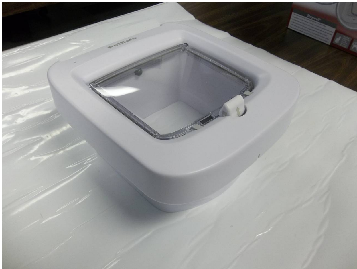
Figure 1. Front of EUT