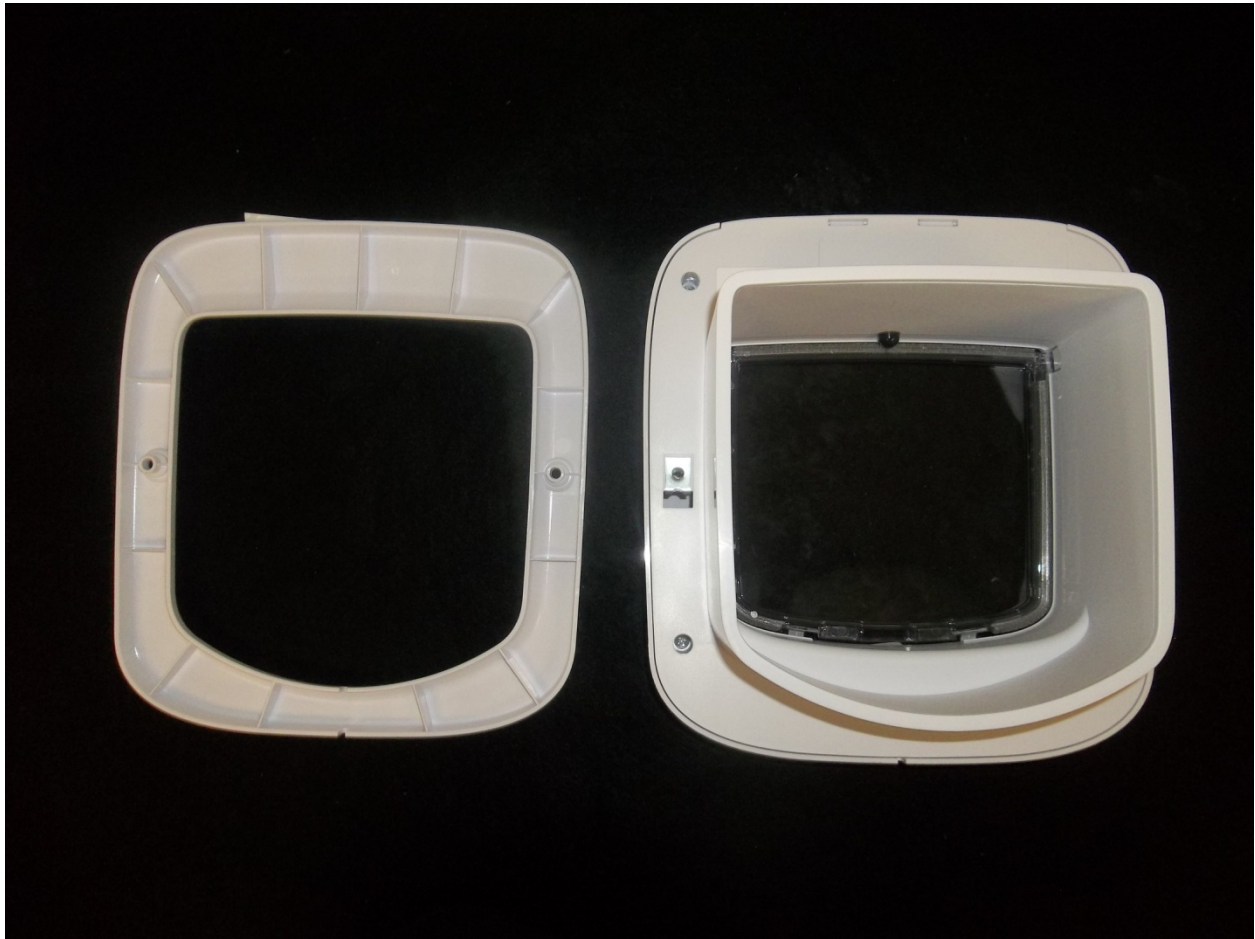
Figure 4. Back of EUT with Back of Mounting Frame

FCC Part 15.209 and IC RSS-210 Certification KE3-3003274 2721A-3003274 18-0038 May 25, 2018 Radio Systems Corp 300-3274