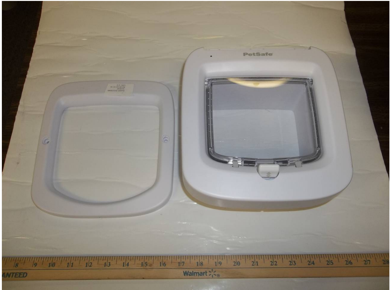
Figure 3. Front of EUT, with Front of Mounting Frame

FCC Part 15.209 and IC RSS-210 Certification KE3-3003274 2721A-3003274 18-0038 May 25, 2018 Radio Systems Corp 300-3274