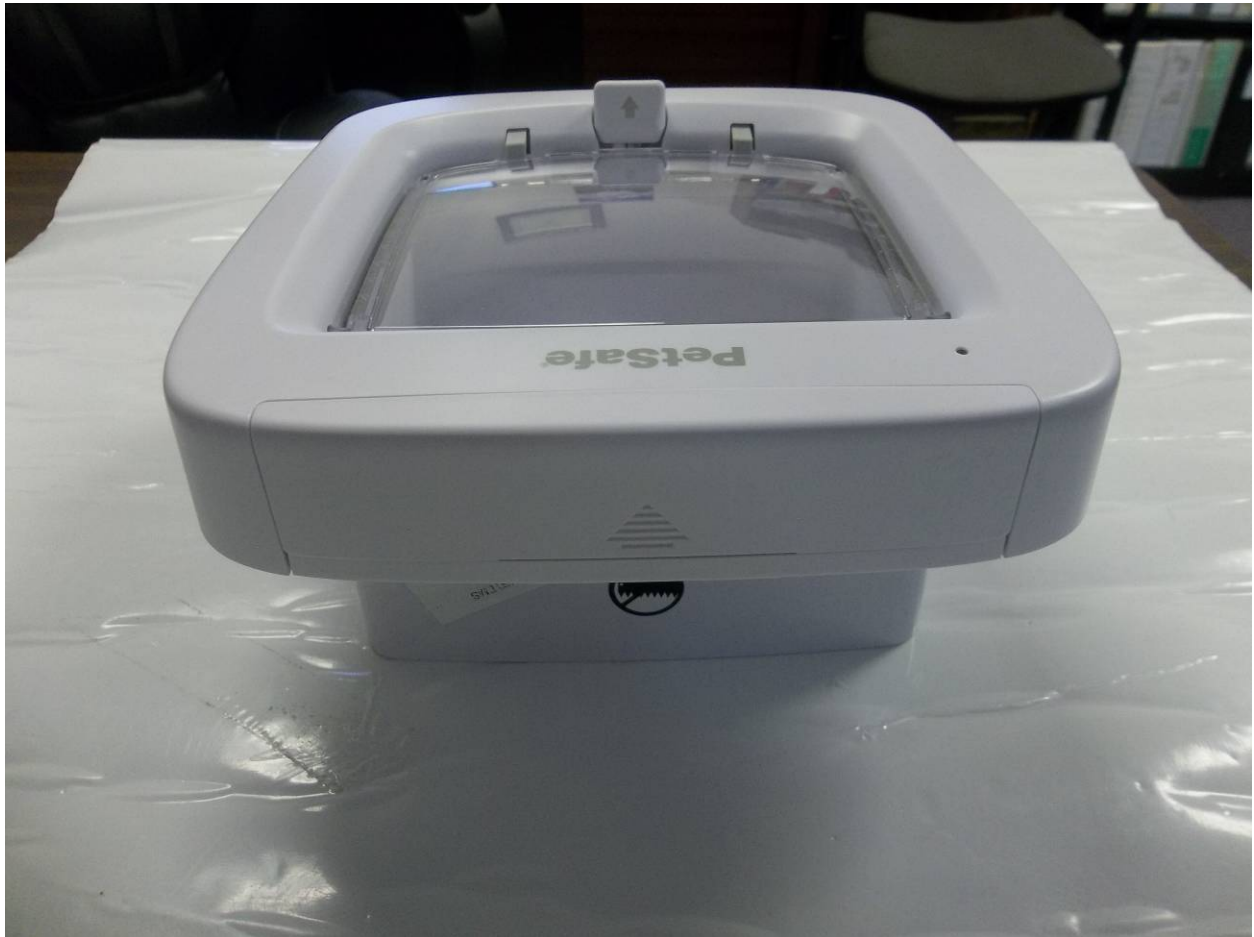
Figure 5. Top of EUT, View 1

FCC Part 15.209 and IC RSS-210 Certification KE3-3003274 2721A-3003274 18-0038 May 25, 2018 Radio Systems Corp 300-3274