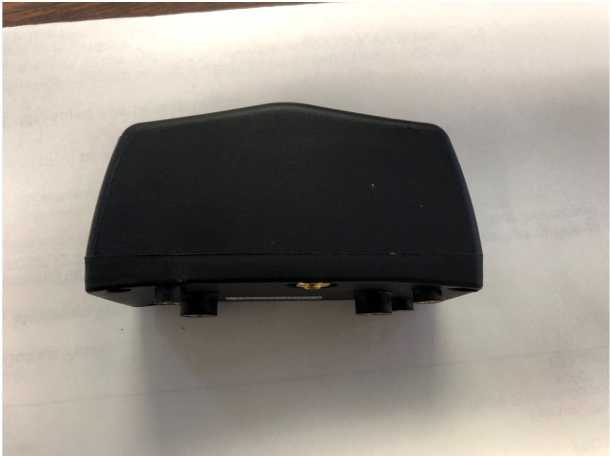
Figure 2. Bottom of EUT

Part 95J KE3-3003170 18-0013 March 9, 2018 Radio Systems Corp RIF00-15976