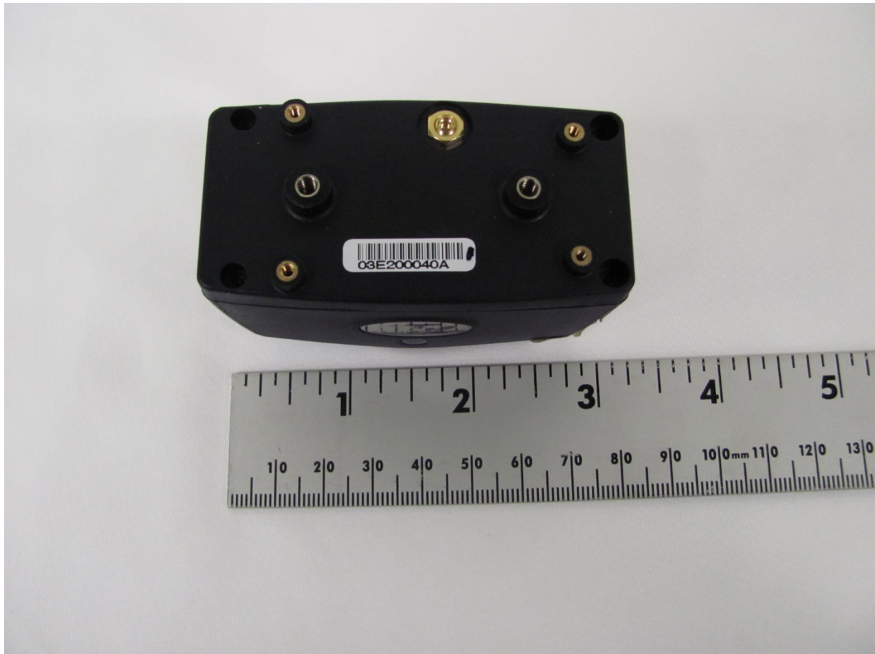
Figure 7.Back, Electrode Side

Part 95J KE3-3003170 18-0013 March 9, 2018 Radio Systems Corp RIF00-15976