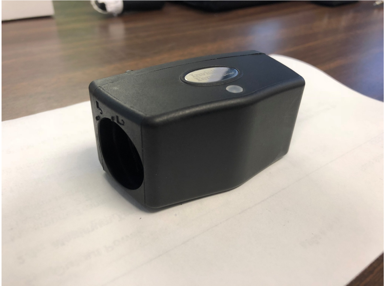
Figure 4. Side 2, Battery Side, and Front

Part 95J KE3-3003170 18-0013 March 9, 2018 Radio Systems Corp RIF00-15976