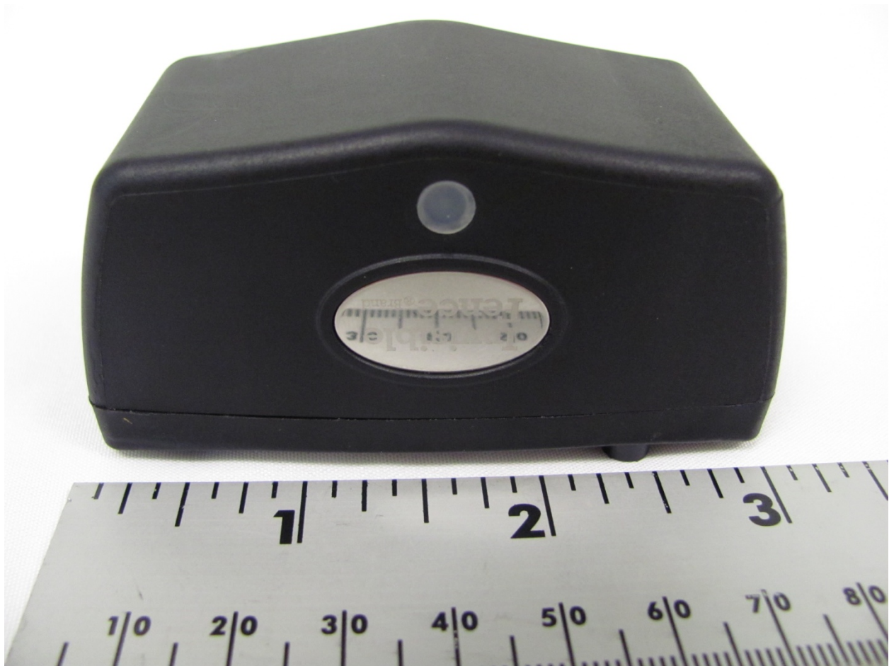
Figure 1. Top of EUT