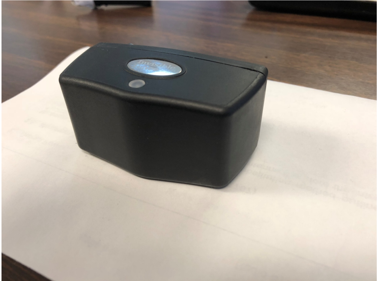
Figure 3. Side 1 and Front

Part 95J KE3-3003170 18-0013 March 9, 2018 Radio Systems Corp RIF00-15976