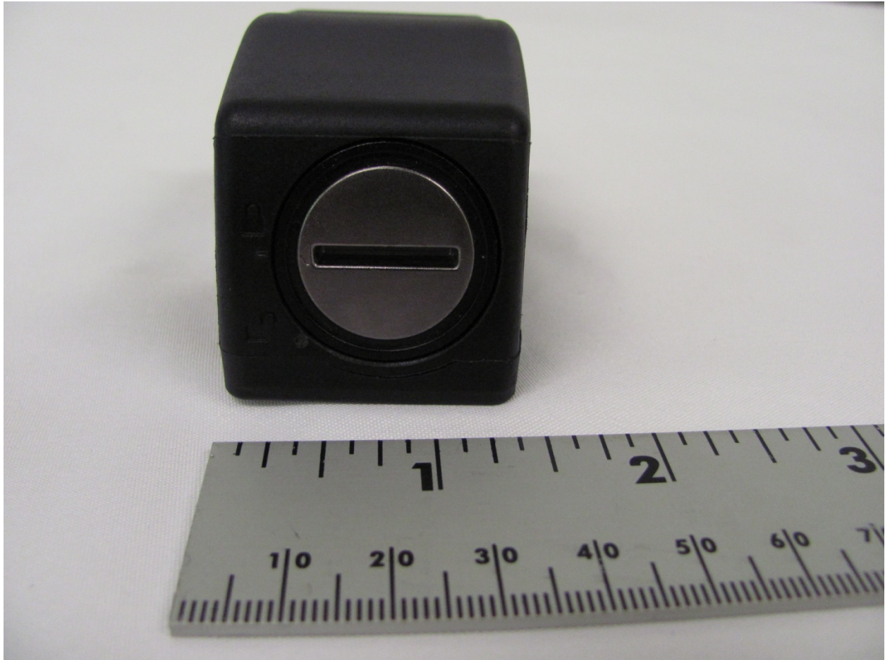
Figure 6. Battery side with Battery Pack Installed

Part 95J KE3-3003170 18-0013 March 9, 2018 Radio Systems Corp RIF00-15976