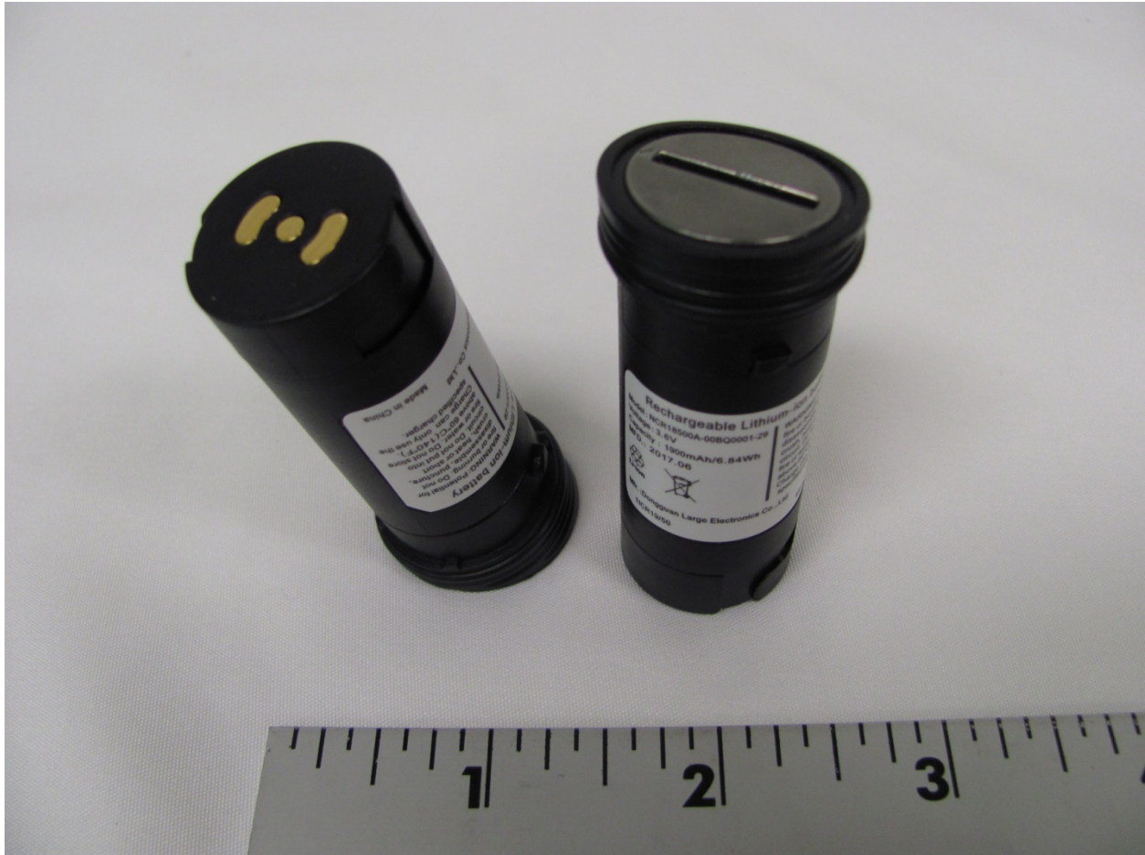
Figure 8. Battery Packs

Part 95J KE3-3003170 18-0013 March 9, 2018 Radio Systems Corp RIF00-15976