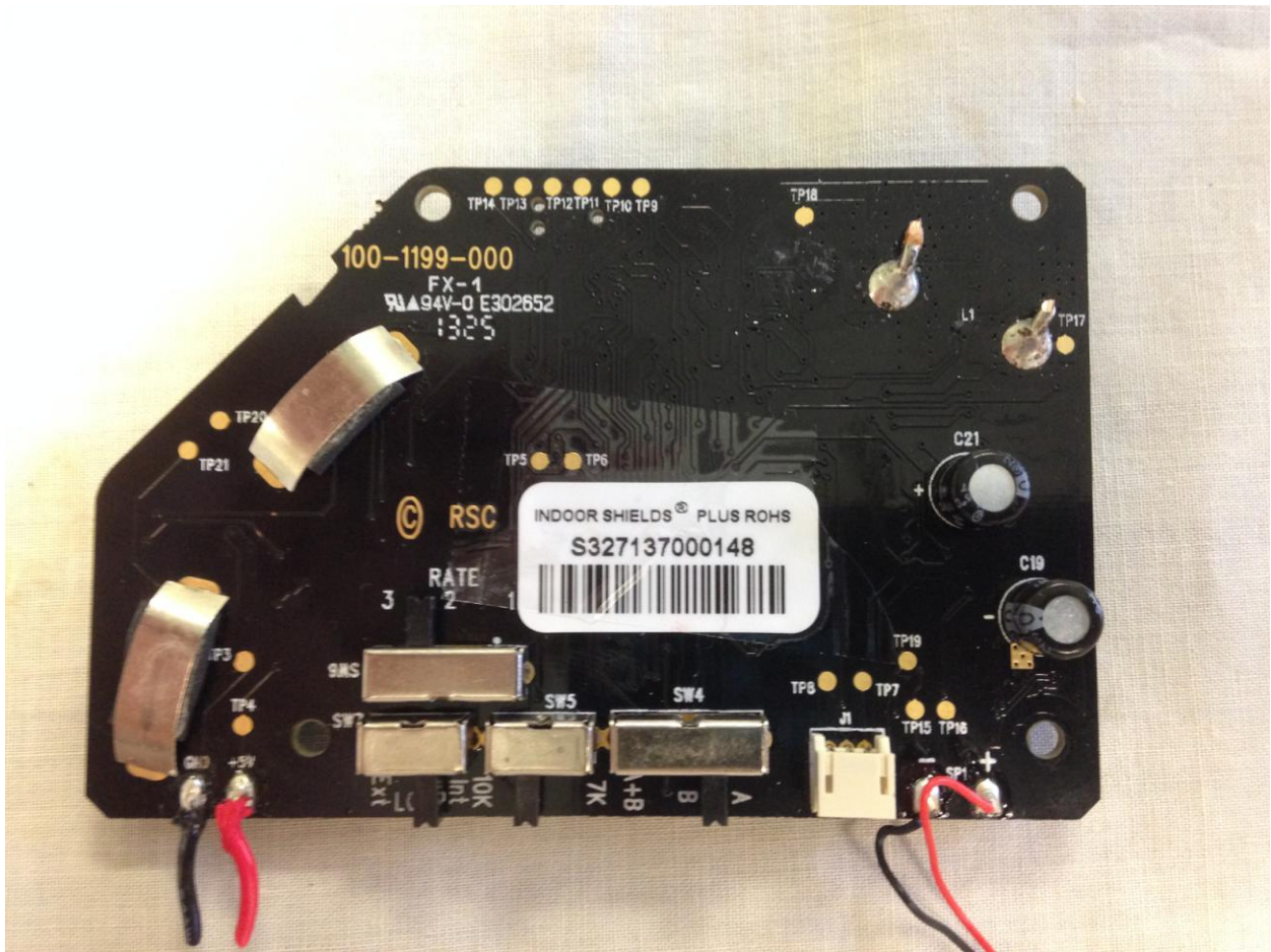
Figure 3. PCB Solder Side

FCC Part 15 Certification/ RSS 210 KE3-3003079 2721A-3003079 15-0125 June 3, 2015 Radio Systems RAC00-15373