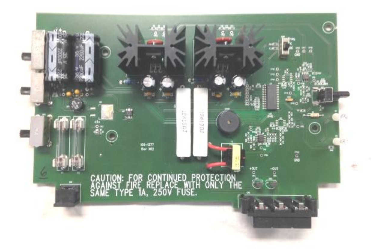
Figure 2. PCB Component Side

FCC Part 15 Certification/ RSS 210 KE3-3003061 2721A-3003061 15-0033 February 19, 2015 Radio Systems SDT00-12721