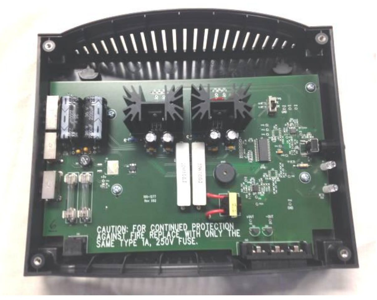
Figure 1. EUT with Cover Removed