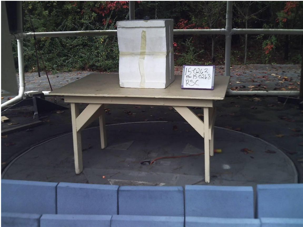
Figure 5. Radiated Emissions Test Setup (Above 1 GHz, Front View)

FCC Part 15 Certification/ RSS 210 KE3-3003057 2721A-3003057 15-0262 November 19, 2015 Radio Systems RIG00-15265