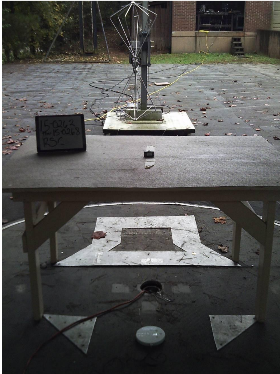
Figure 3. Radiated Emissions Test Setup (30 - 200 MHz)

FCC Part 15 Certification/ RSS 210 KE3-3003057 2721A-3003057 15-0262 November 19, 2015 Radio Systems RIG00-15265