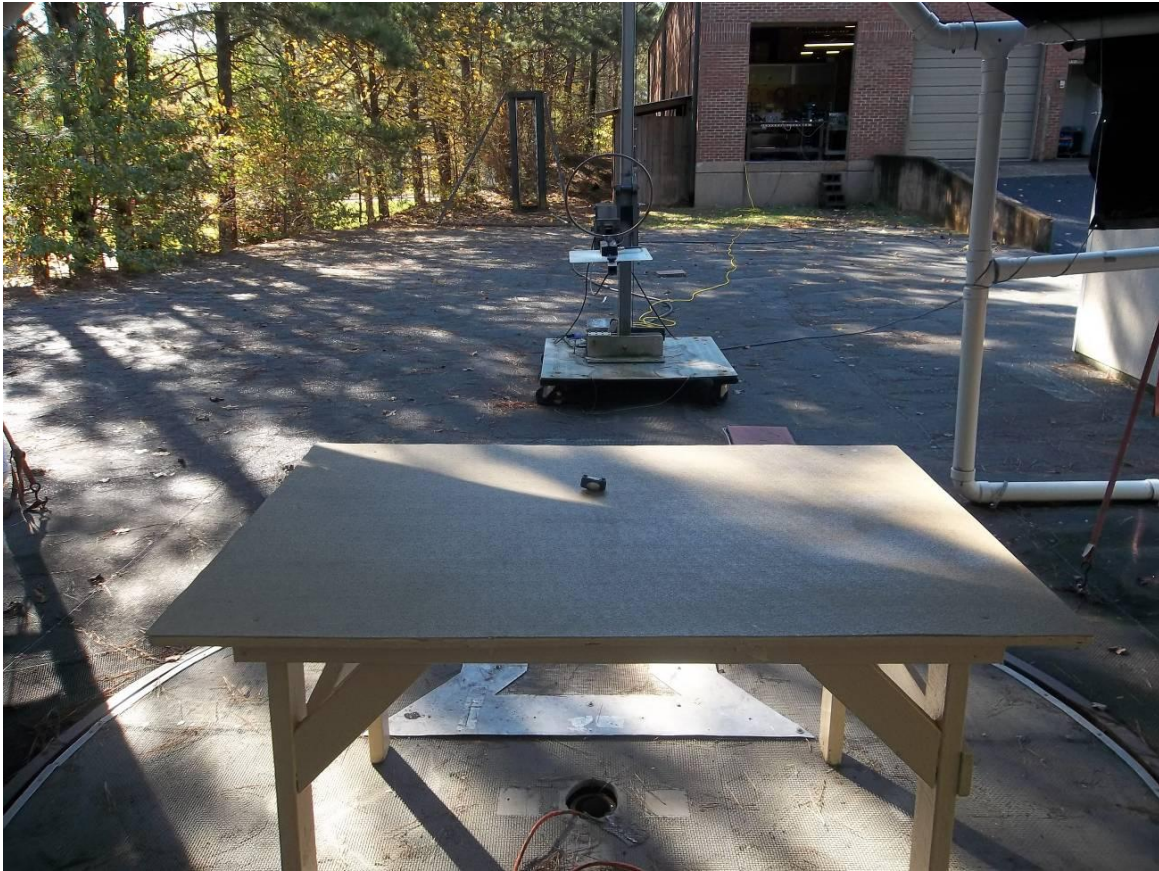
Figure 2. Radiated Emissions Test Setup (Below 30 MHz)

FCC Part 15 Certification/ RSS 210 KE3-3003057 2721A-3003057 15-0262 November 19, 2015 Radio Systems RIG00-15265