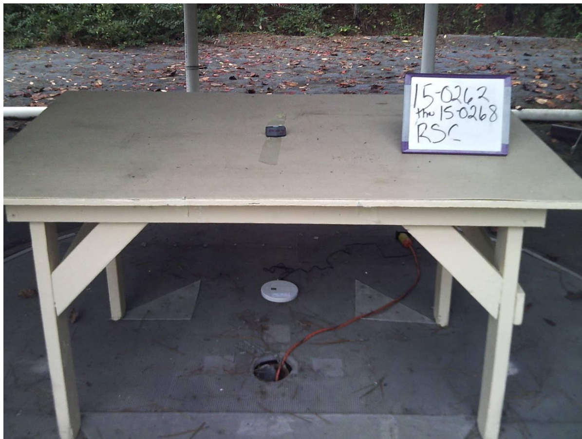
Figure 1. Radiated Emissions Test Setup