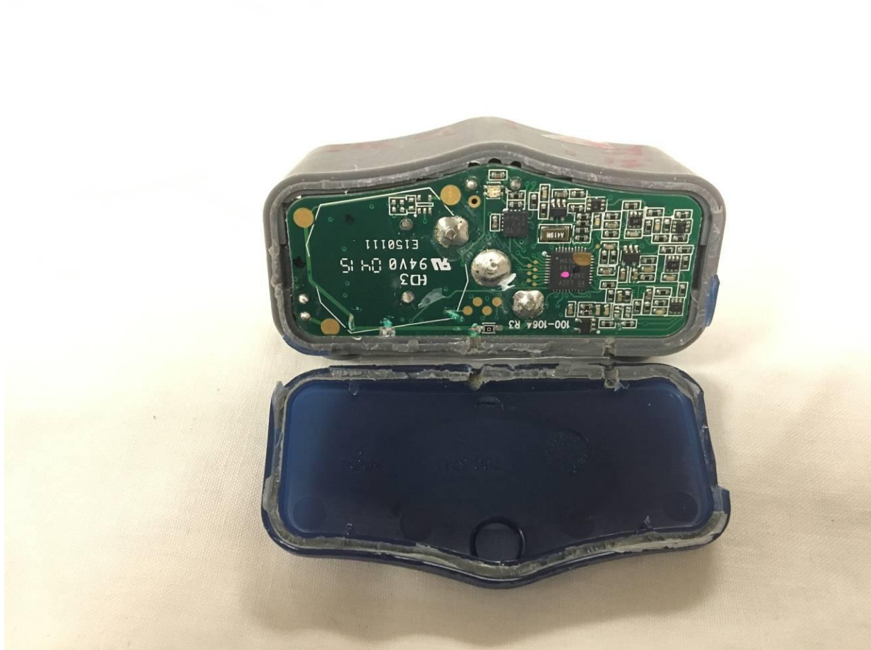
Figure 1. Solder Side of PCB