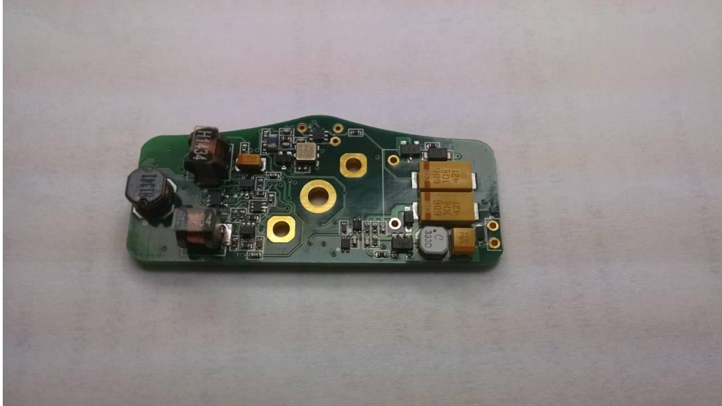
Figure 3. Component Side of PCB Removed from Enclosure

FCC Part 15 Certification/ RSS 210 KE3-3003057 2721A-3003057 15-0262 November 19, 2015 Radio Systems RIG00-15265