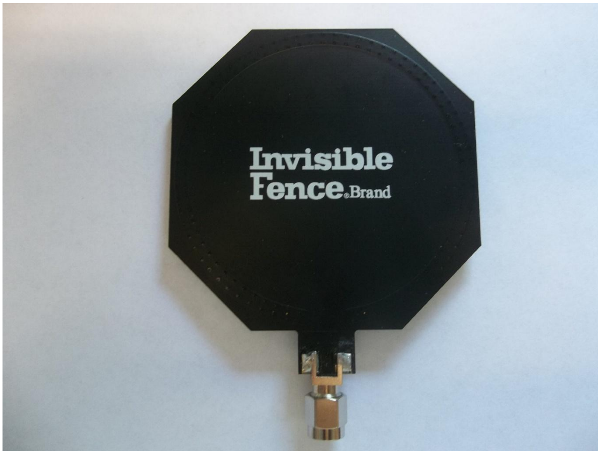
Figure 1. Transmitting Antenna Front