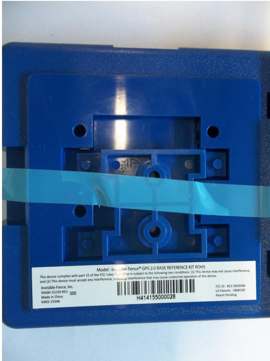
Figure 2. Label Location

FCC Part 95 15-0116 April 30, 2015 Radio Systems Corporation 300-3048 KE3-3003048