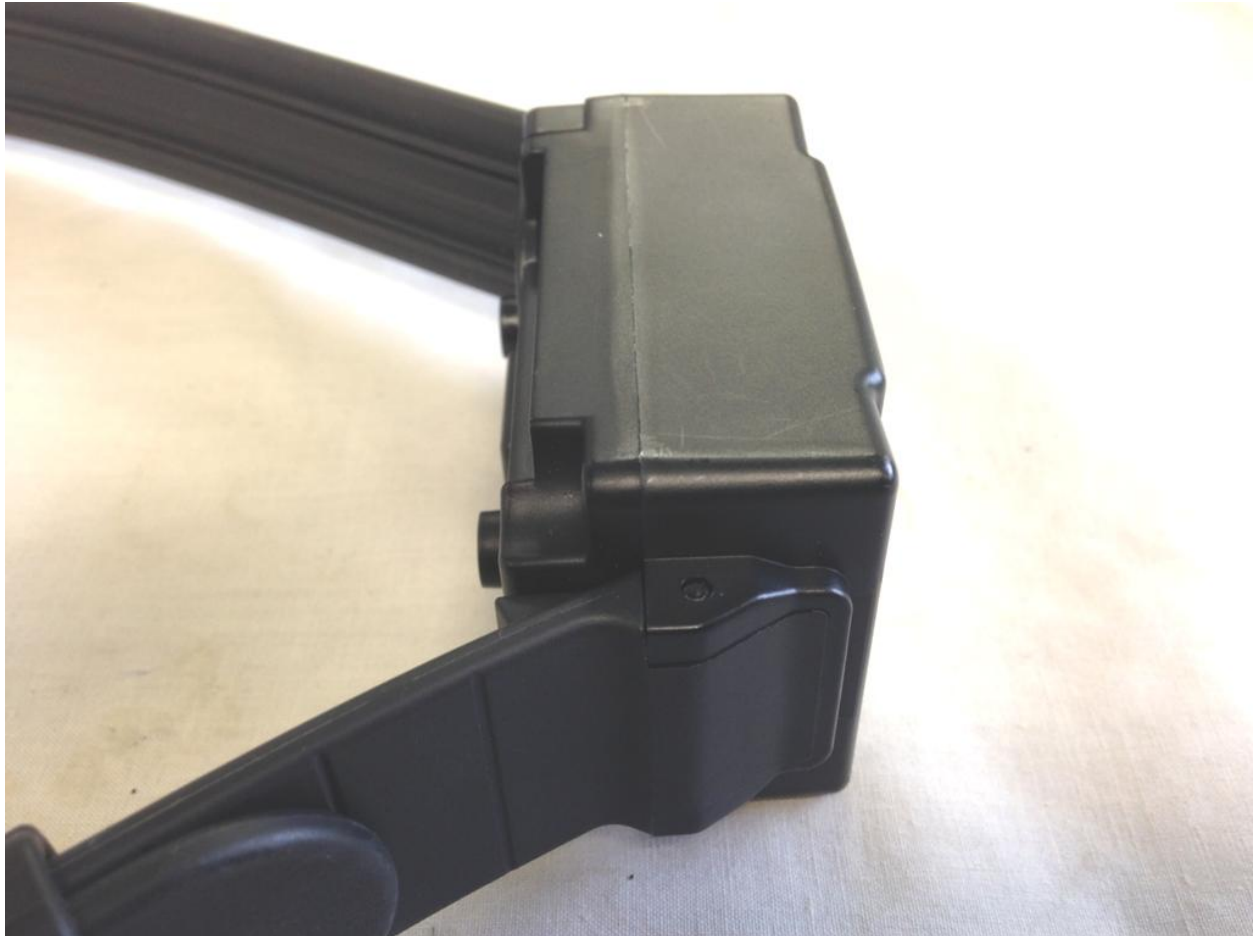
Figure 5. Side 2

FCC Part 95 14-0126 June 21, 2014 Radio Systems Corporation 300-2946 KE3-3002946