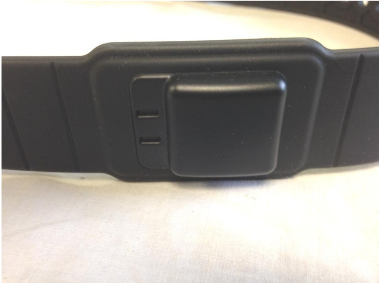
Figure 8. GPS RX Antenna (Outside Collar)

FCC Part 95 14-0126 June 21, 2014 Radio Systems Corporation 300-2946 KE3-3002946