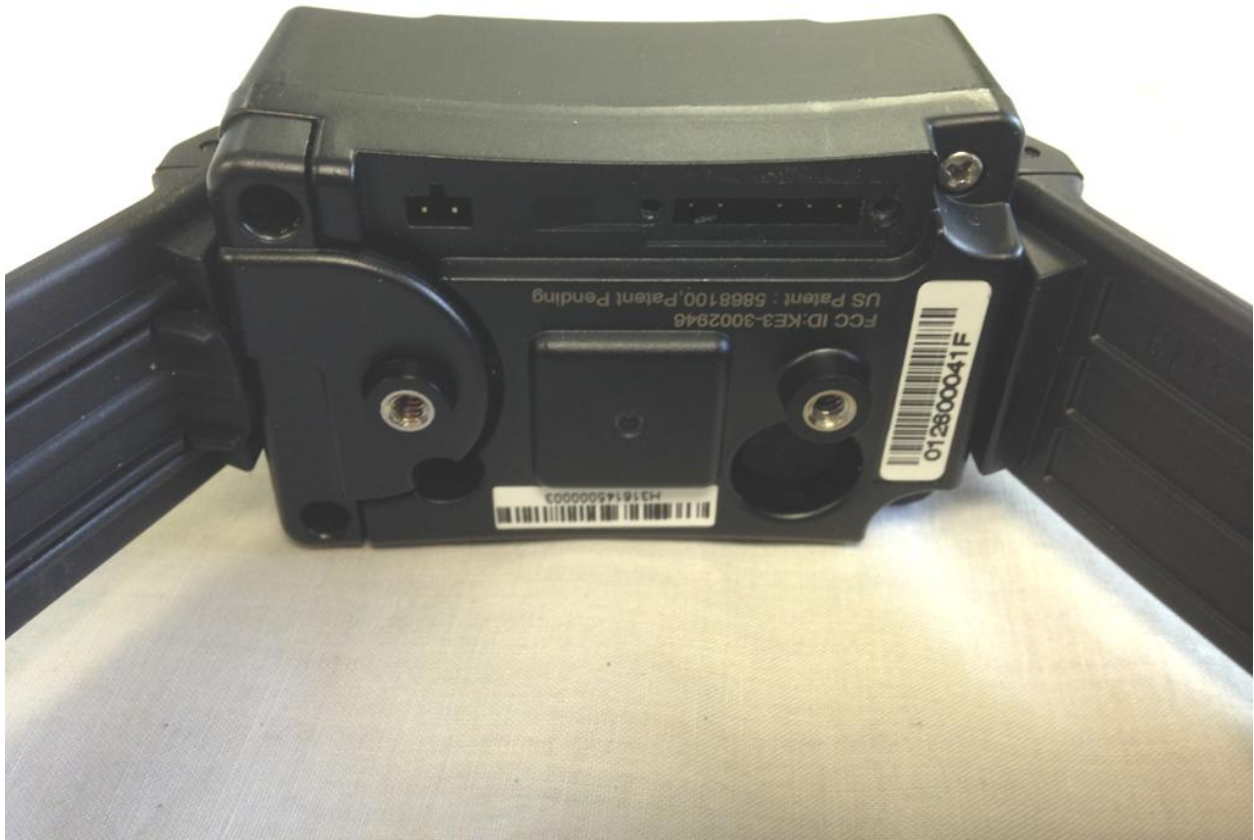
Figure 6. Back Inside Collar

FCC Part 95 14-0126 June 21, 2014 Radio Systems Corporation 300-2946 KE3-3002946