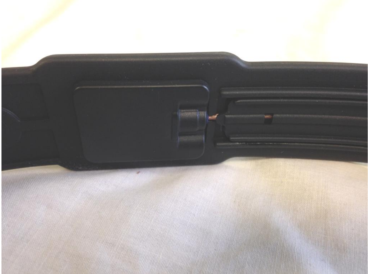
Figure 7. GPS RX Antenna (Inside Collar)

FCC Part 95 14-0126 June 21, 2014 Radio Systems Corporation 300-2946 KE3-3002946