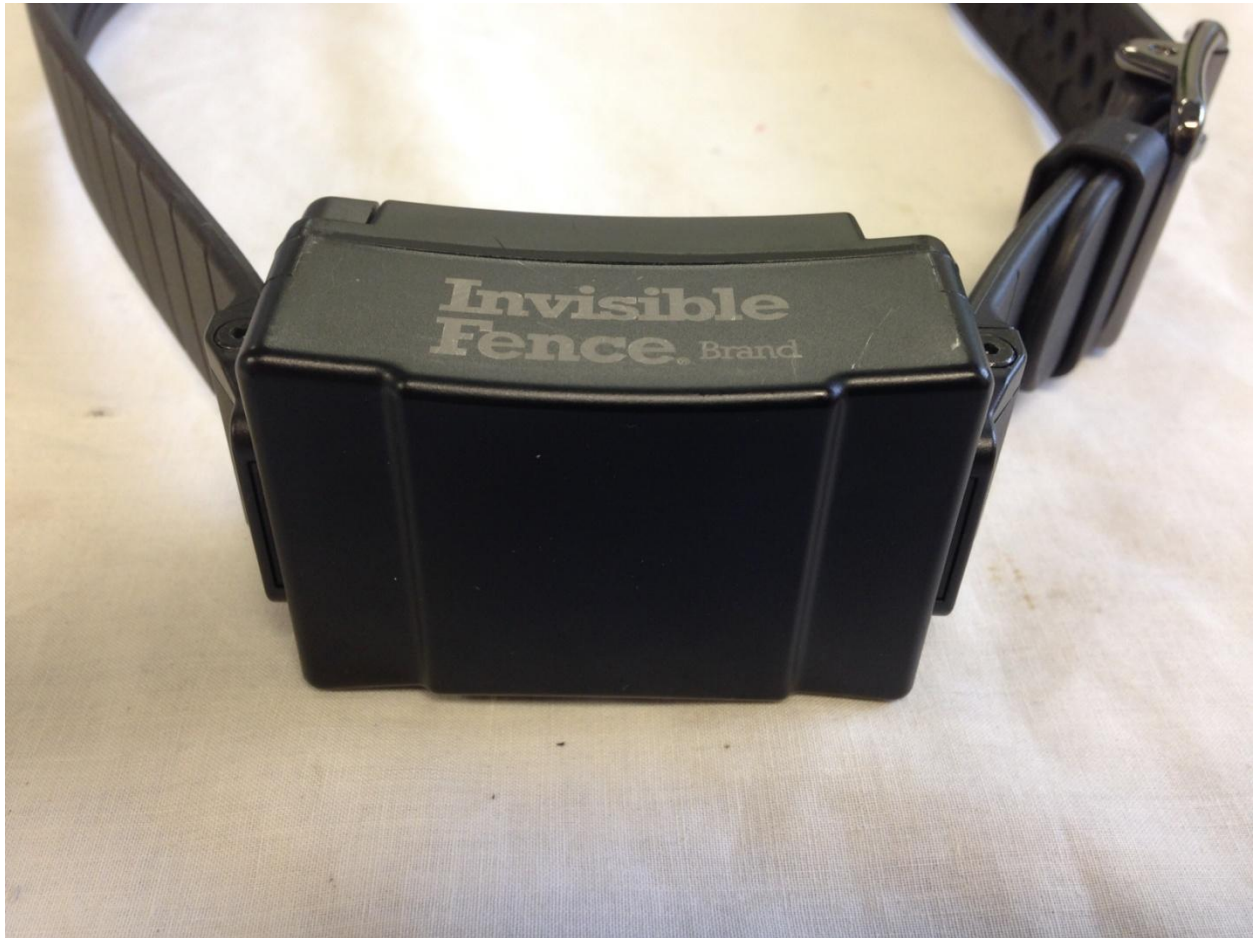
Figure 2. Top

FCC Part 95 14-0126 June 21, 2014 Radio Systems Corporation 300-2946 KE3-3002946