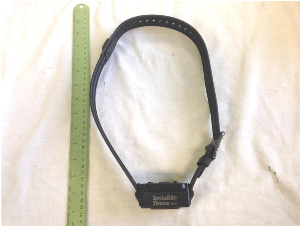
Figure 1. EUT