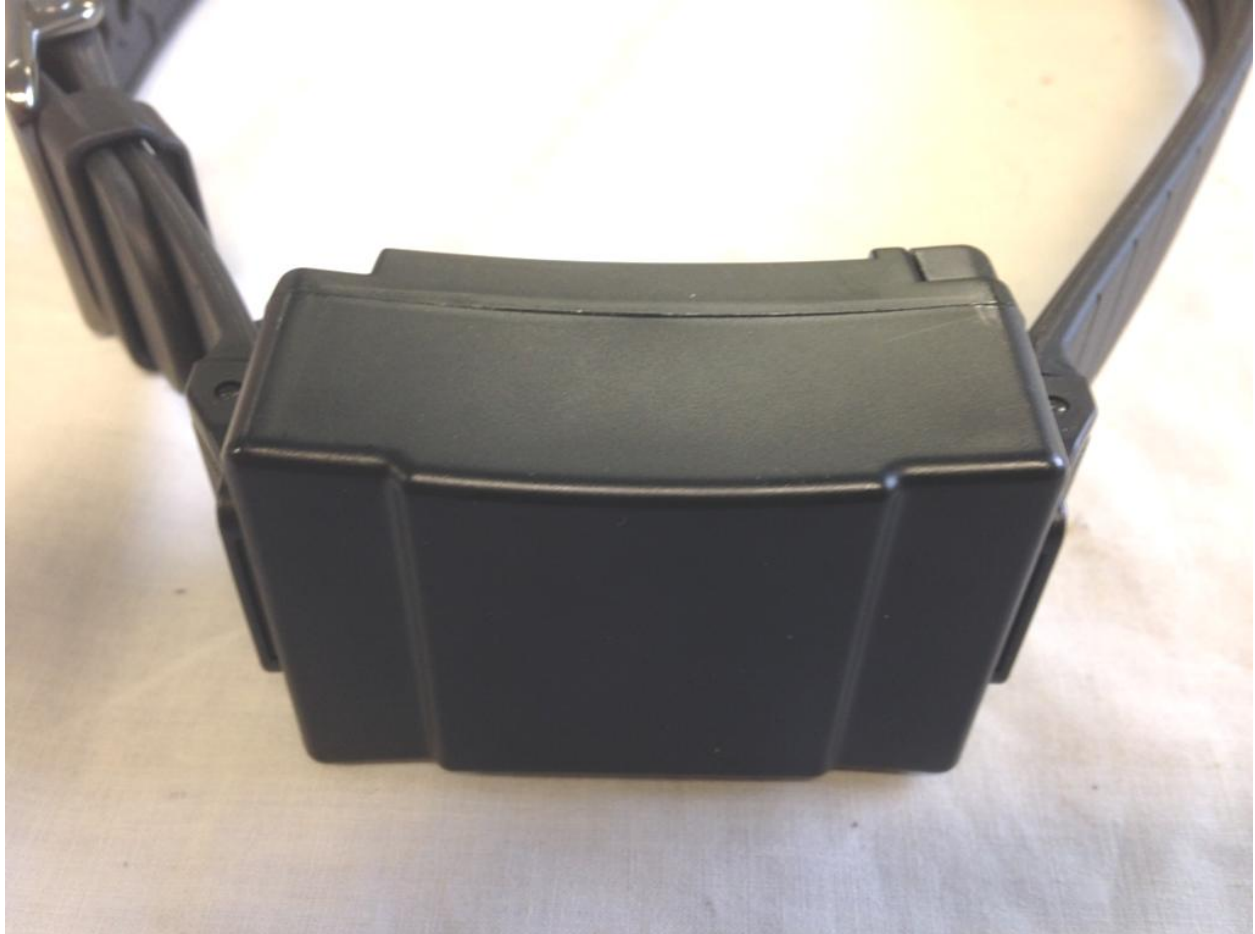
Figure 3. Bottom

FCC Part 95 14-0126 June 21, 2014 Radio Systems Corporation 300-2946 KE3-3002946