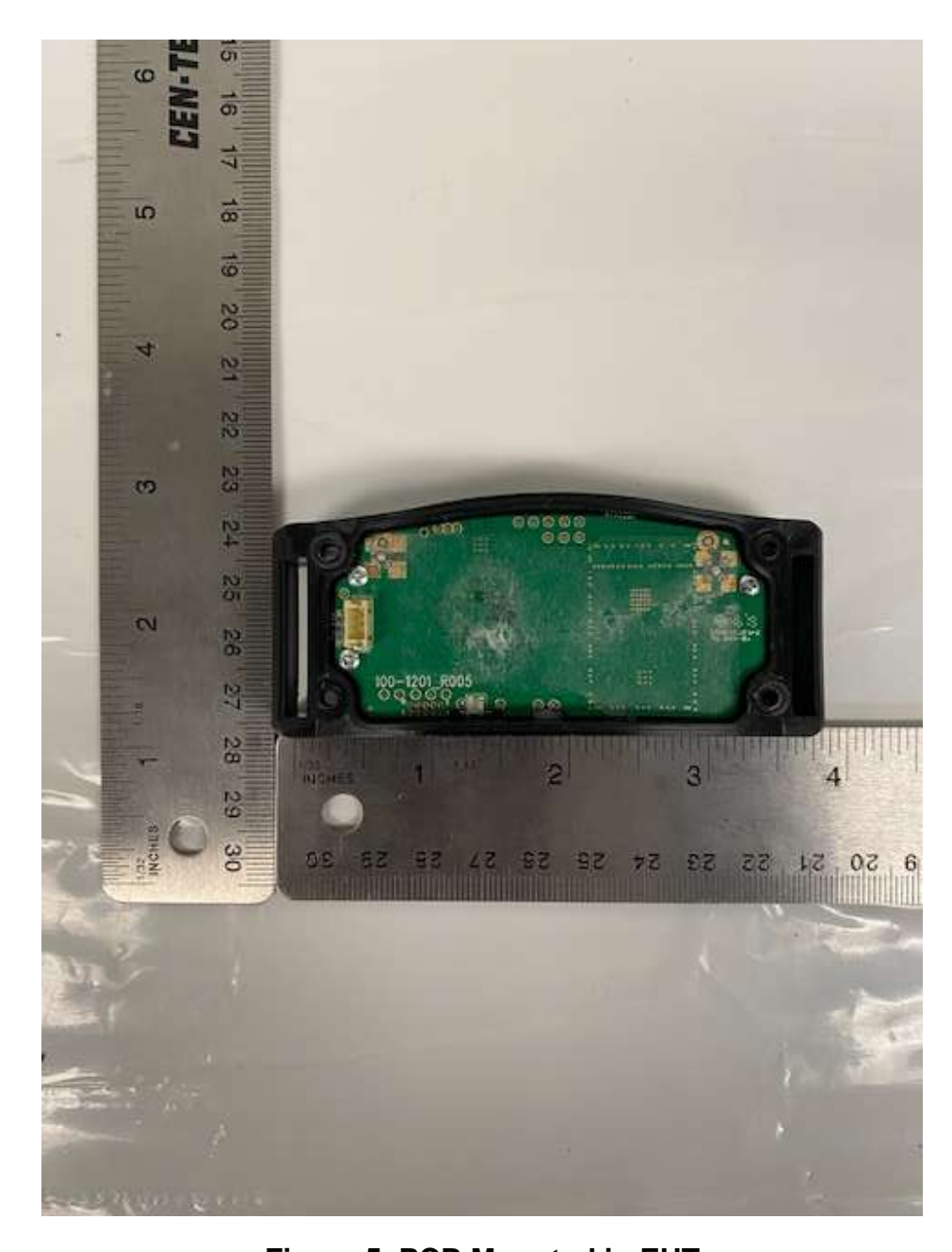
Figure 5. PCB Mounted in EUT