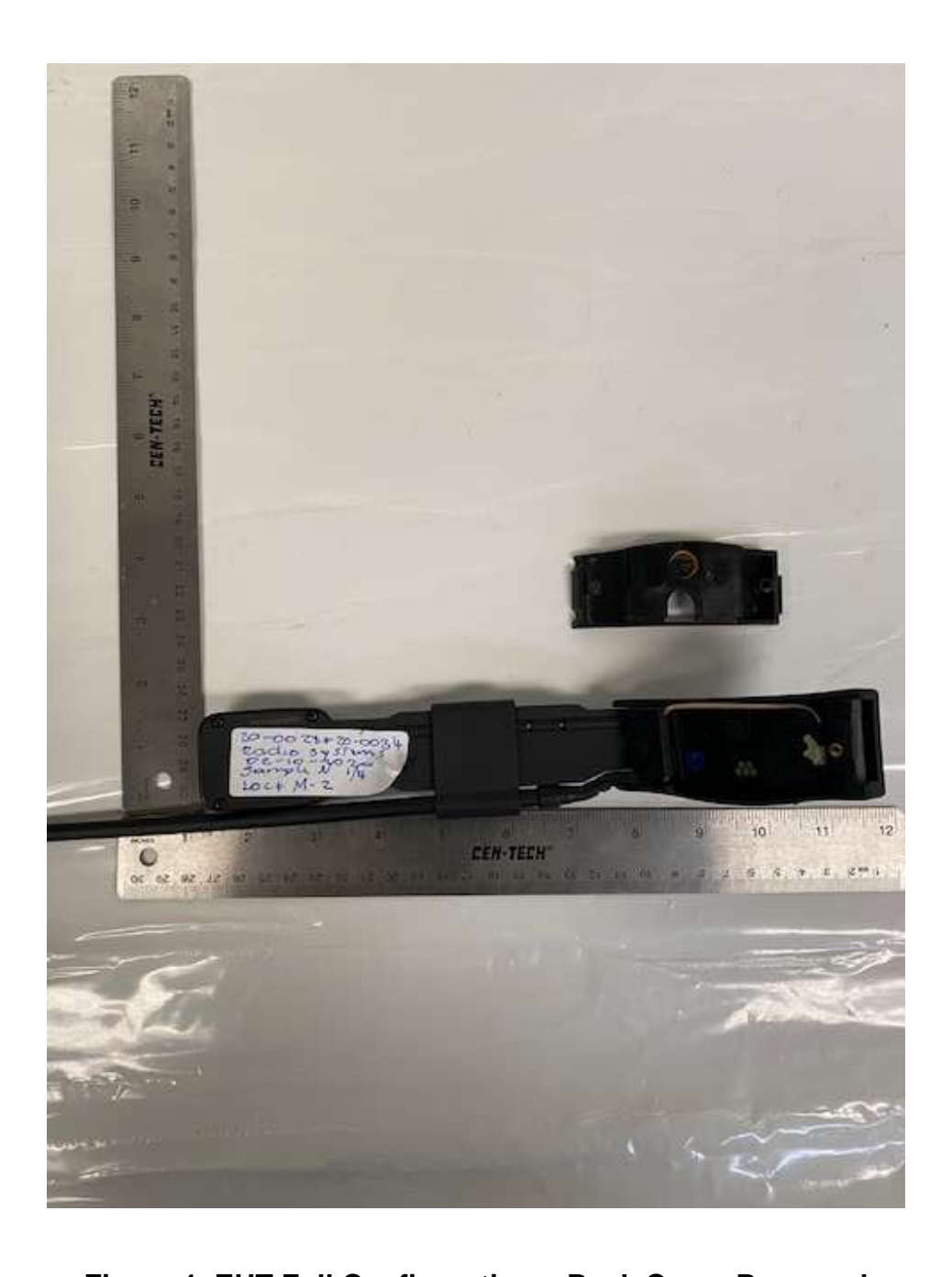
Figure 1. EUT Full Configuration – Back Cover Removed