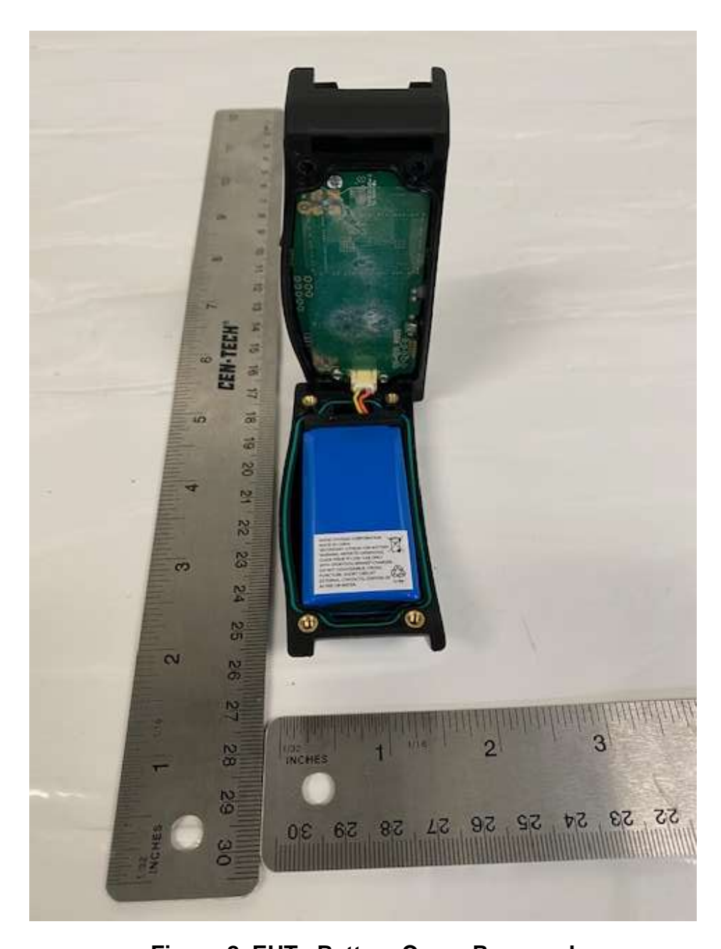
Figure 2. EUT- Battery Cover Removed