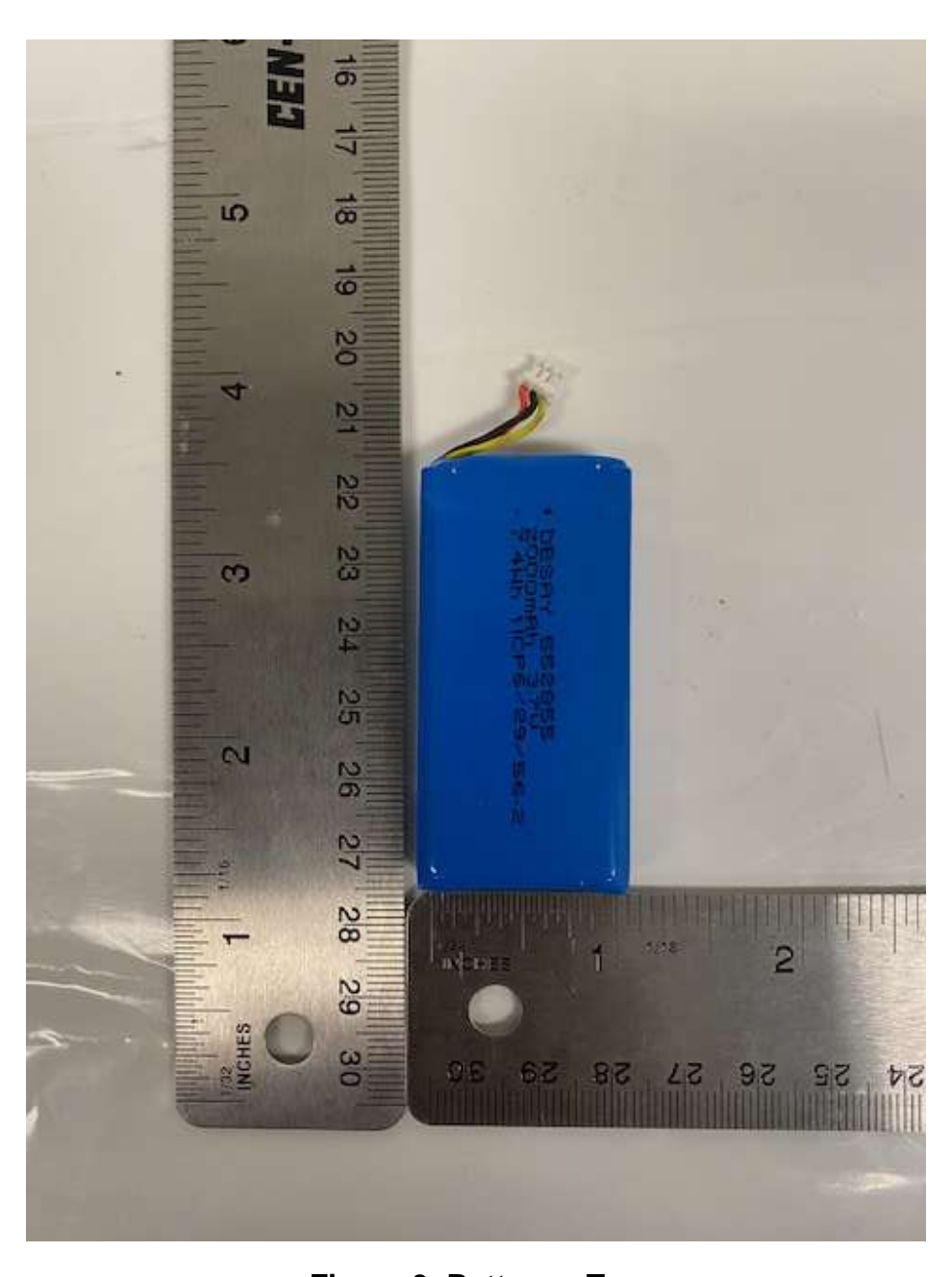
Figure 3. Battery - Top