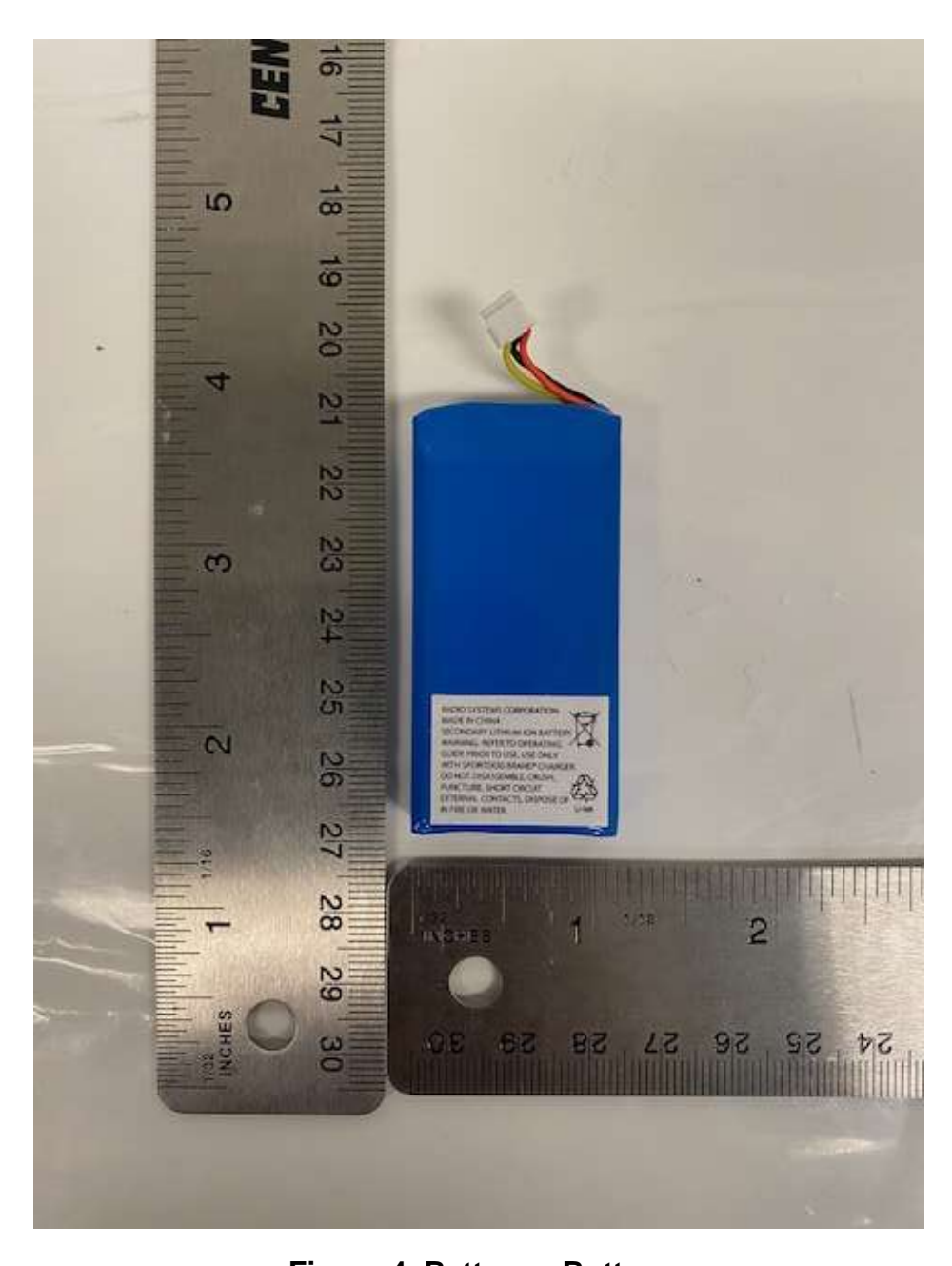
Figure 4. Battery – Bottom