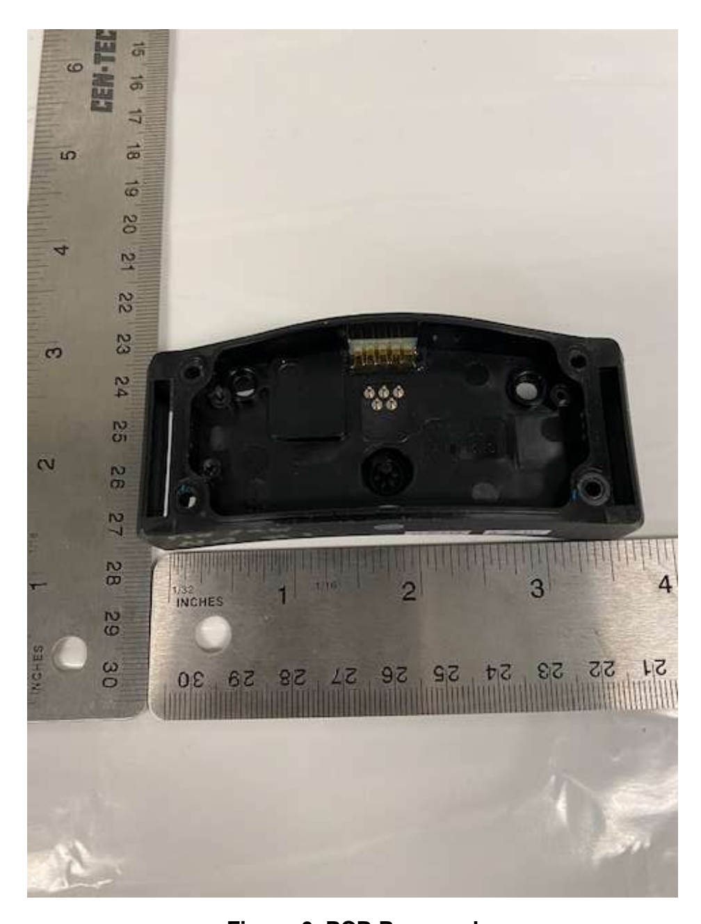
Figure 6. PCB Removed