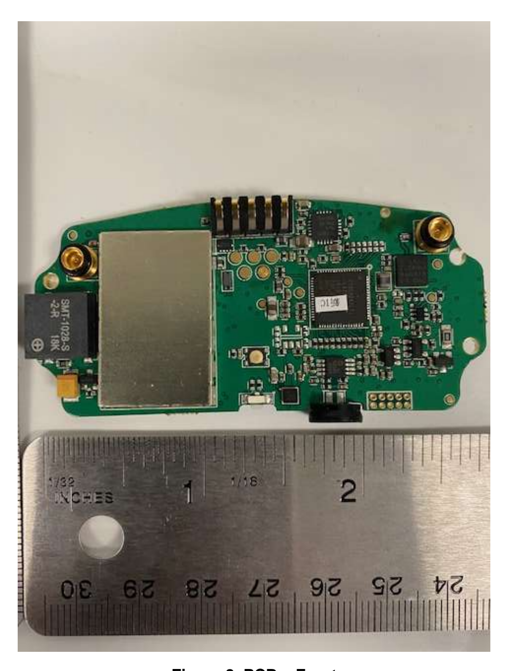
Figure 8. PCB - Front

Test Report Number: Issue Date: Customer: Model: