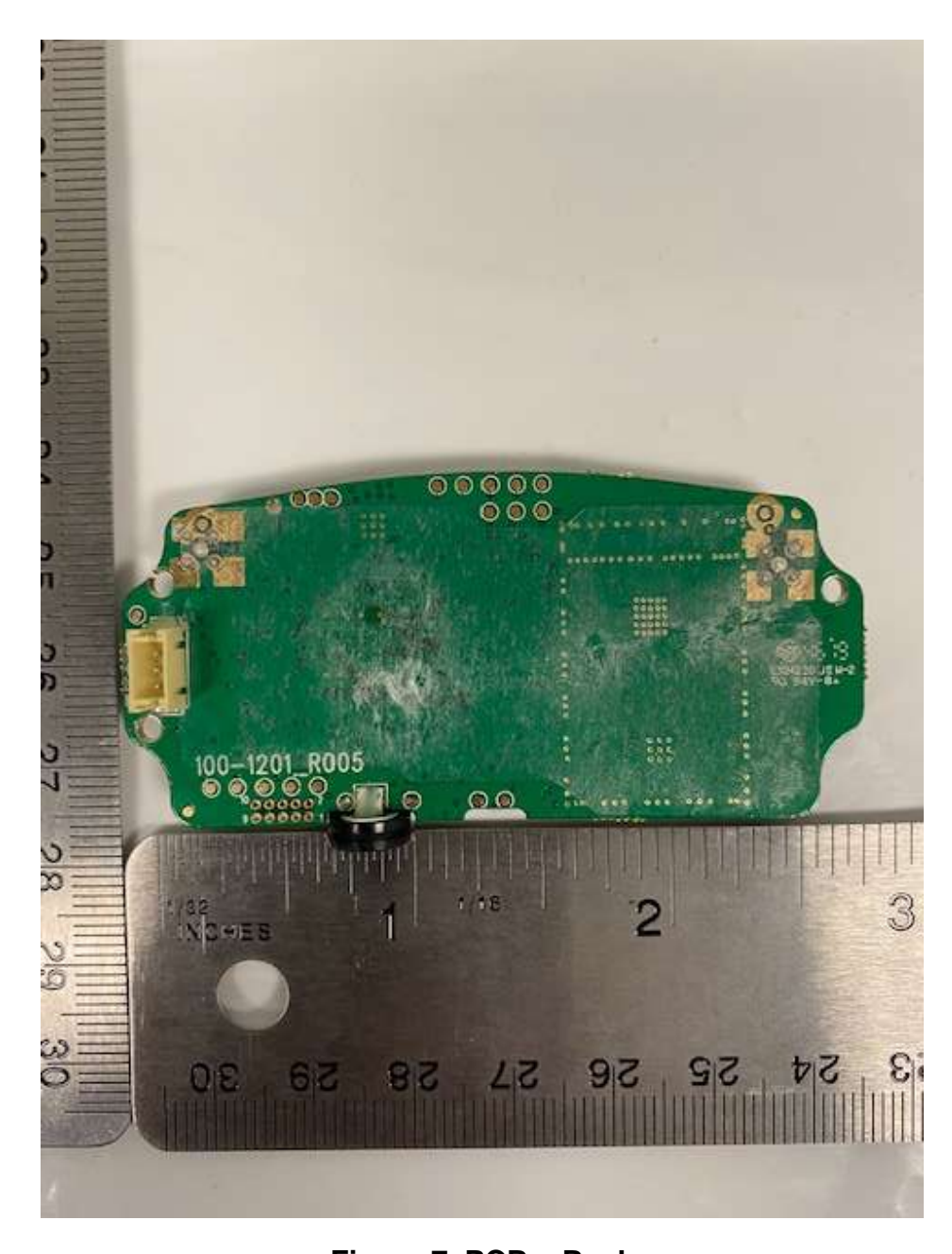
Figure 7. PCB - Back