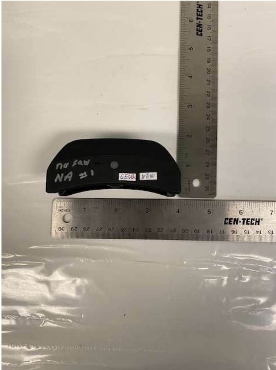
Figure 7. EUT without Antenna – Top

FCC Part 15/IC RSS Certification KE3-3002862 2721A-3002862 20-0028 February 21, 2020 Radio Systems, Inc. SDT52-14790