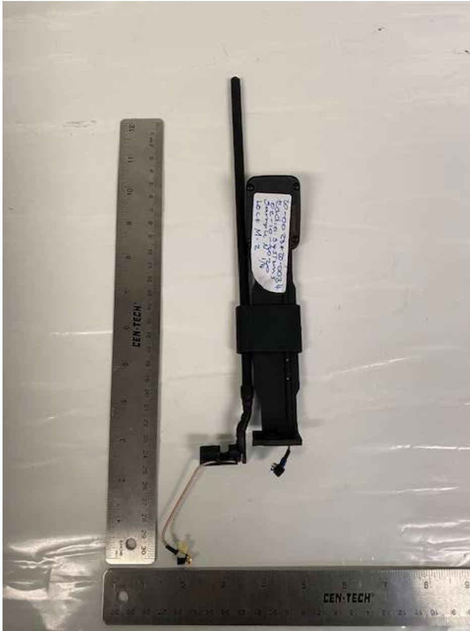
Figure 5. Antenna Section – Front

FCC Part 15/IC RSS Certification KE3-3002862 2721A-3002862 20-0028 February 21, 2020 Radio Systems, Inc. SDT52-14790