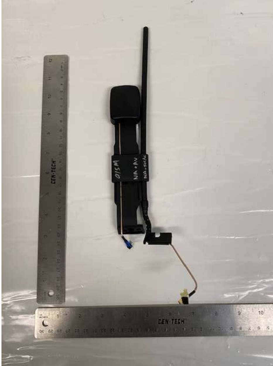
Figure 6. Antenna Section – Back

FCC Part 15/IC RSS Certification KE3-3002862 2721A-3002862 20-0028 February 21, 2020 Radio Systems, Inc. SDT52-14790