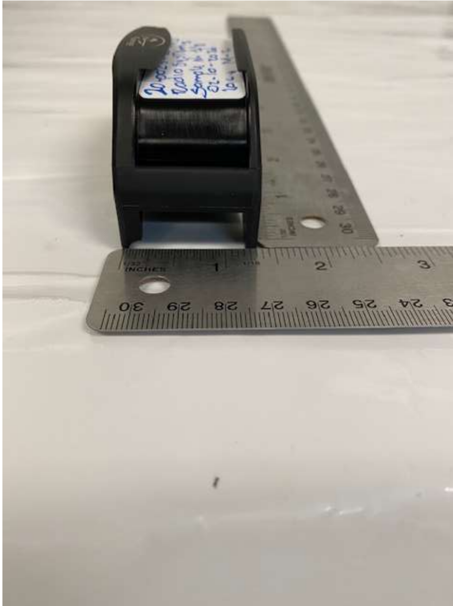
Figure 11. EUT without Antenna – Left Side

FCC Part 15/IC RSS Certification KE3-3002862 2721A-3002862 20-0028 February 21, 2020 Radio Systems, Inc. SDT52-14790