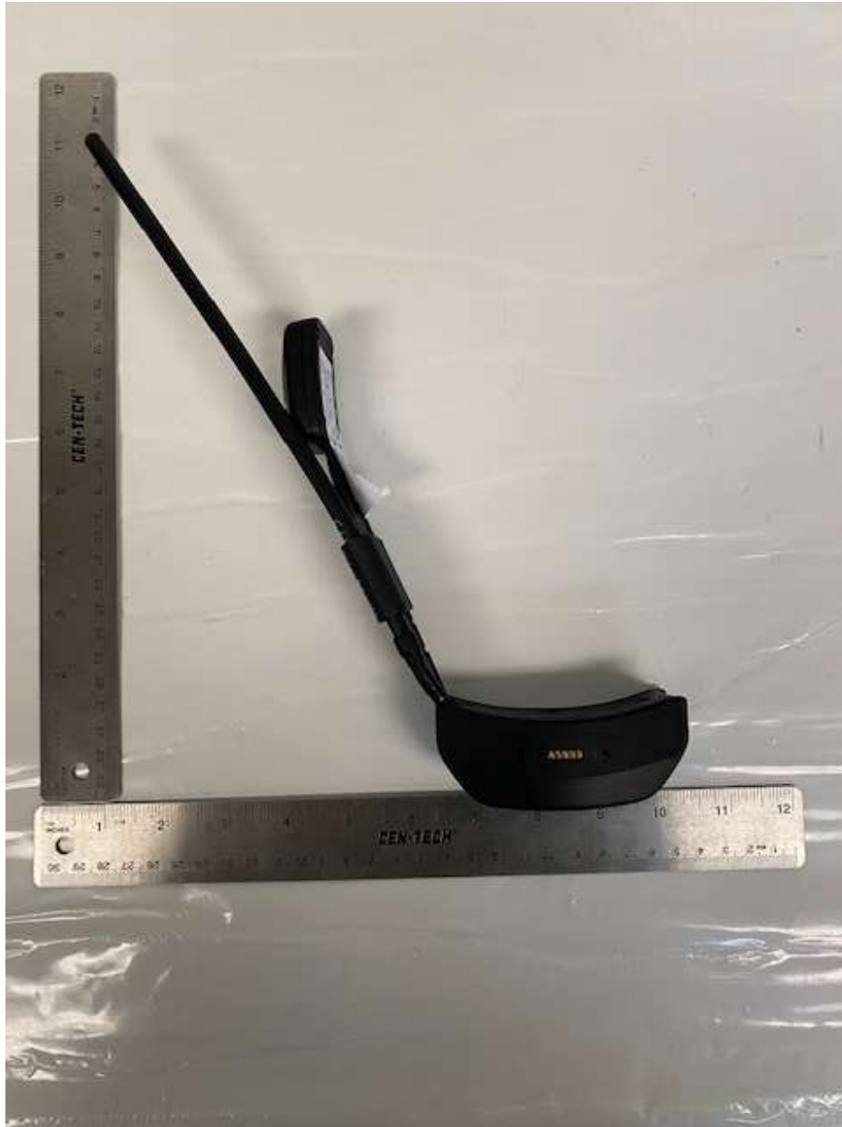
Figure 2. EUT Full Configuration – Bottom

FCC Part 15/IC RSS Certification KE3-3002862 2721A-3002862 20-0028 February 21, 2020 Radio Systems, Inc. SDT52-14790