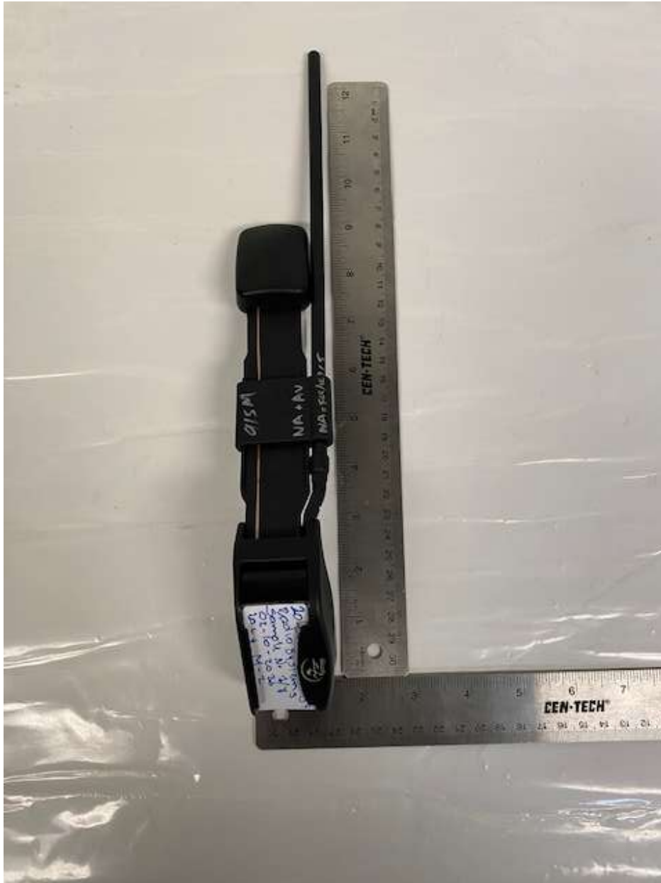
Figure 4. EUT Full Configuration – Back

FCC Part 15/IC RSS Certification KE3-3002862 2721A-3002862 20-0028 February 21, 2020 Radio Systems, Inc. SDT52-14790