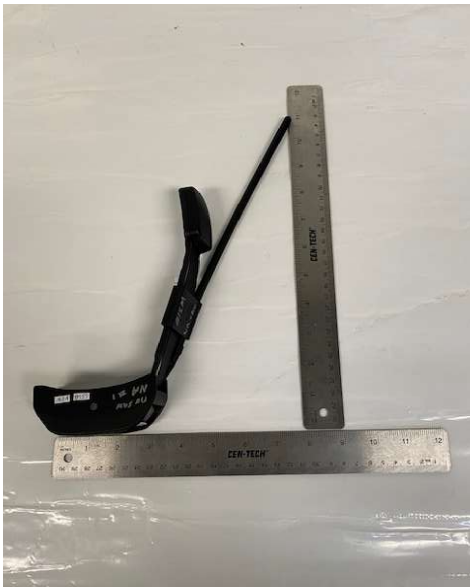
Figure 1. EUT Full Configuration – Top