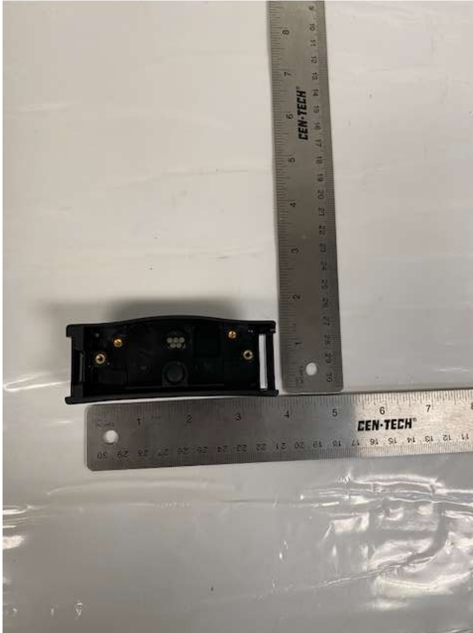
Figure 10. EUT without Antenna – Back

FCC Part 15/IC RSS Certification KE3-3002862 2721A-3002862 20-0028 February 21, 2020 Radio Systems, Inc. SDT52-14790