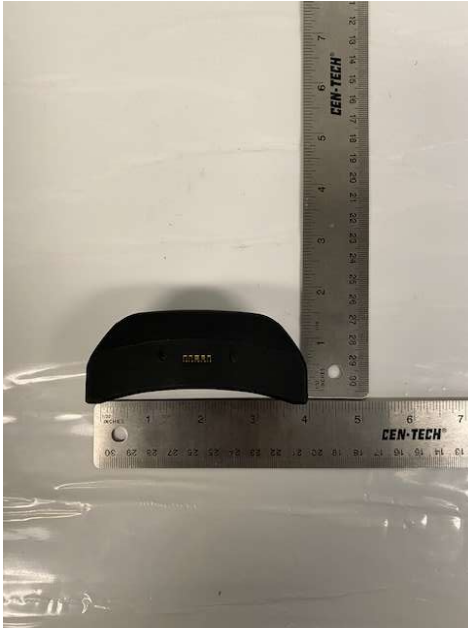
Figure 8. EUT without Antenna – Bottom

FCC Part 15/IC RSS Certification KE3-3002862 2721A-3002862 20-0028 February 21, 2020 Radio Systems, Inc. SDT52-14790