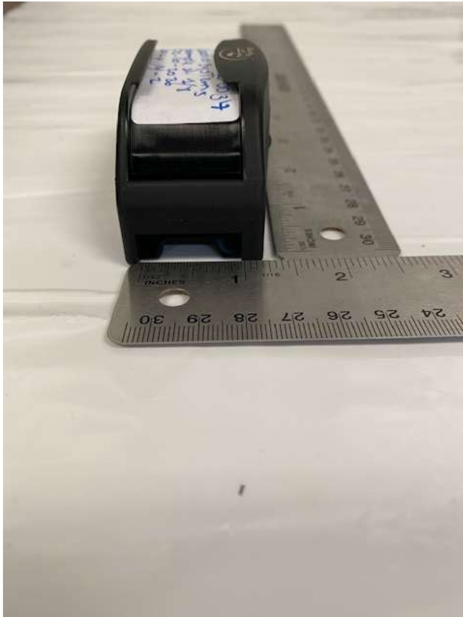
Figure 12. EUT without Antenna – Right Side

FCC Part 15/IC RSS Certification KE3-3002862 2721A-3002862 20-0028 February 21, 2020 Radio Systems, Inc. SDT52-14790