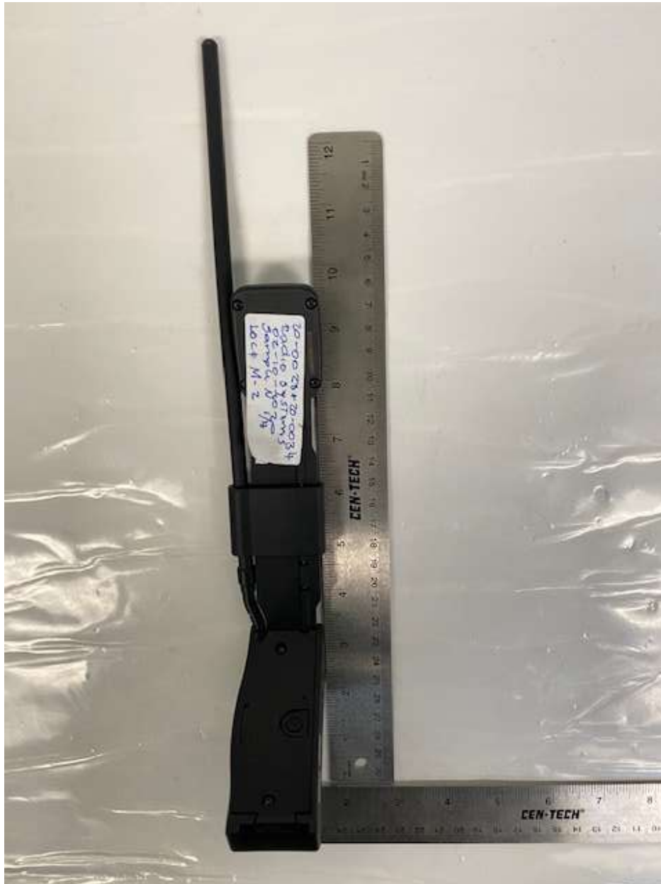
Figure 3. EUT Full Configuration – Front

FCC Part 15/IC RSS Certification KE3-3002862 2721A-3002862 20-0028 February 21, 2020 Radio Systems, Inc. SDT52-14790