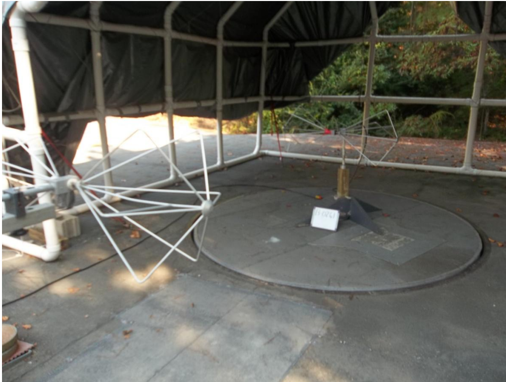
Figure 3. Substitution Method Test Setup