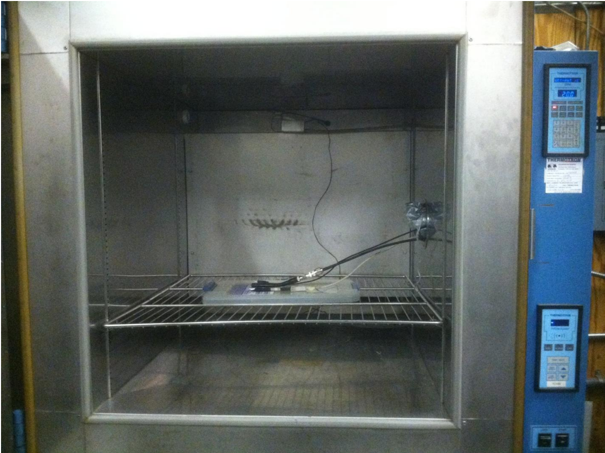
Figure 5. Frequency Stability Test Setup

FCC Part 95 13-0261 October 19, 2013 Radio Systems Corporation 300-2789 KE3-3002789