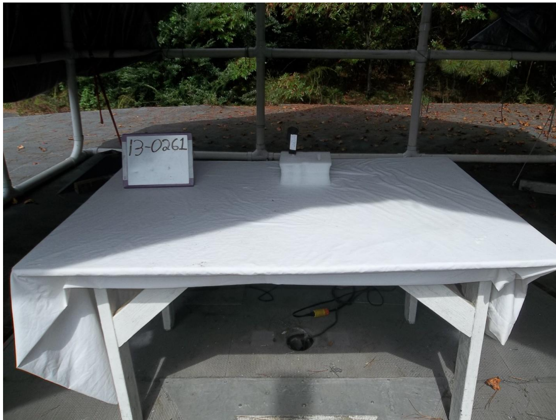
Figure 1. Front View Radiated Emissions Test Setup