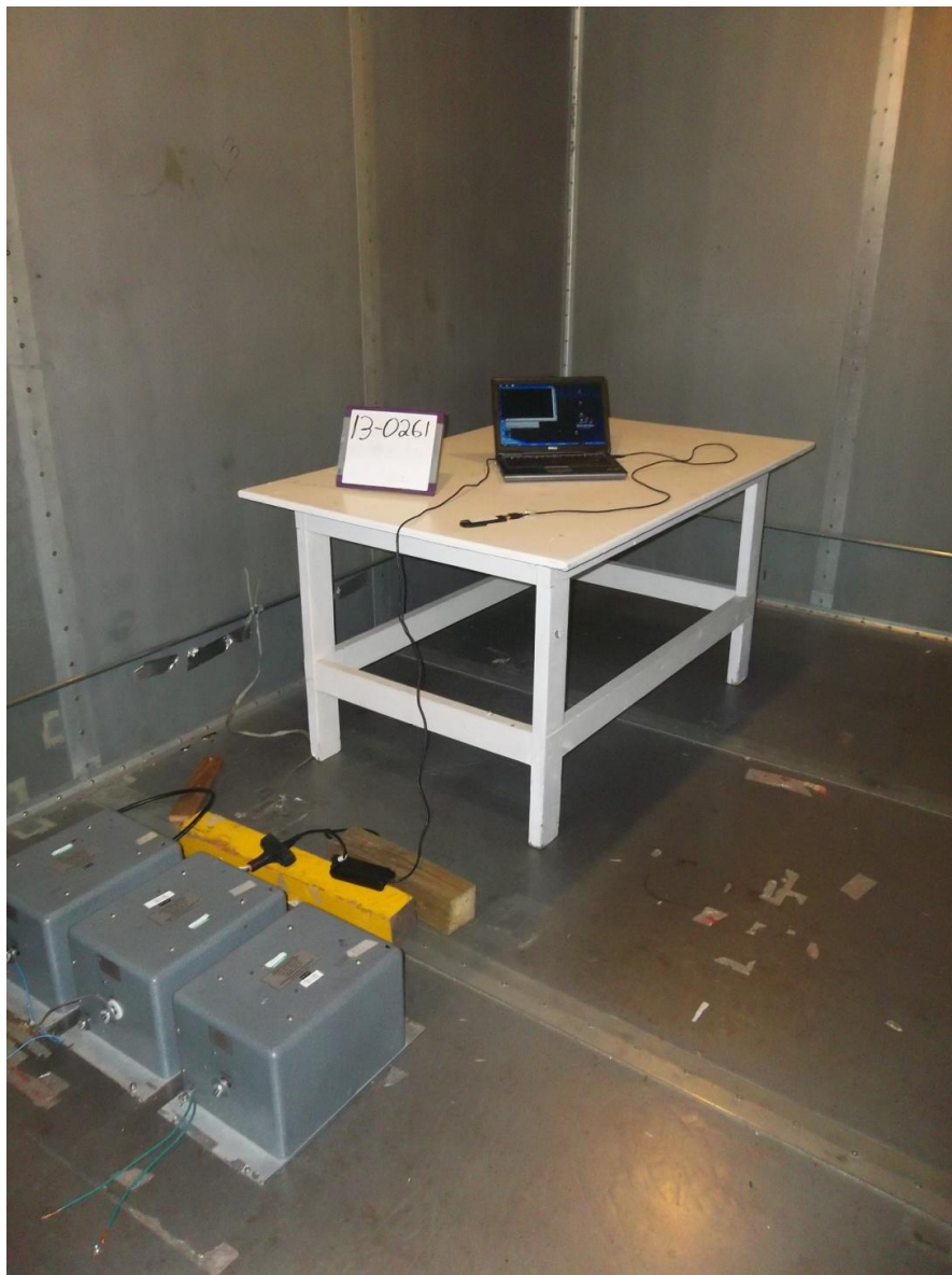
Figure 4. Conducted Emissions Test Setup