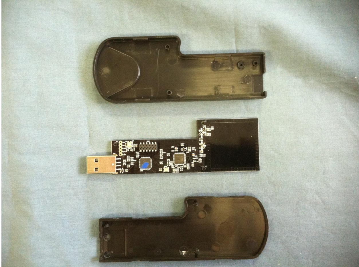
Figure 1. EUT Enclosure - Opened