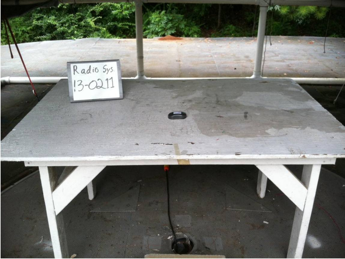
Figure 1- Radiated Emissions Test Setup

Note: EUT tested in three orthogonal positions. The position shown is the worst case position.