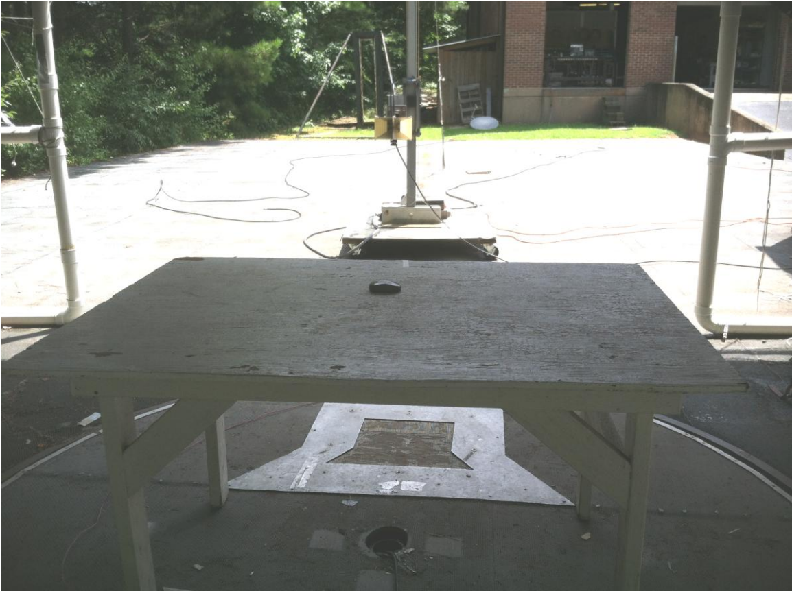
Figure 5. Radiated Emissions Test Setup (above 1 GHz)

FCC Part 15.231/ RSS-210 July 30, 2013 13-0211 Radio Systems Corporation RFA-499Transmitter KE3-3002646 2721A-3002646