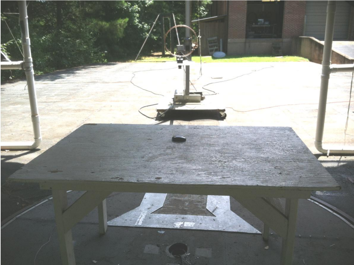
Figure 2- Radiated Emissions Test Setup (below 30 MHz)

FCC Part 15.231/ RSS-210 July 30, 2013 13-0211 Radio Systems Corporation RFA-499Transmitter KE3-3002646 2721A-3002646