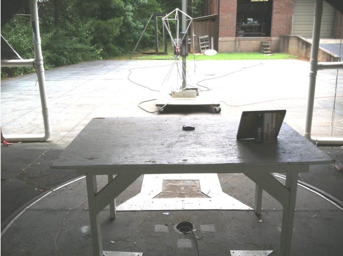
Figure 3- Radiated Emissions Test Setup (between 30 - 200 MHz)

FCC Part 15.231/ RSS-210 July 30, 2013 13-0211 Radio Systems Corporation RFA-499Transmitter KE3-3002646 2721A-3002646