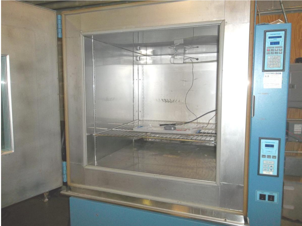
Figure 6- Frequency Stability Test Setup

FCC Part 15.231/ RSS-210 July 30, 2013 13-0211 Radio Systems Corporation RFA-499 Transmitter KE3-3002646 2721A-3002646