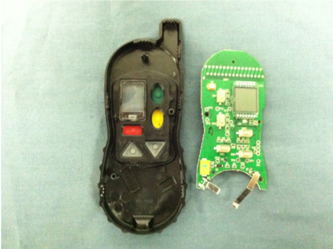
Figure 2- PCB removed

FCC P15.231/IC RSS-210 12-0487 January 11, 2013 Radio Systems Corporation RFA-498 KE3-3002642 2721A-3002642