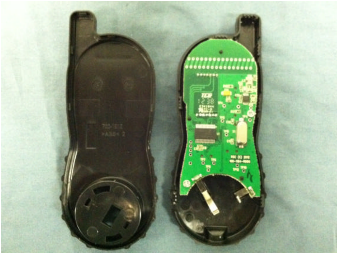
Figure 1- Back cover removed