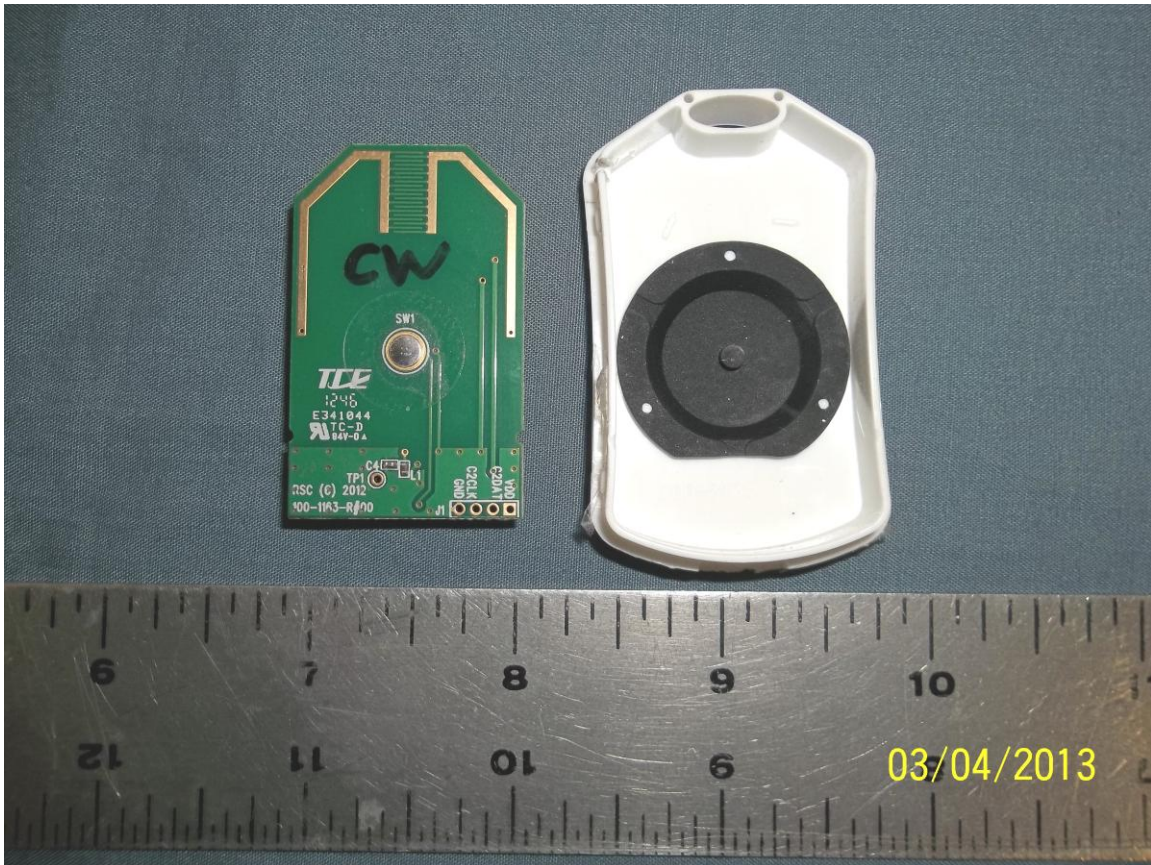
Figure 2- PCB removed

FCC Part 15.231/ RSS-210 March 6, 2013 13-0034 Radio Systems Corporation RFA-501 Transmitter KE3-3002638 2721A-3002638