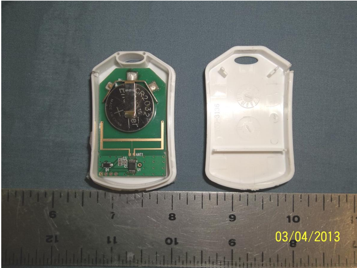
Figure 1- Back Cover Removed