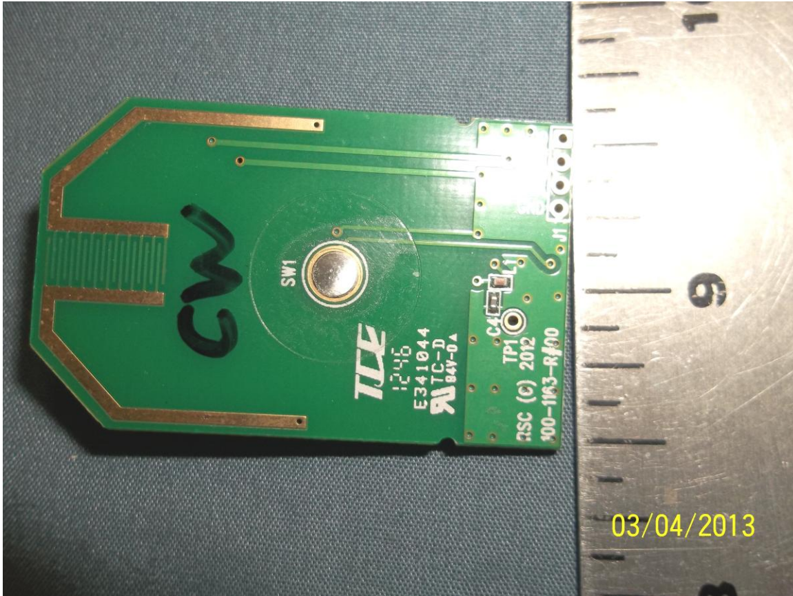
Figure 4- Bottom of PCB

FCC Part 15.231/ RSS-210 March 6, 2013 13-0034 Radio Systems Corporation RFA-501 Transmitter KE3-3002638 2721A-3002638