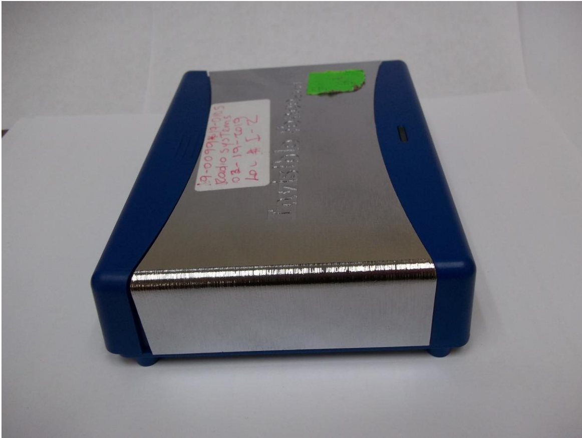
Figure 6. EUT, Side 1

FCC Part 15 Certification/ RSS 210 KE3-3002587-1 2721A-30025871 19-0099 April 29, 2019 Radio Systems Boundary Plus Single Loop Transmitter