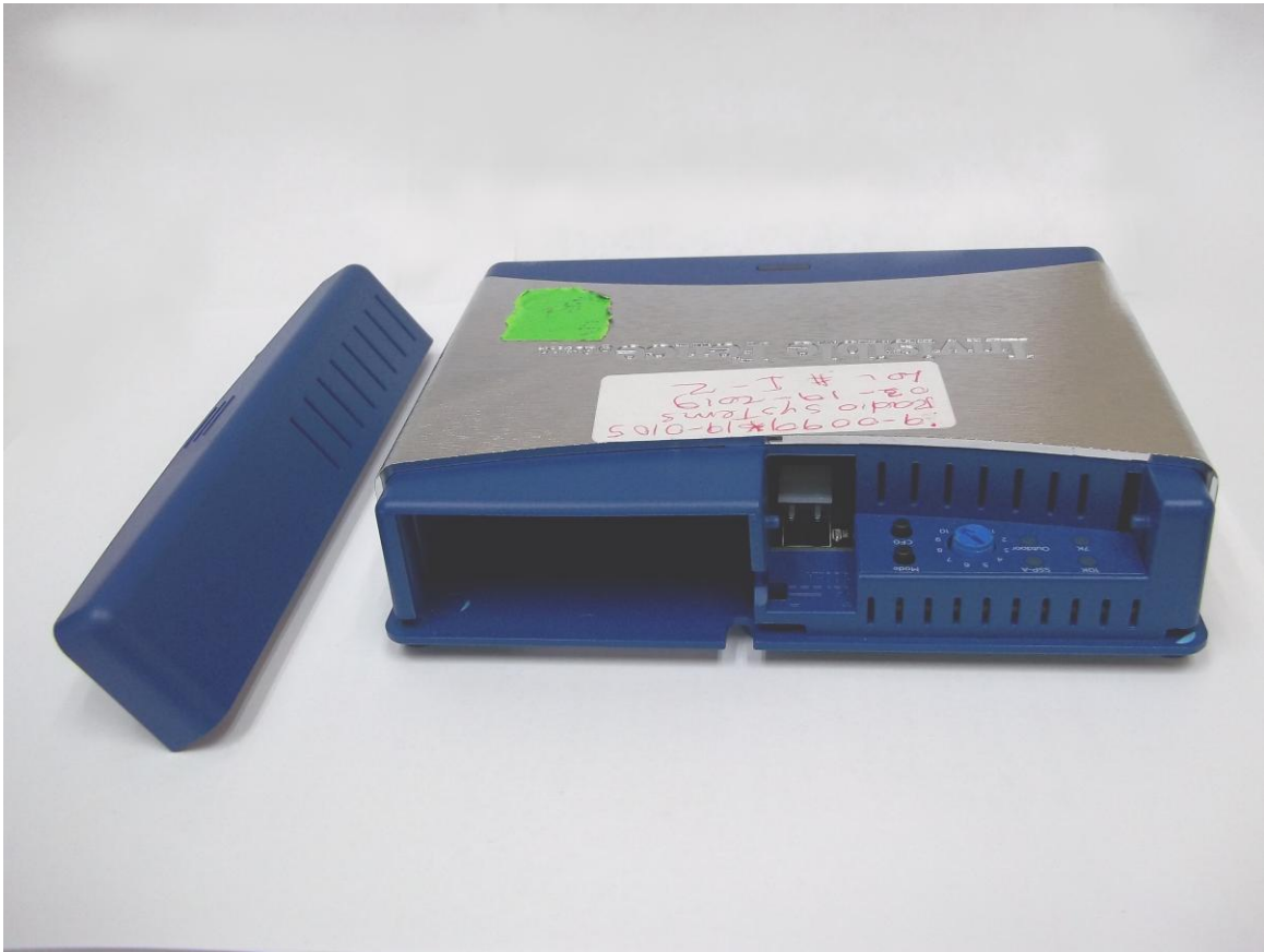
Figure 5. EUT Front, with Front Cover Removed

FCC Part 15 Certification/ RSS 210 KE3-3002587-1 2721A-30025871 19-0099 April 29, 2019 Radio Systems Boundary Plus Single Loop Transmitter