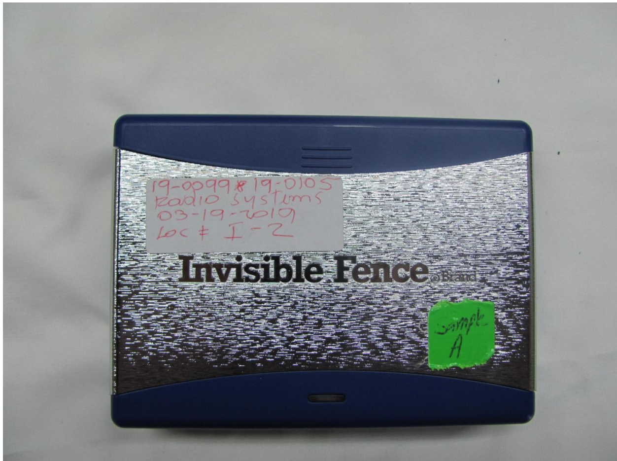
Figure 1. EUT, Top