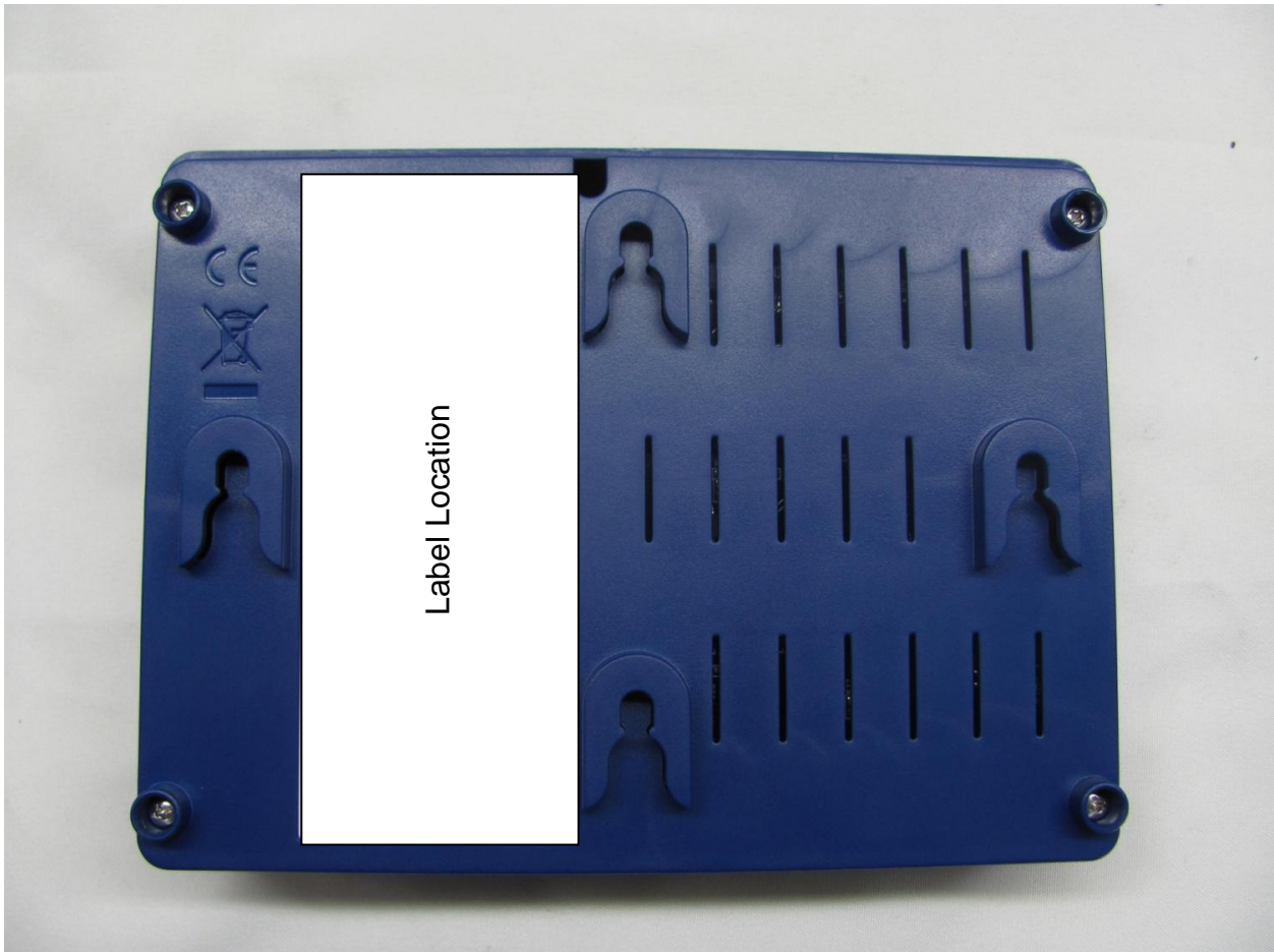
Figure 2. EUT, Bottom

FCC Part 15 Certification/ RSS 210 KE3-3002587-1 2721A-30025871 19-0099 April 29, 2019 Radio Systems Boundary Plus Single Loop Transmitter