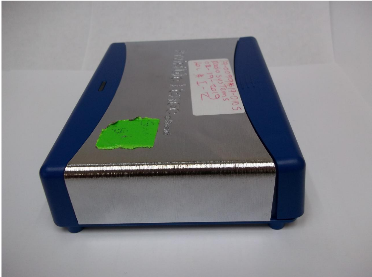
Figure 7. EUT, Side 2

FCC Part 15 Certification/ RSS 210 KE3-3002587-1 2721A-30025871 19-0099 April 29, 2019 Radio Systems Boundary Plus Single Loop Transmitter