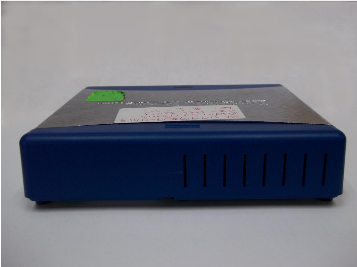
Figure 3. EUT, Front

FCC Part 15 Certification/ RSS 210 KE3-3002587-1 2721A-30025871 19-0099 April 29, 2019 Radio Systems Boundary Plus Single Loop Transmitter