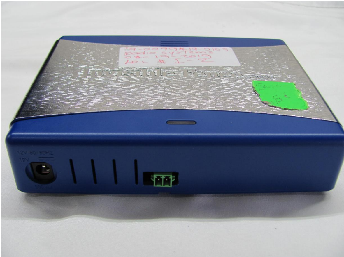
Figure 4. EUT, Back

FCC Part 15 Certification/ RSS 210 KE3-3002587-1 2721A-30025871 19-0099 April 29, 2019 Radio Systems Boundary Plus Single Loop Transmitter