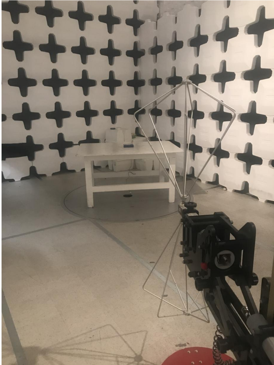
Figure 2. Radiated Emissions Test Setup (30 - 200 MHz)

FCC Part 15 Certification/ RSS 210 KE3-3002587-1 2721A-30025871 19-0099 April 29, 2019 Radio Systems Boundary Plus Single Loop Transmitter