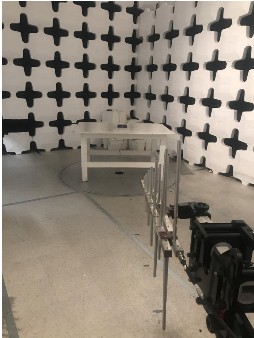
Figure 3. Radiated Emissions Test Setup (200 Mhz - 1 GHz)

FCC Part 15 Certification/ RSS 210 KE3-3002587-1 2721A-30025871 19-0099 April 29, 2019 Radio Systems Boundary Plus Single Loop Transmitter