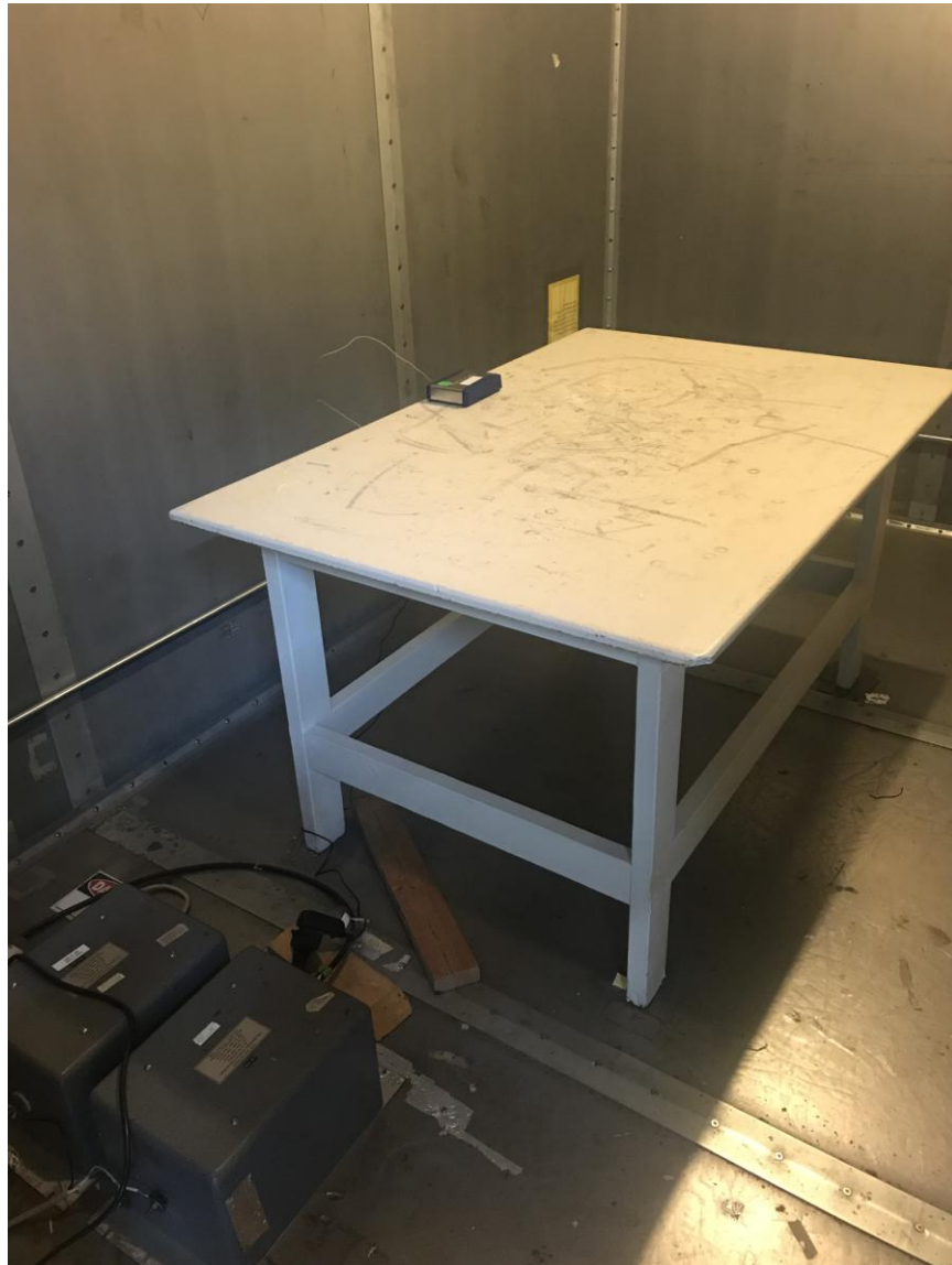
Figure 4. Power Line Conducted Emissions Test Setup

FCC Part 15 Certification/ RSS 210 KE3-3002587-1 2721A-30025871 19-0099 April 29, 2019 Radio Systems Boundary Plus Single Loop Transmitter