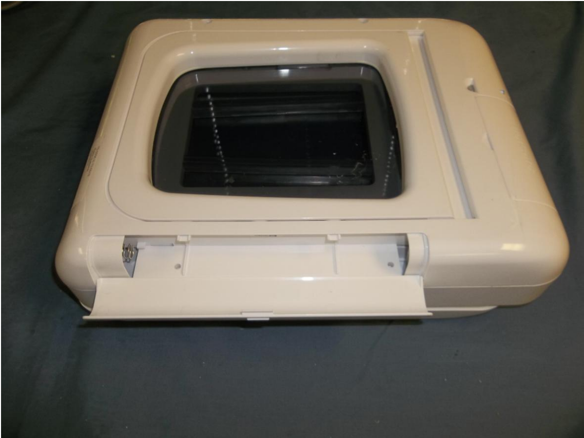
Figure 8. EUT - Battery Compartment Open

FCC Part 15.209/ RSS-210 April 16, 2013 13-0013 Radio Systems Corporation 300-2564 KE3-3002564 2721A-3002564