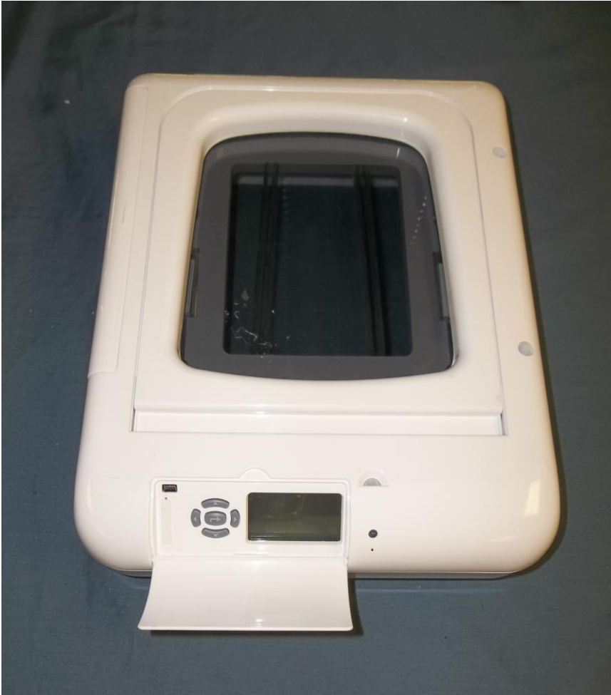
Figure 6. EUT - User Control Panel Open

FCC Part 15.209/ RSS-210 April 16, 2013 13-0013 Radio Systems Corporation 300-2564 KE3-3002564 2721A-3002564