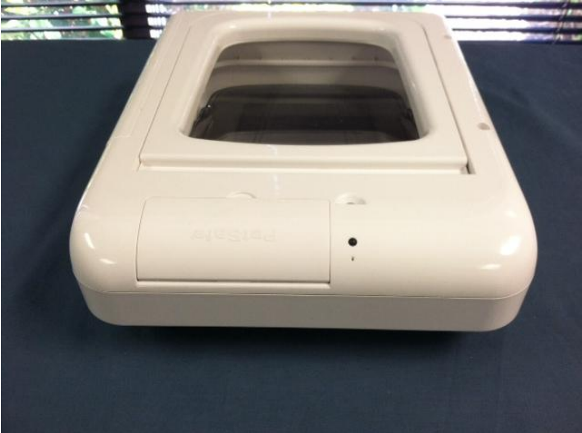
Figure 3. EUT - Side 1

FCC Part 15.209/ RSS-210 April 16, 2013 13-0013 Radio Systems Corporation 300-2564 KE3-3002564 2721A-3002564