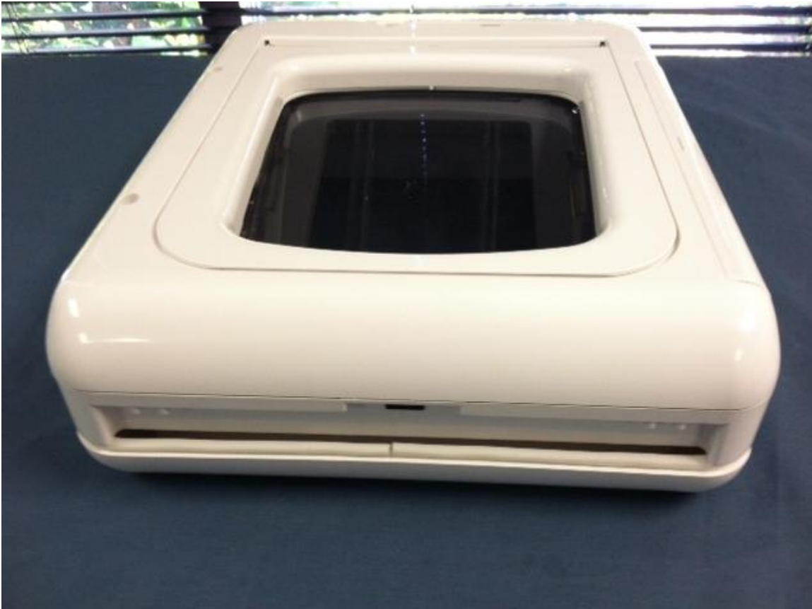
Figure 4. EUT - Side 2

FCC Part 15.209/ RSS-210 April 16, 2013 13-0013 Radio Systems Corporation 300-2564 KE3-3002564 2721A-3002564