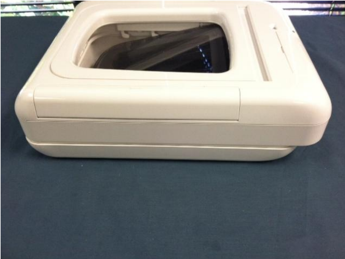
Figure 7. EUT - Battery Compartment Closed

FCC Part 15.209/ RSS-210 April 16, 2013 13-0013 Radio Systems Corporation 300-2564 KE3-3002564 2721A-3002564