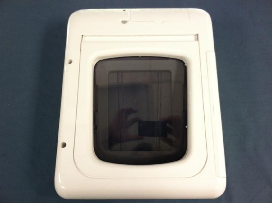
Figure 1. EUT - Front