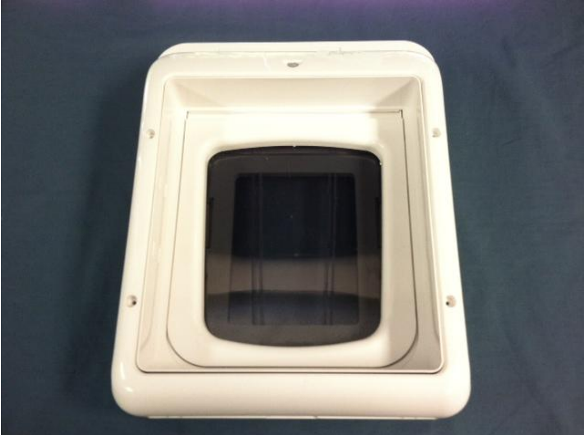
Figure 5. EUT –Back

FCC Part 15.209/ RSS-210 April 16, 2013 13-0013 Radio Systems Corporation 300-2564 KE3-3002564 2721A-3002564