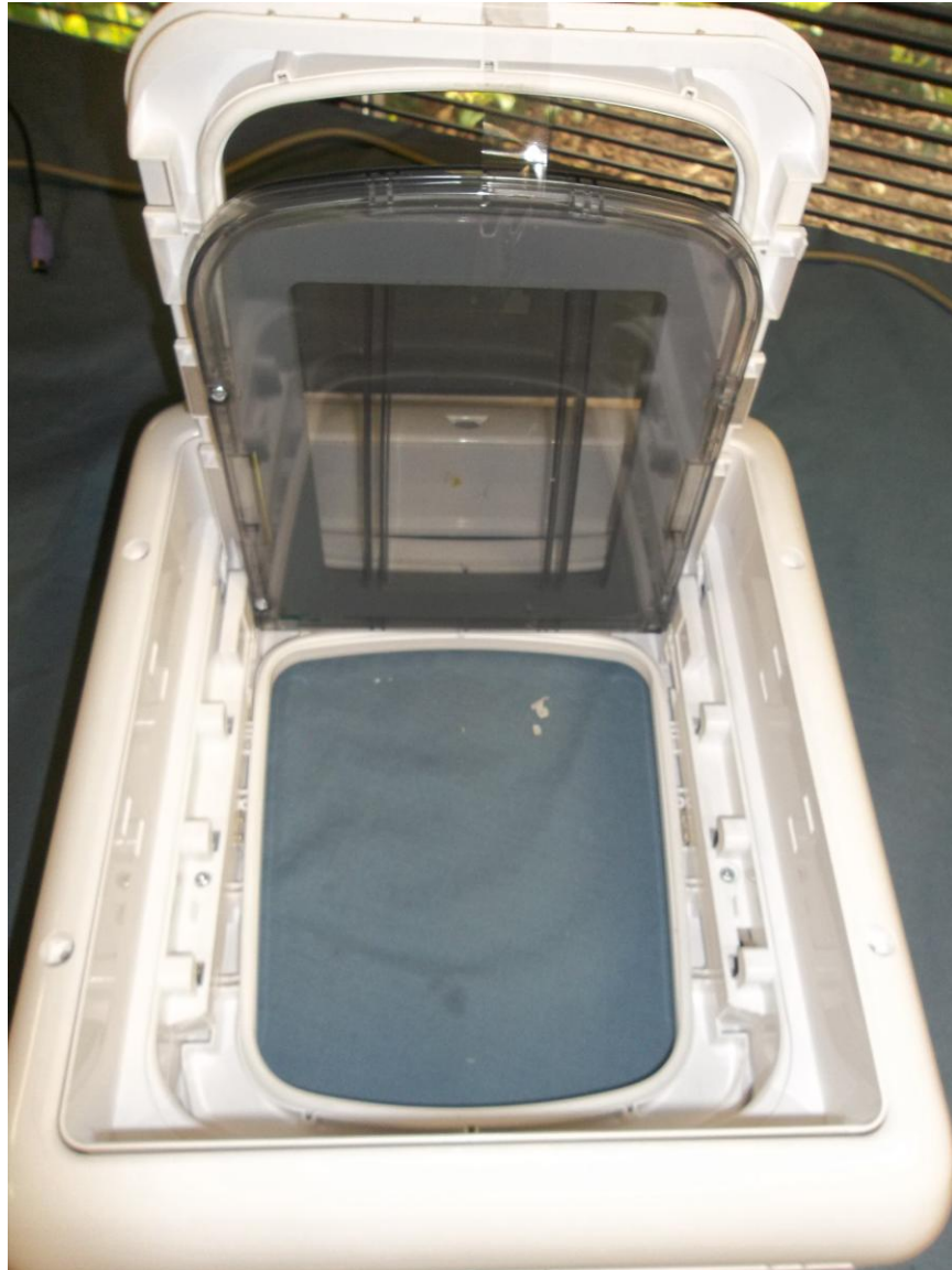
Figure 9. EUT - Pet Door Open

FCC Part 15.209/ RSS-210 April 16, 2013 13-0013 Radio Systems Corporation 300-2564 KE3-3002564 2721A-3002564