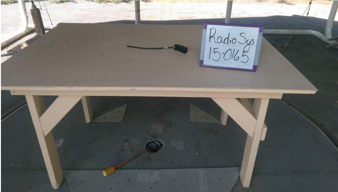
Figure 1. Radiated Emissions Test Setup, Front