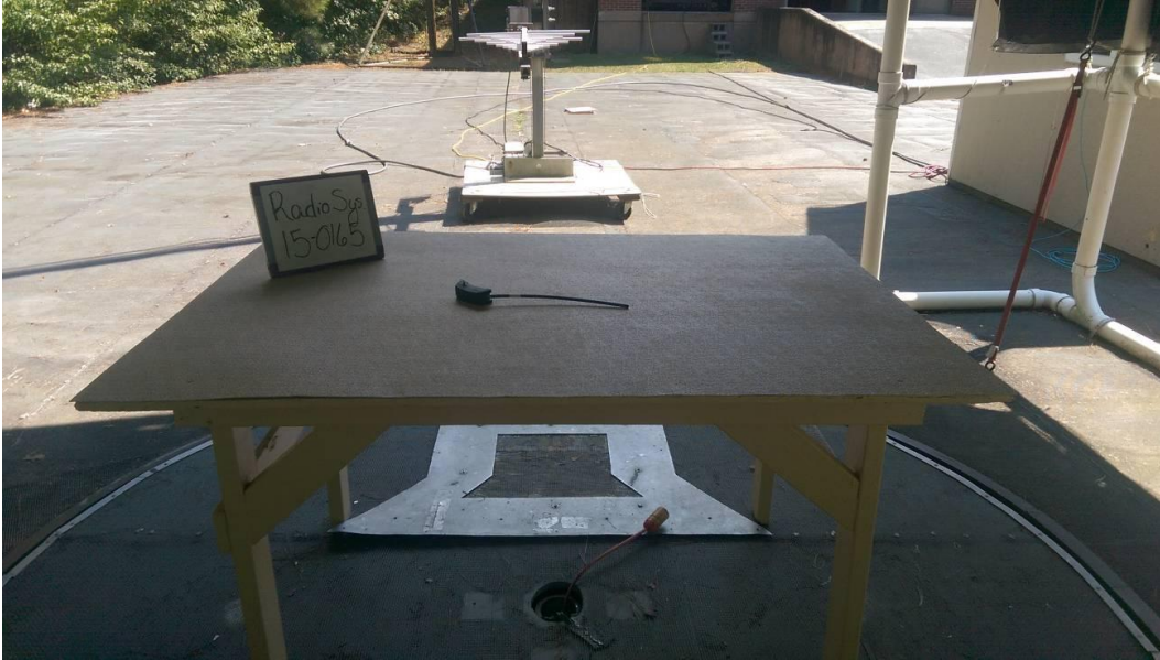
Figure 3. Radiated Emissions Test Setup, 200 MHz to 1GHz, Back

FCC Part 95 Certification KE3-3001112 15-0165 August 4, 2015 Radio Systems Corporation TEK G