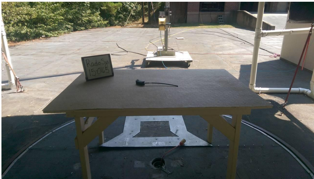
Figure 4. Radiated Emission Test Setup, above 1 GHz, Back

FCC Part 95 Certification KE3-3001112 15-0165 August 4, 2015 Radio Systems Corporation TEK G