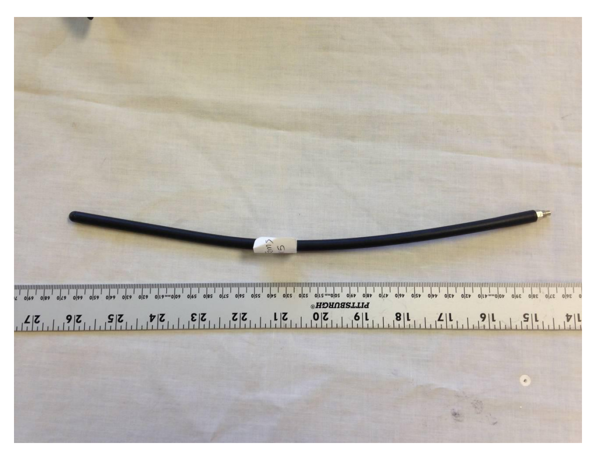
Figure 7. EUT Antenna