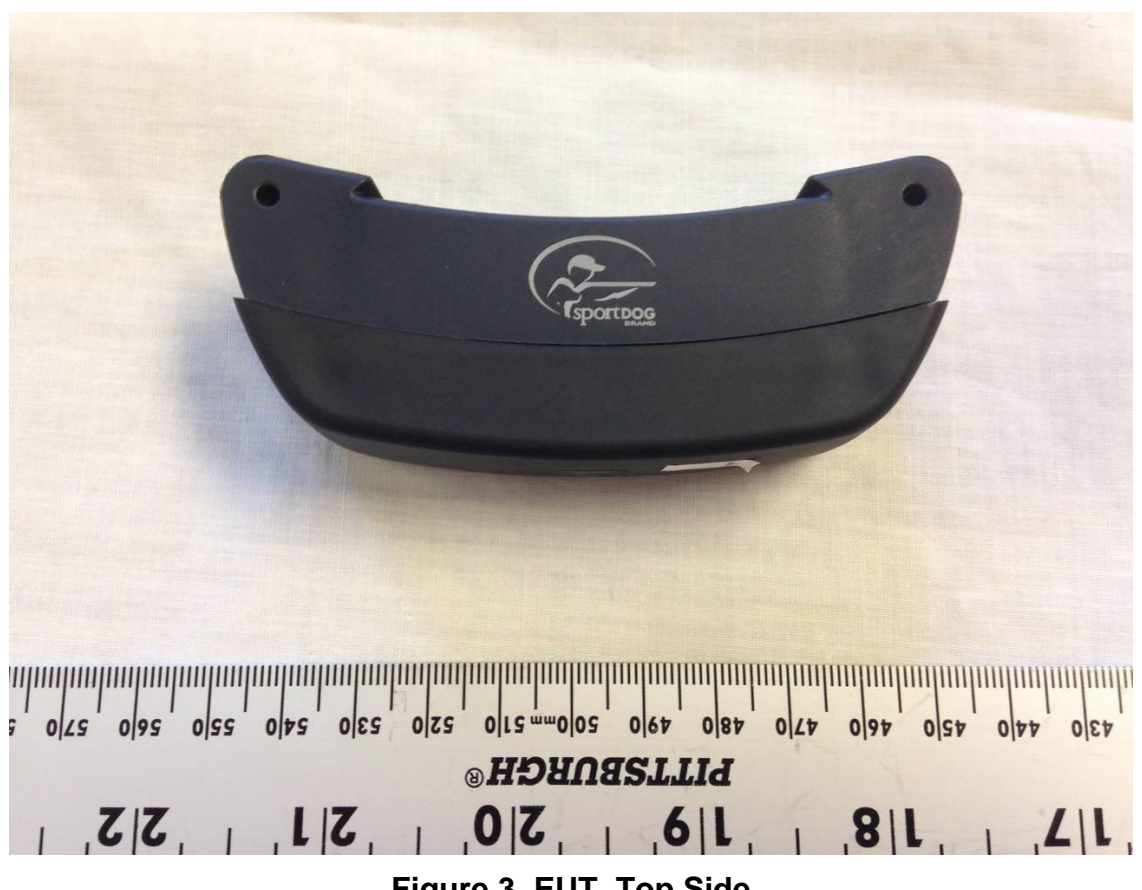
Figure 3. EUT, Top Side