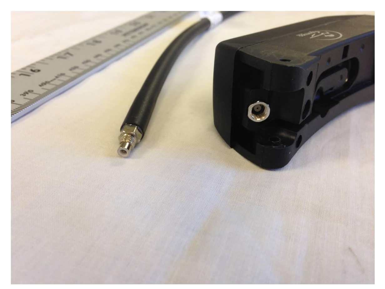
Figure 8. EUT, Unique Antenna Connector