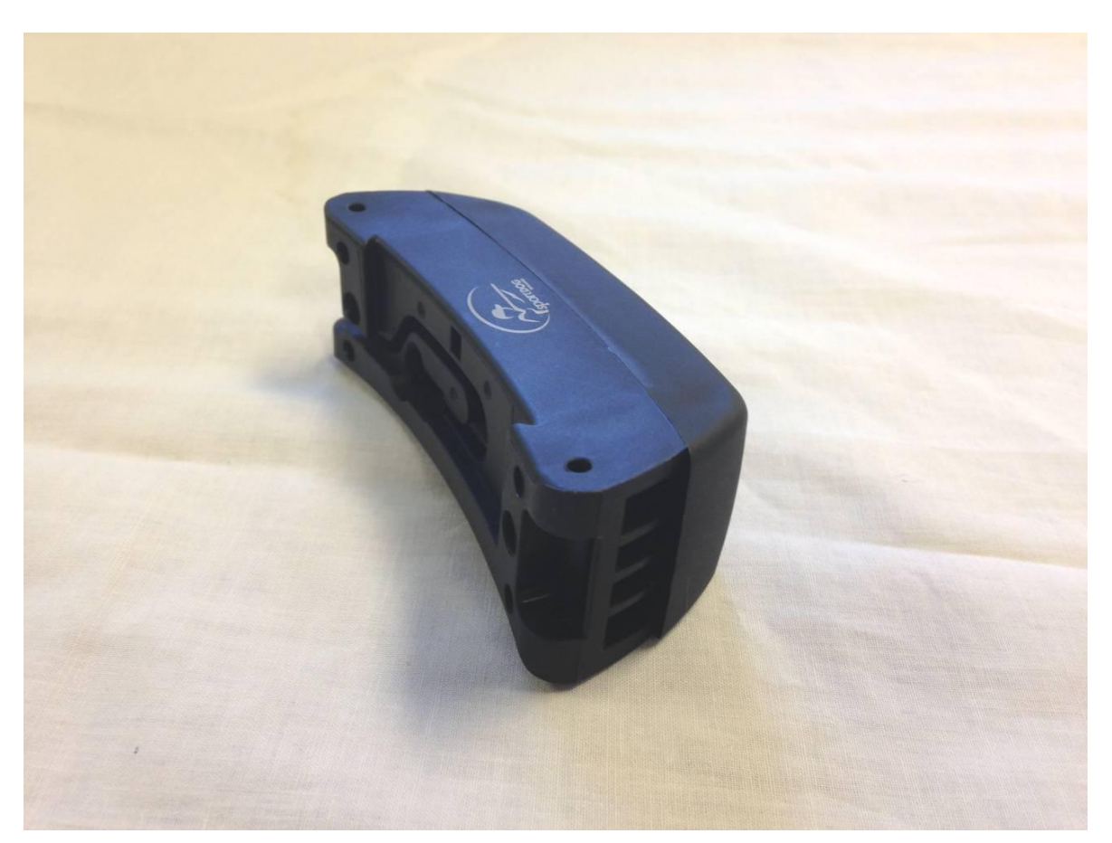
Figure 5. EUT, Side 2