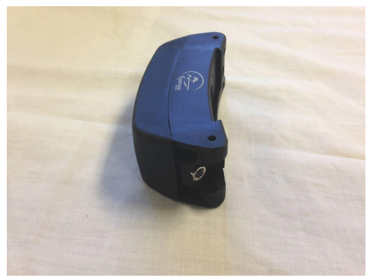
Figure 4. EUT, Antenna Port