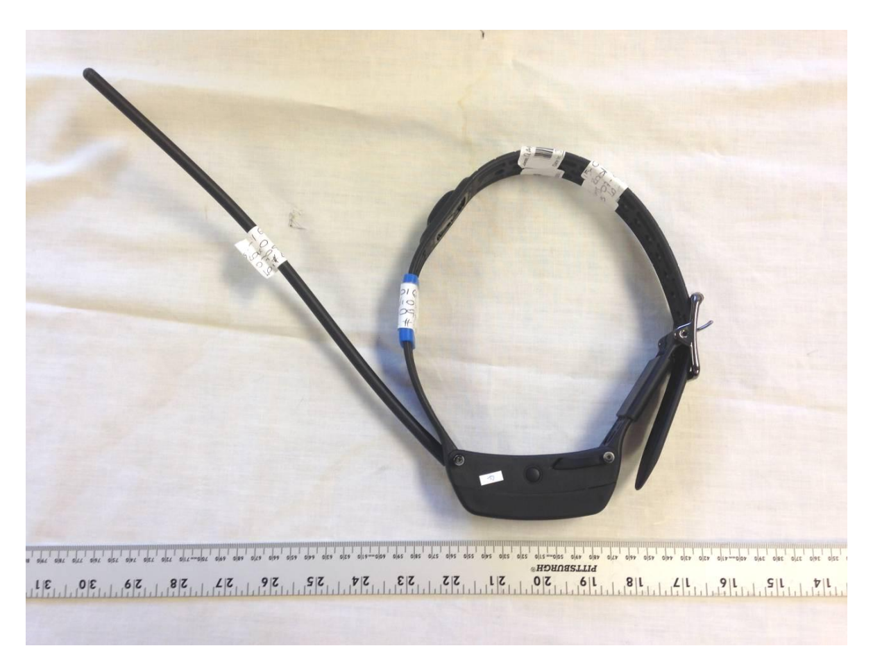
Figure 1. EUT, Full Assembly