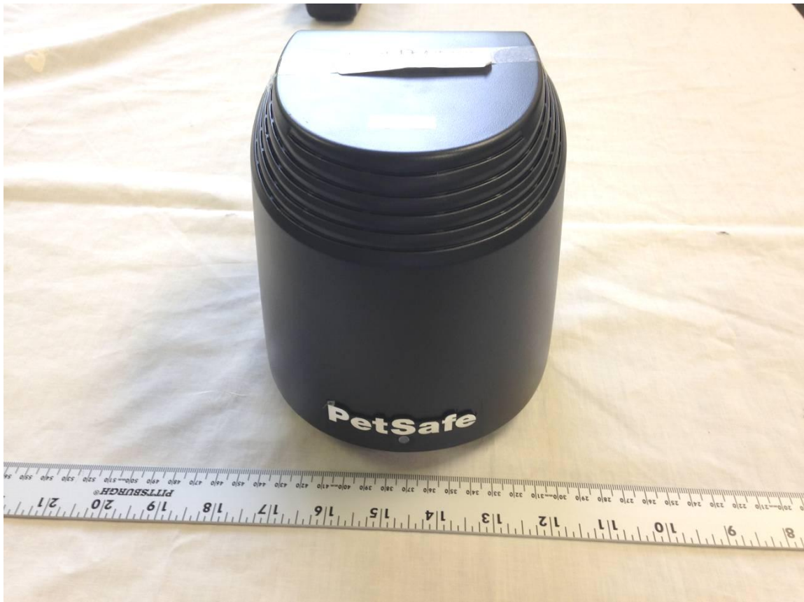
Figure 4. Front

RSS 210 KE3-3001070 2721A-3001070 15-0197 August 11, 2015 RADIO SYSTEMS CORP 300-3078