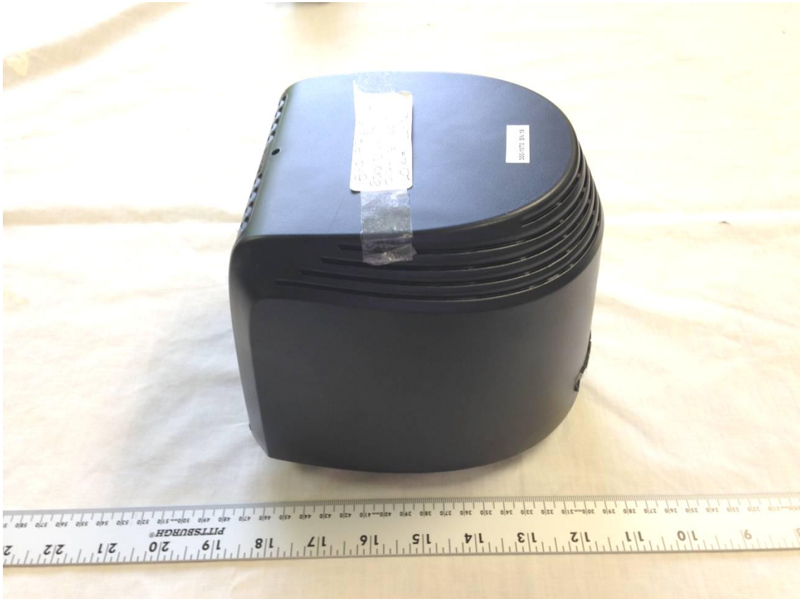
Figure 3. Side 2

RSS 210 KE3-3001070 2721A-3001070 15-0197 August 11, 2015 RADIO SYSTEMS CORP 300-3078