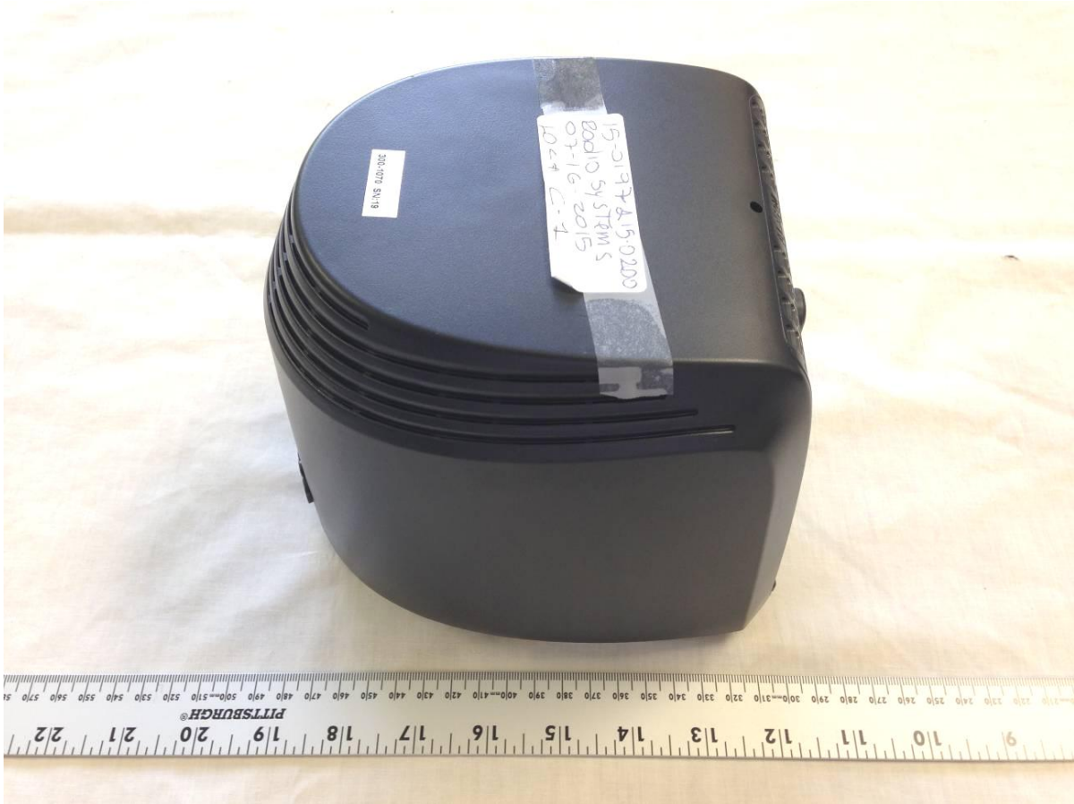
Figure 2. Side 1

RSS 210 KE3-3001070 2721A-3001070 15-0197 August 11, 2015 RADIO SYSTEMS CORP 300-3078