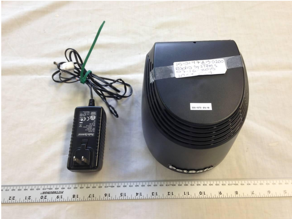
Figure 1. EUT with PSU