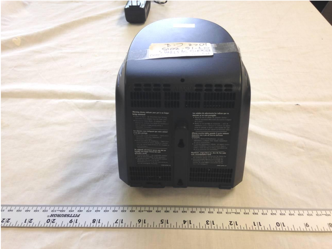
Figure 5. Back

RSS 210 KE3-3001070 2721A-3001070 15-0197 August 11, 2015 RADIO SYSTEMS CORP 300-3078