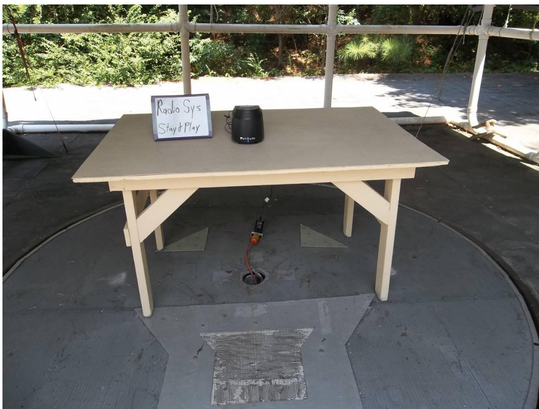
Figure 1. Radiated Emissions Test Configuration (Front)