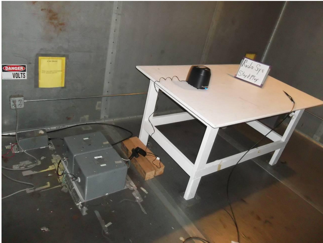
Figure 4. Conducted Emissions Test Configuration

RSS 210 KE3-3001070 2721A-3001070 15-0197 August 11, 2015 RADIO SYSTEMS CORP 300-3078